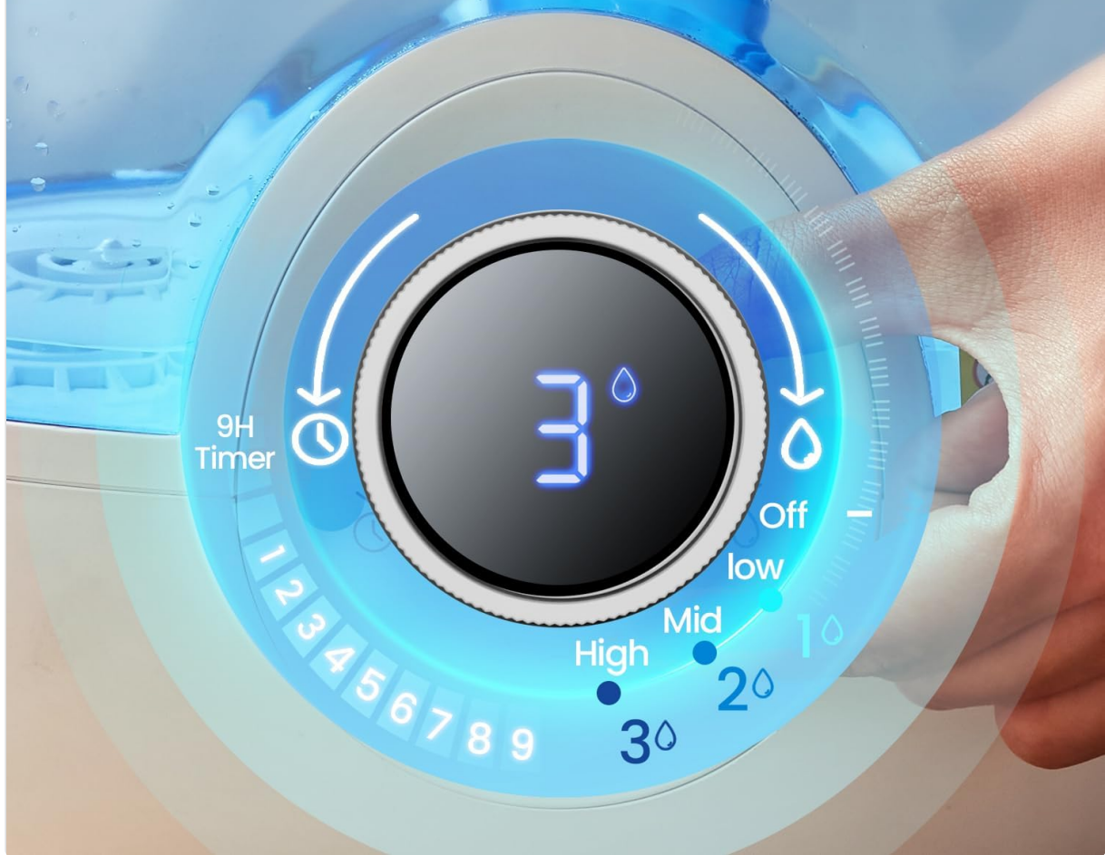
Image 4: Detailed view of the digital knob, illustrating how to adjust mist levels and set the timer.