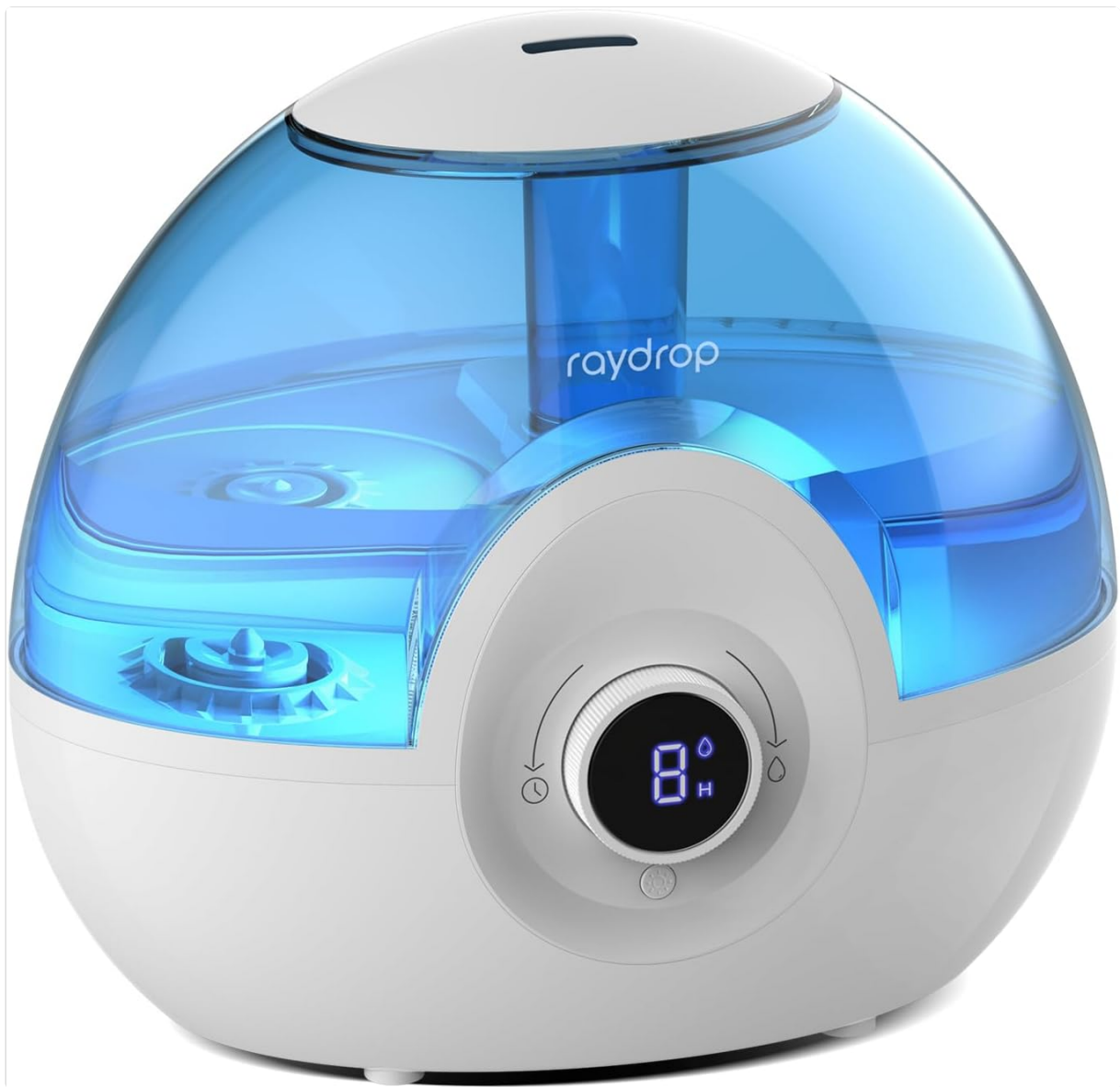
Image 1: Front view of the raydrop 2.2L Cool Mist Humidifier, Model KC-RD06S, featuring the digital knob and transparent water tank.