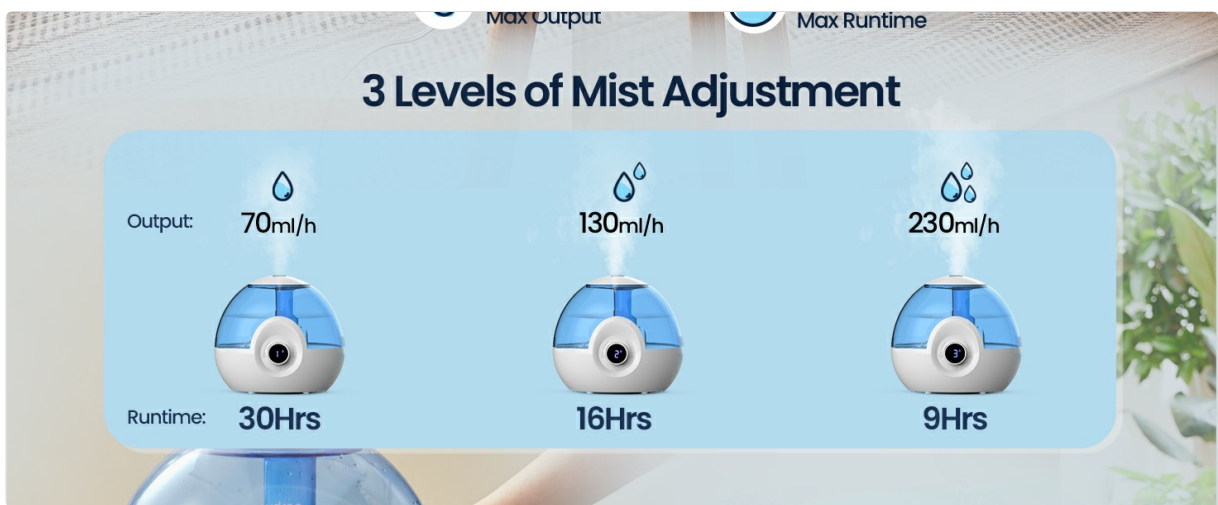
Image 5: Visual representation of the three mist adjustment levels (Low, Medium, High) and their respective runtimes (30 hours, 16 hours, 9 hours).