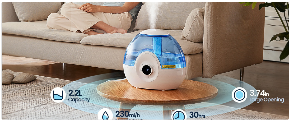
Image 3: The humidifier in use, illustrating its 2.2L capacity, 230ml/h maximum output, 30-hour runtime, and 3.74-inch large opening for easy refilling.