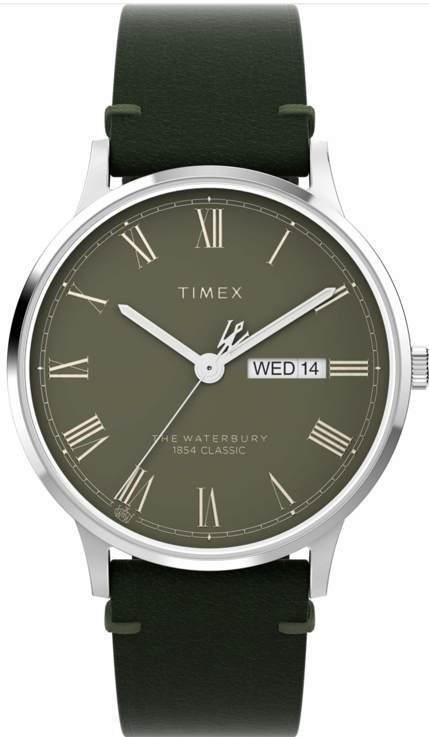
Front view of the Timex Men's Waterbury Classic 40mm Watch with a green dial and green strap.