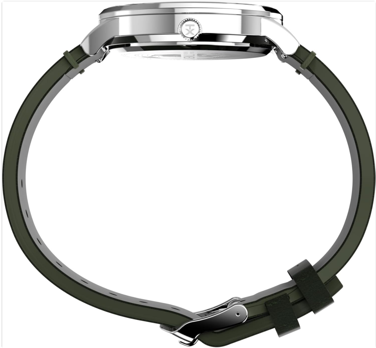
Side view of the watch, highlighting the crown used for setting time and date.