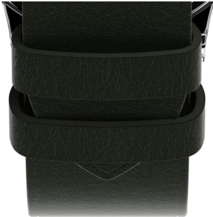
Back view of the watch, showing the green strap and buckle.