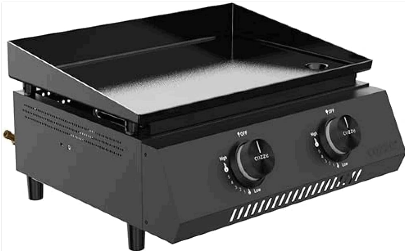
Figure 1: Cozze Deluxe Plancha, compact model without lid.

Welcome to the Cozze Deluxe Plancha user manual. This high-performance outdoor grill is designed to elevate your culinary experience on terraces and balconies. With its advanced steel burners and enameled cooking surface, it ensures precise and uniform cooking for a variety of ingredients, from juicy meats to crisp vegetables. Its compact and elegant design, featuring a matte black finish and zinc-treated construction, offers both aesthetic appeal and durability. This manual provides essential information for safe operation, setup, maintenance, and troubleshooting to ensure you get the most out of your Cozze Plancha.