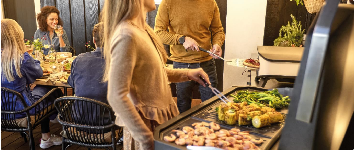
Figure 2: The Cozze Plancha in use during an outdoor gathering.