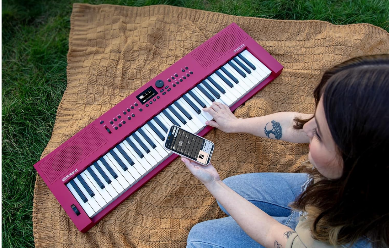
Image: A person interacting with a smartphone while playing the Roland GO:KEYS 3, demonstrating Bluetooth connectivity for music streaming or app integration.

Connect your mobile device and play along to your favorite music or learning apps via Bluetooth or USB memory.