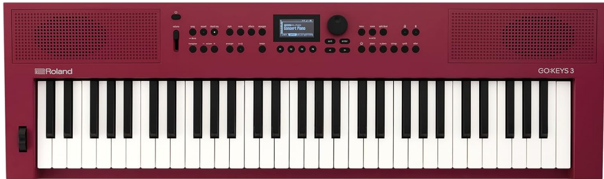
Image: Top-down view of the Roland GO:KEYS 3, highlighting the 61-note keyboard and control panel.