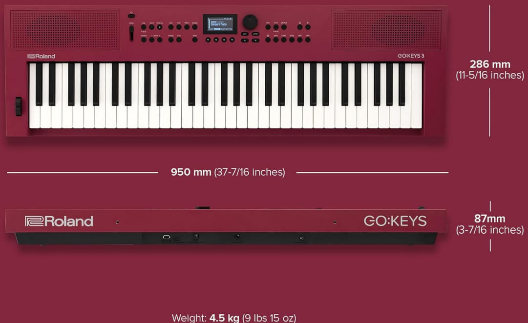
Image: Rear panel of the Roland GO:KEYS 3, showing the power input, pedal input, auxiliary input, phones/output, USB-A, and USB-C ports.