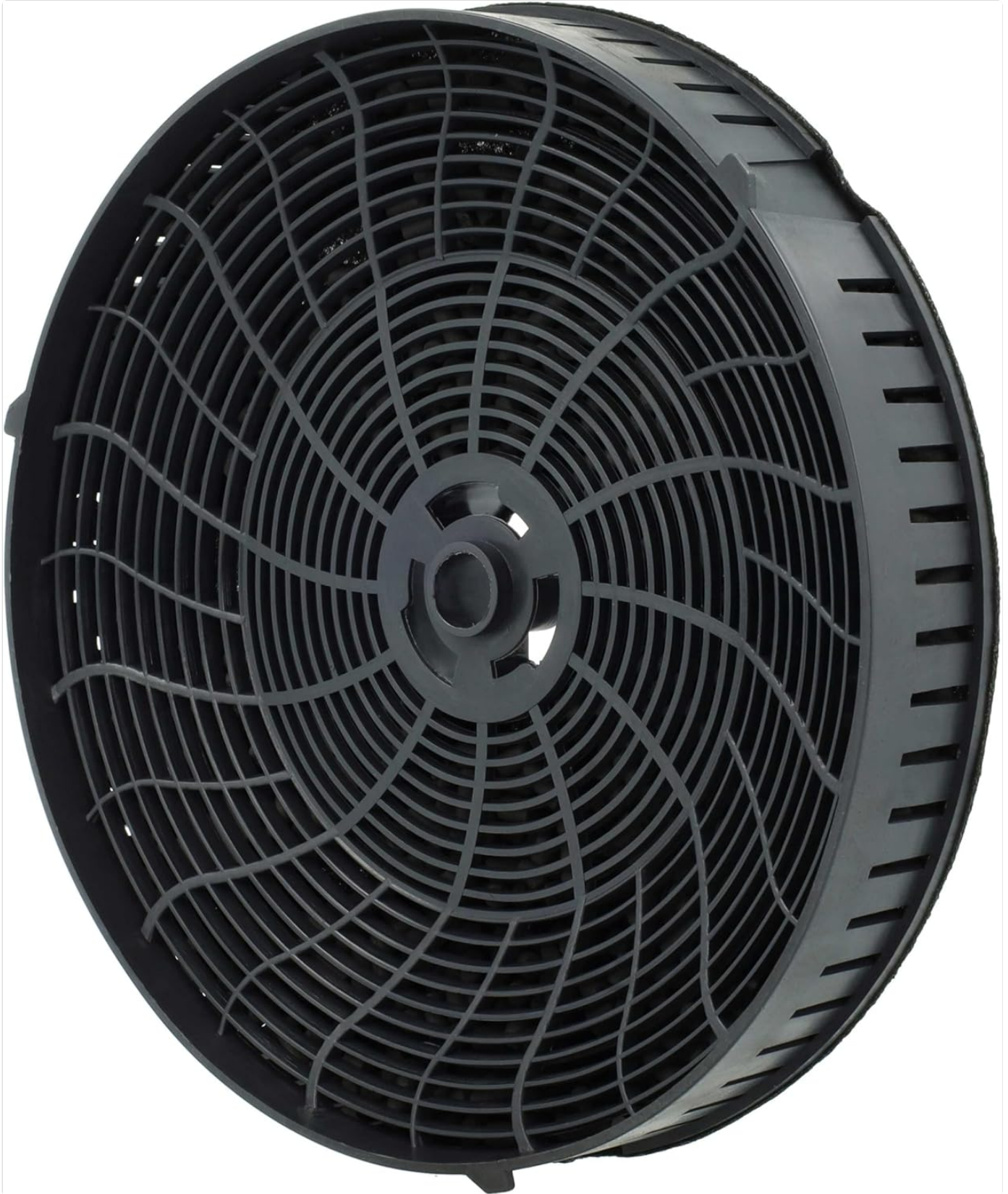
Image: Side profile of the filter, highlighting its robust construction and ventilation design.