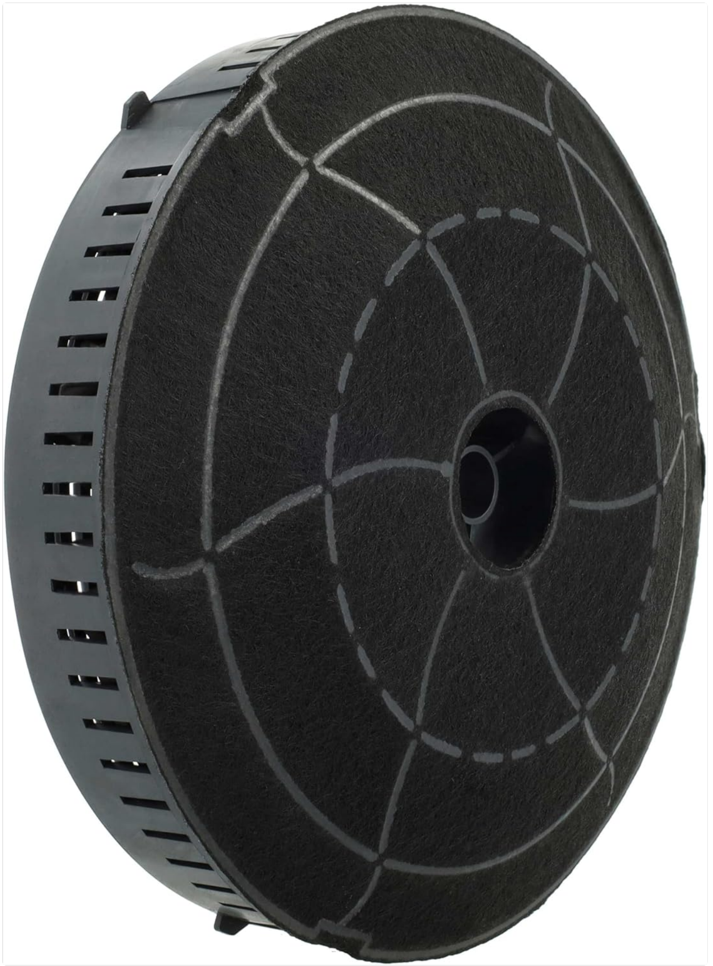
Image: A single activated carbon filter, illustrating its circular shape and the mesh structure on one side.