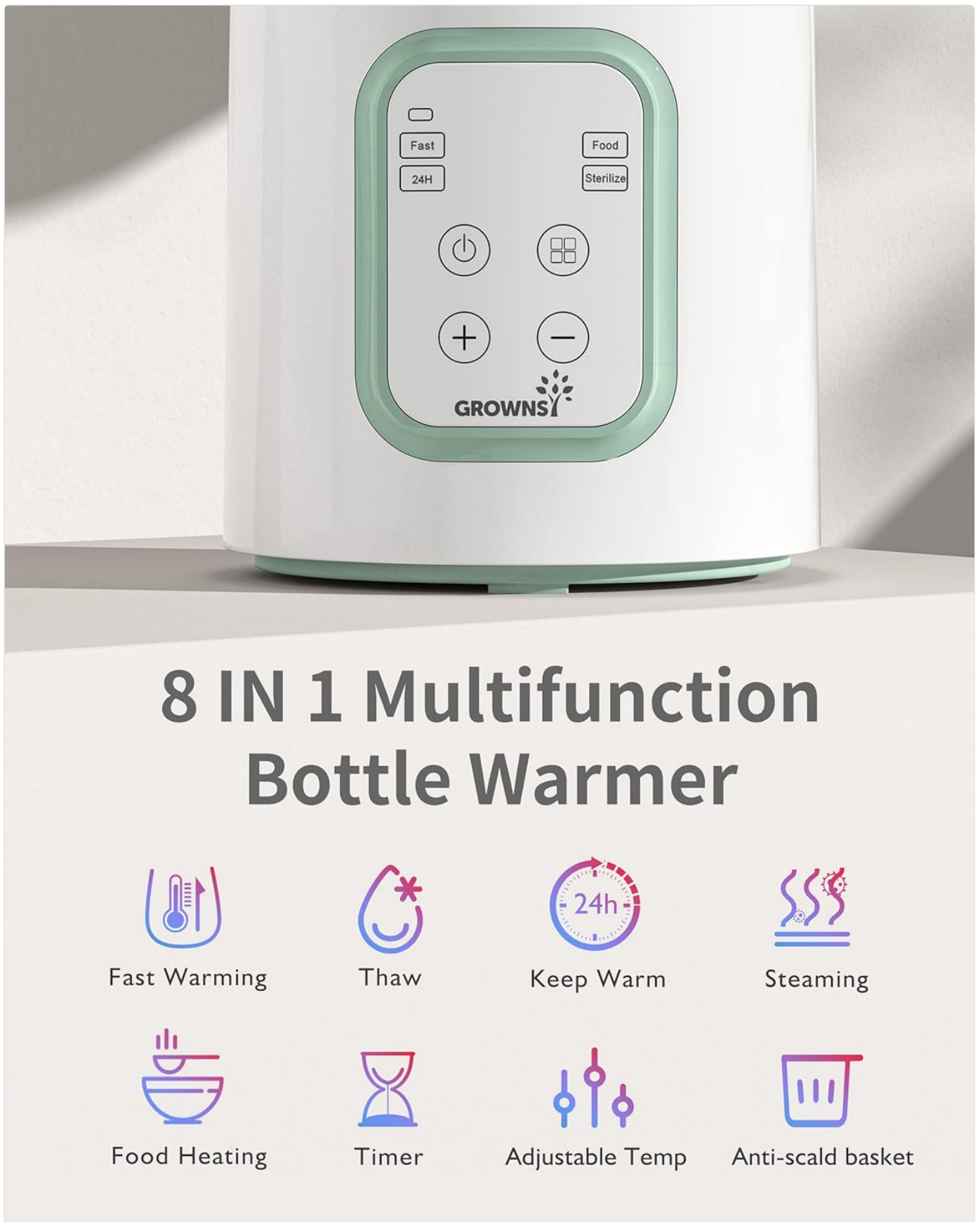
Figure 7: Overview of all 8 multifunctions of the bottle warmer.