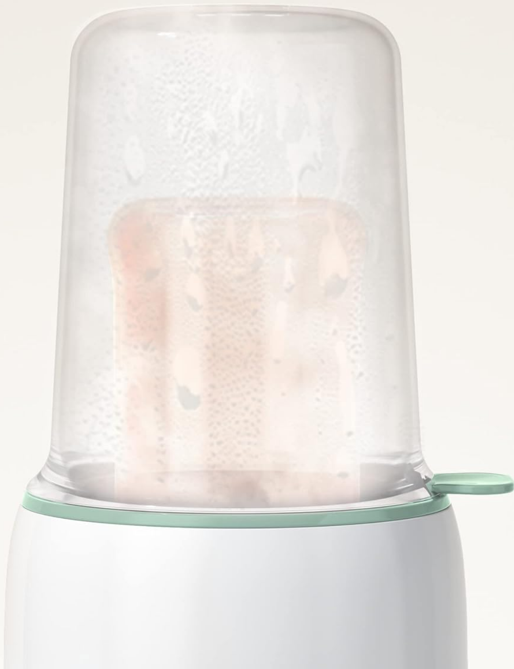
Figure 5: Steaming process, showing condensation inside the lid, indicating effective sterilization.