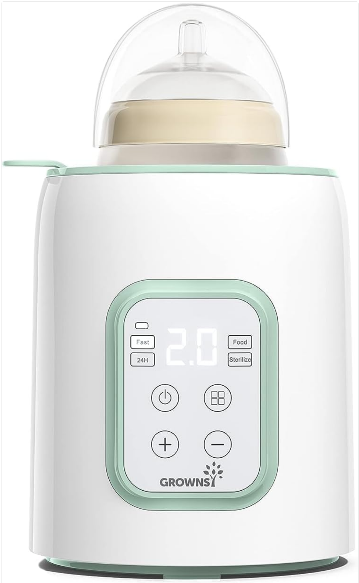
Figure 1: Front view of the GROWNSY 8-in-1 Bottle Warmer, highlighting the digital display and control panel.