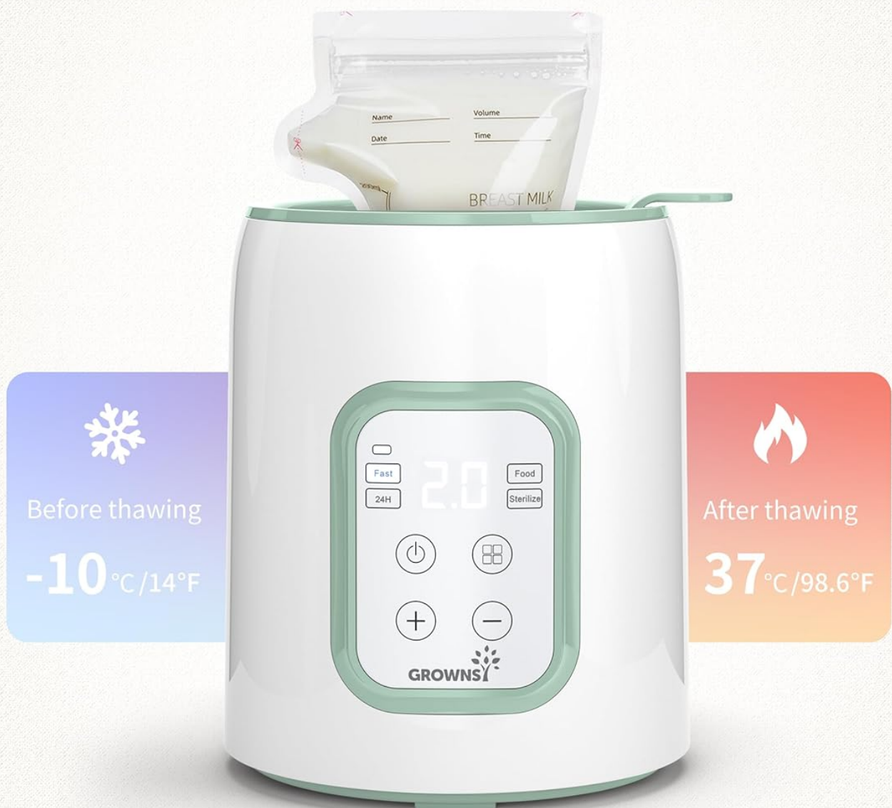
Figure 3: Defrosting breast milk, illustrating the temperature change from frozen to ready-to-warm.