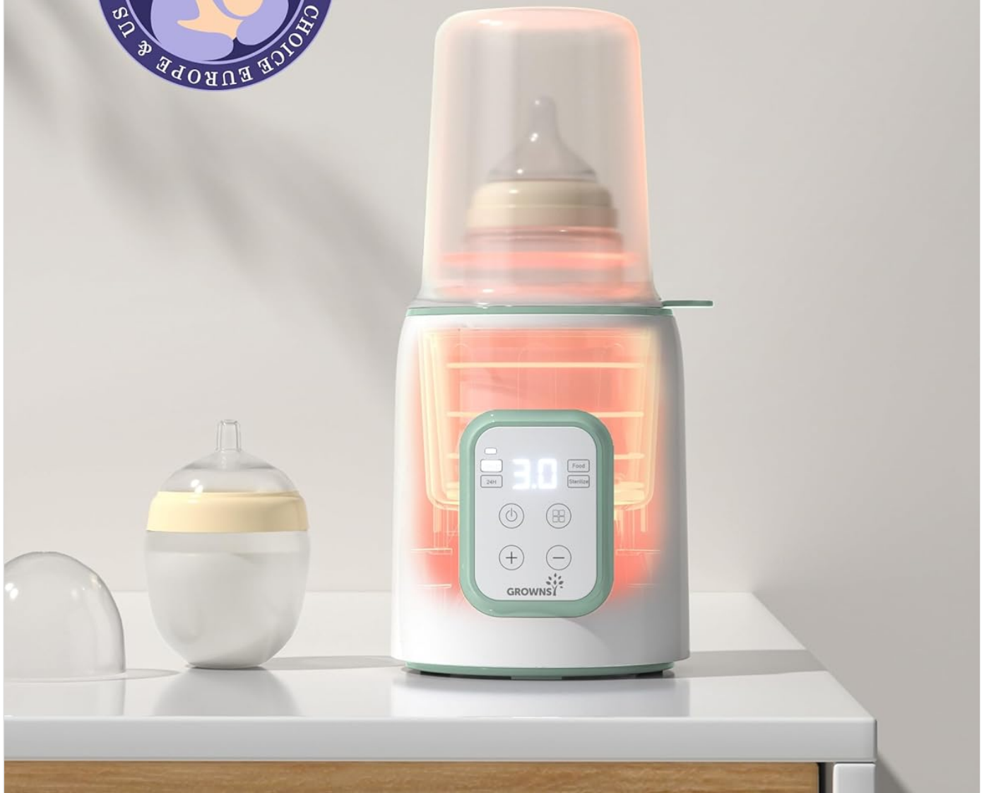
Figure 6: Smart accurate temperature control feature, allowing precise temperature adjustments.