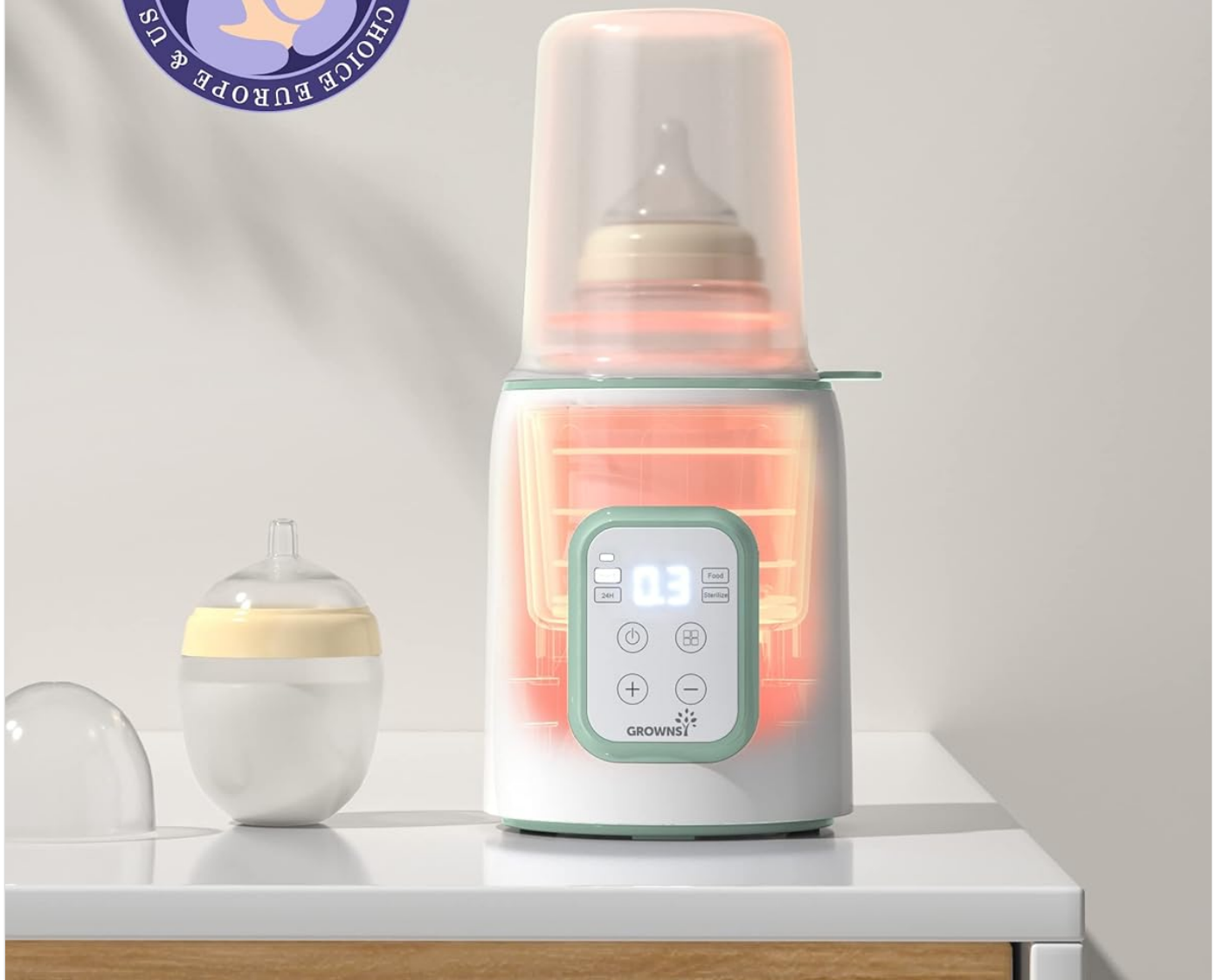
Figure 2: Fast Warming function in action, demonstrating quick heating of milk.