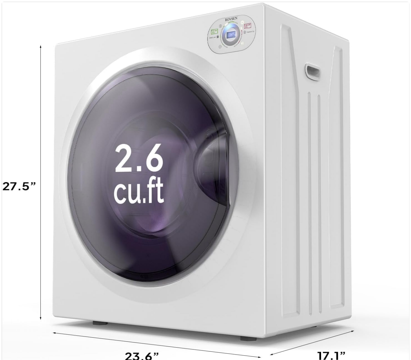
Image: Diagram illustrating the dimensions of the ROVSUN Portable Clothes Dryer: 23.6 inches (L), 17.1 inches (W), and 27.5 inches (H).