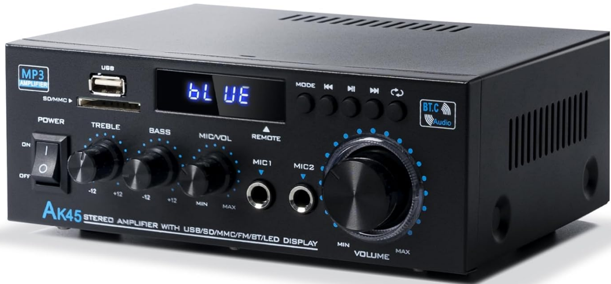
Image 1.1: NEOHIPO AK45 Stereo Receiver & Amplifier with included remote control.