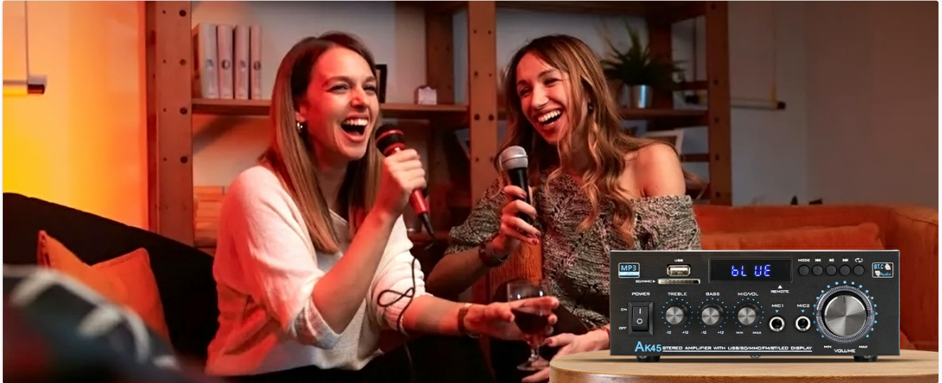
Image 5.3: The AK45 amplifier supports karaoke, allowing users to connect microphones for vocal performances.

Connect one or two microphones to the MIC1 and MIC2 jacks. Adjust the microphone volume using the "MIC VOL" knob. The amplifier is suitable for karaoke use in various settings.