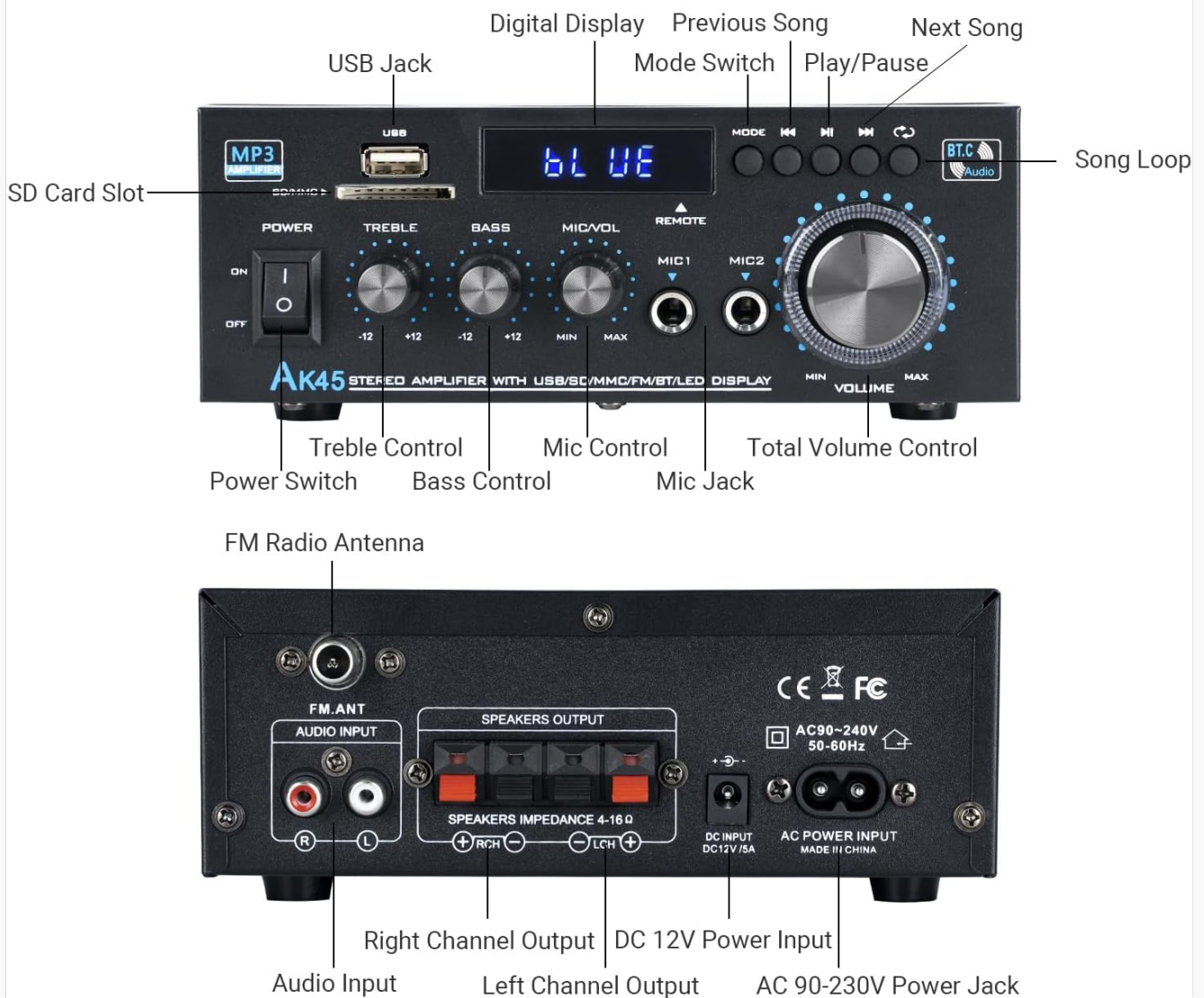
Image 3.1: Front and rear panel layout of the AK45 amplifier, indicating the function of each button, knob, and port.