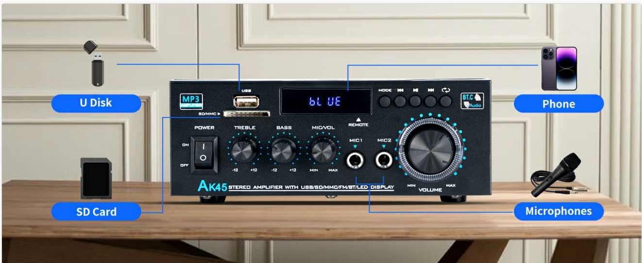
Image 4.1: Input connections to the AK45 amplifier, illustrating how to connect USB drives, SD cards, smartphones (via Bluetooth), and microphones.