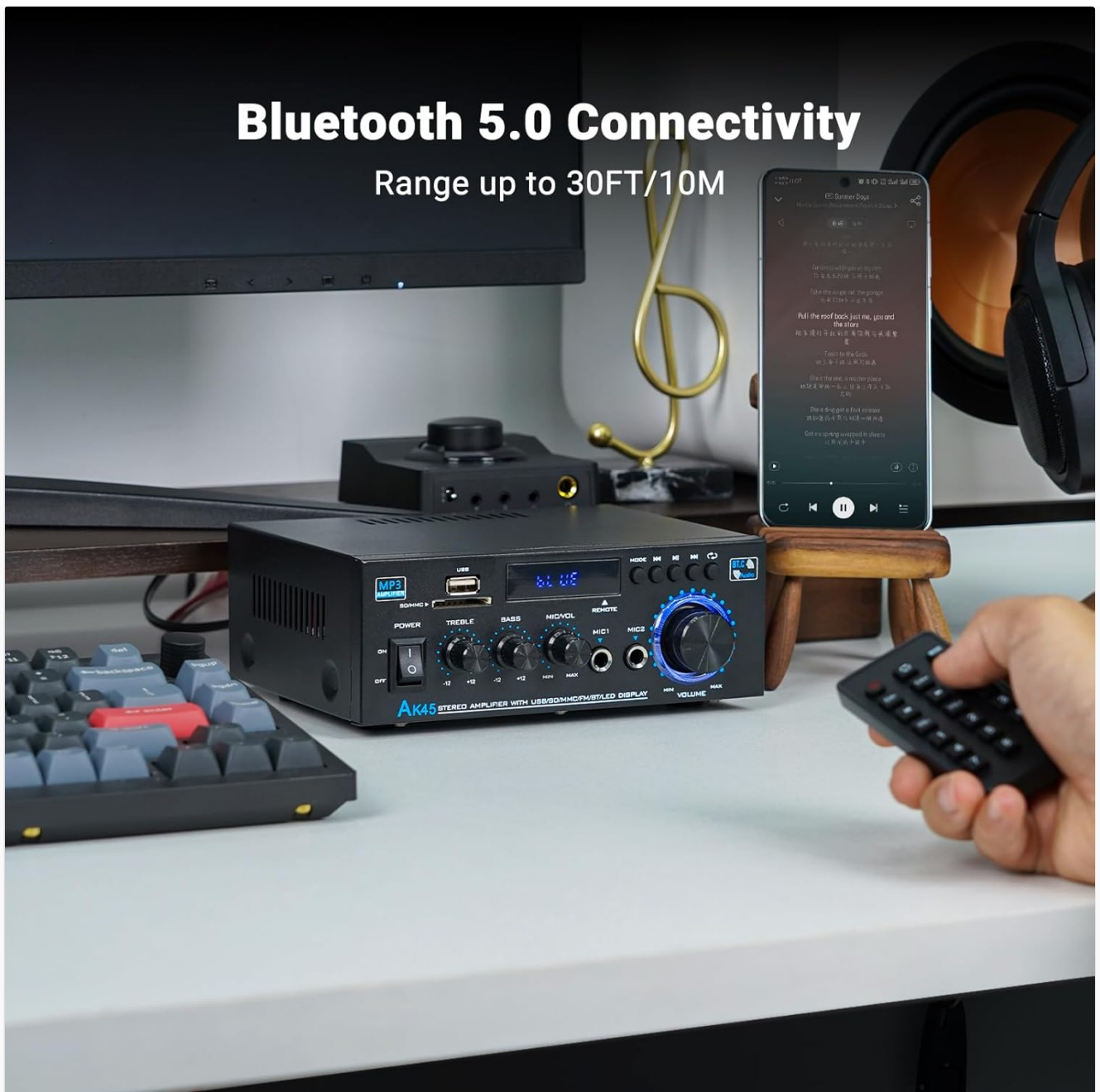
Image 5.2: Bluetooth 5.0 connectivity of the AK45 amplifier, demonstrating wireless audio streaming from a smartphone with a range of up to 30 feet (10 meters).