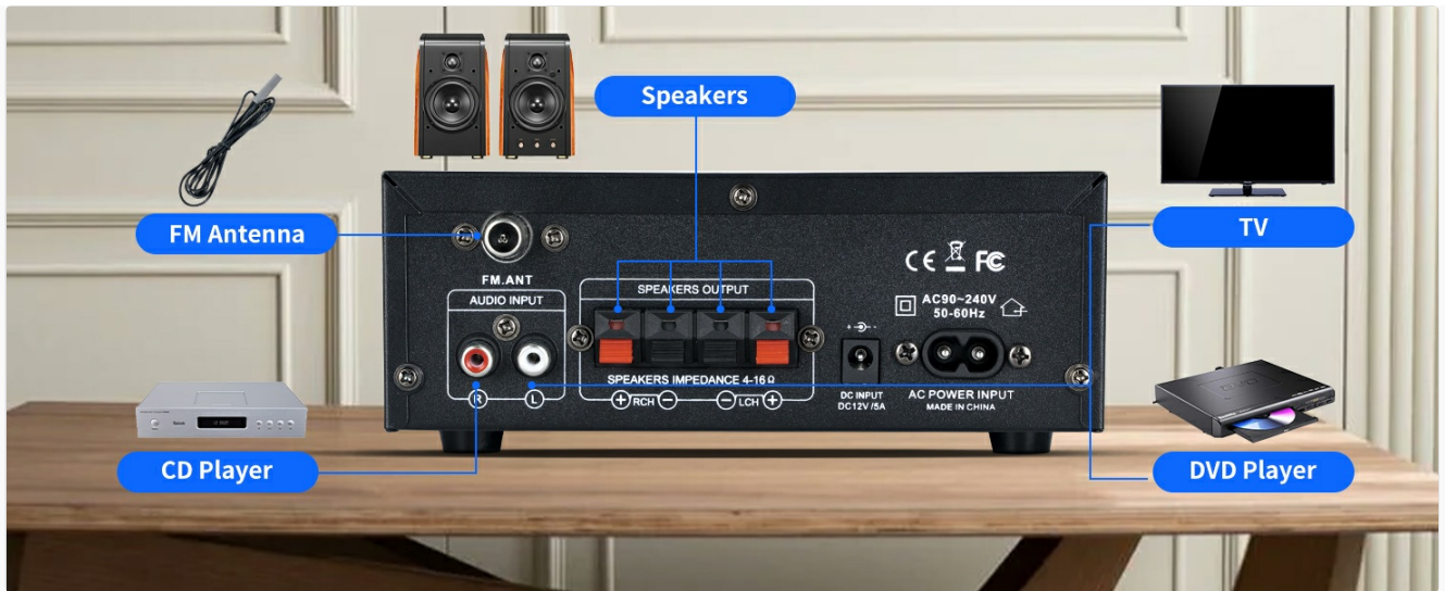
Image 4.2: Rear panel connections of the AK45 amplifier, detailing connections for FM antenna, speakers, TV, CD player, and DVD player.