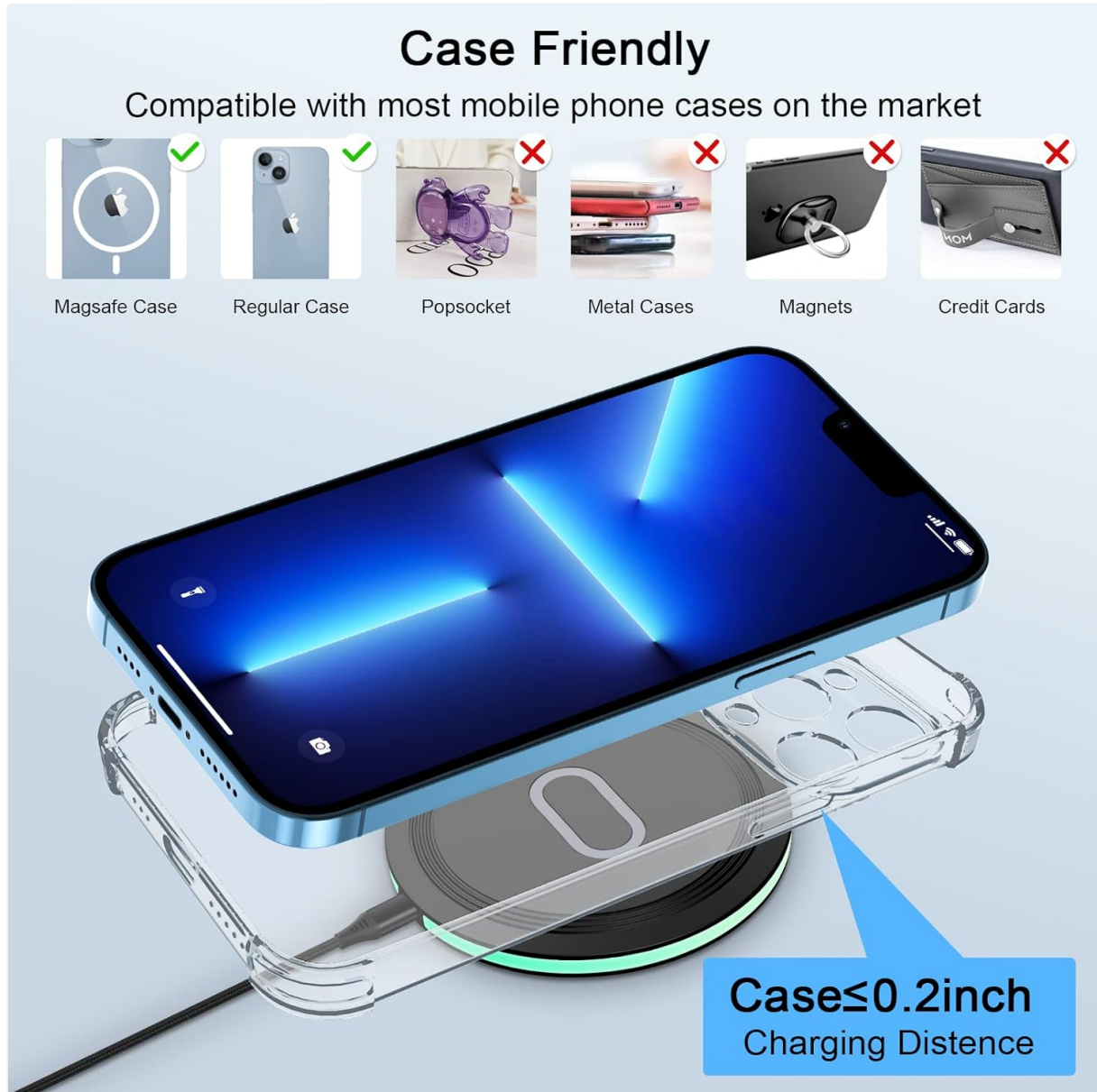
Image 5.1: Guidelines for case compatibility during wireless charging.