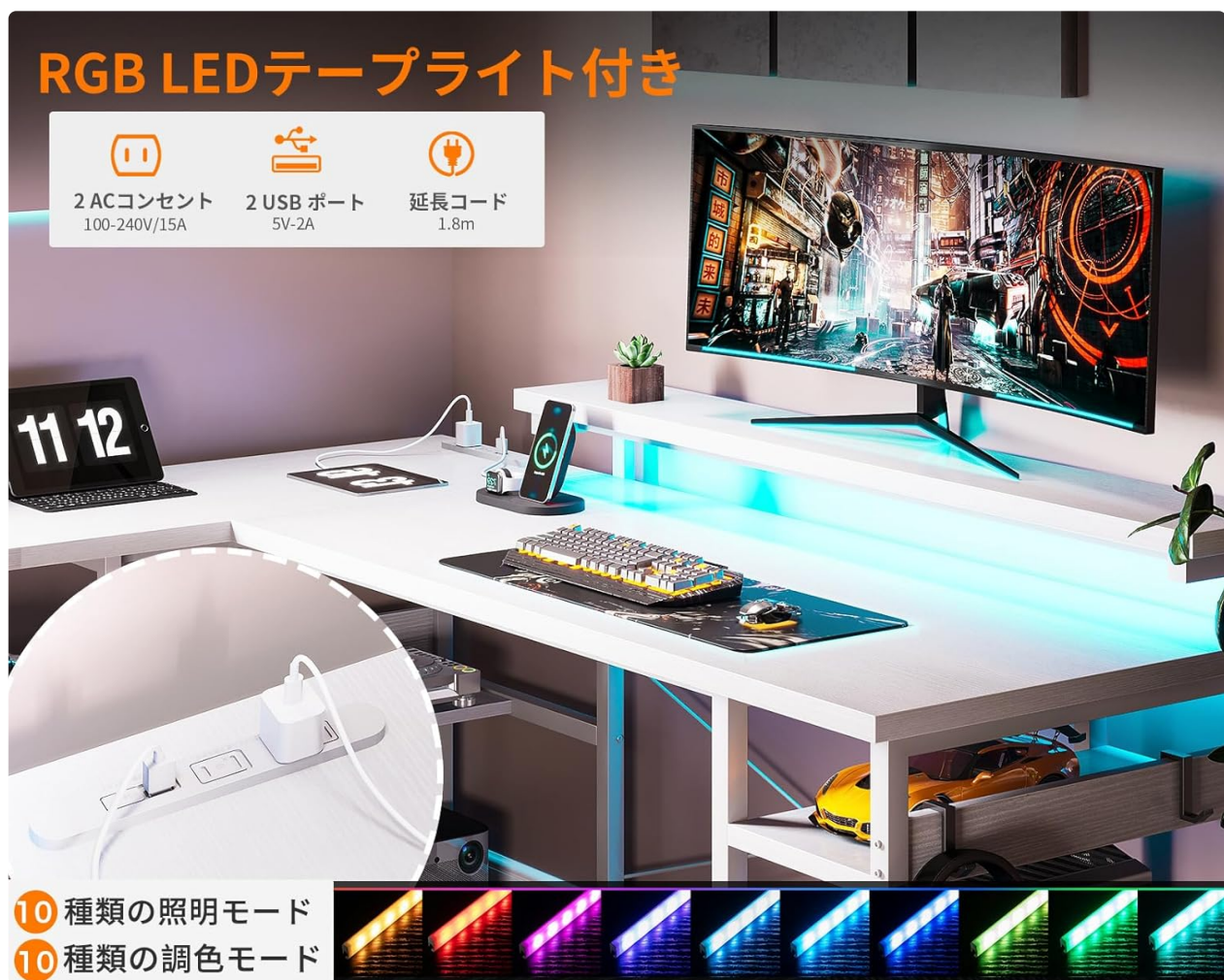
Image 5.1: The integrated power strip, showing the AC outlets and USB ports for device charging.

The desk includes a built-in power strip with two AC outlets (100-240V/15A) and two USB ports (5V-2A). Connect the desk's power cord to a wall outlet. These ports provide convenient charging for your computer, smartphone, and other electronic devices.