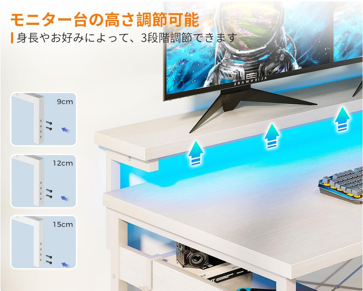
Image 5.3: The adjustable monitor stand, demonstrating the three height options for ergonomic positioning.

The monitor stand can be adjusted to three different heights: 9cm, 12cm, and 15cm. Adjust the height according to your preference to improve posture and reduce strain on your neck and shoulders during long periods of use.