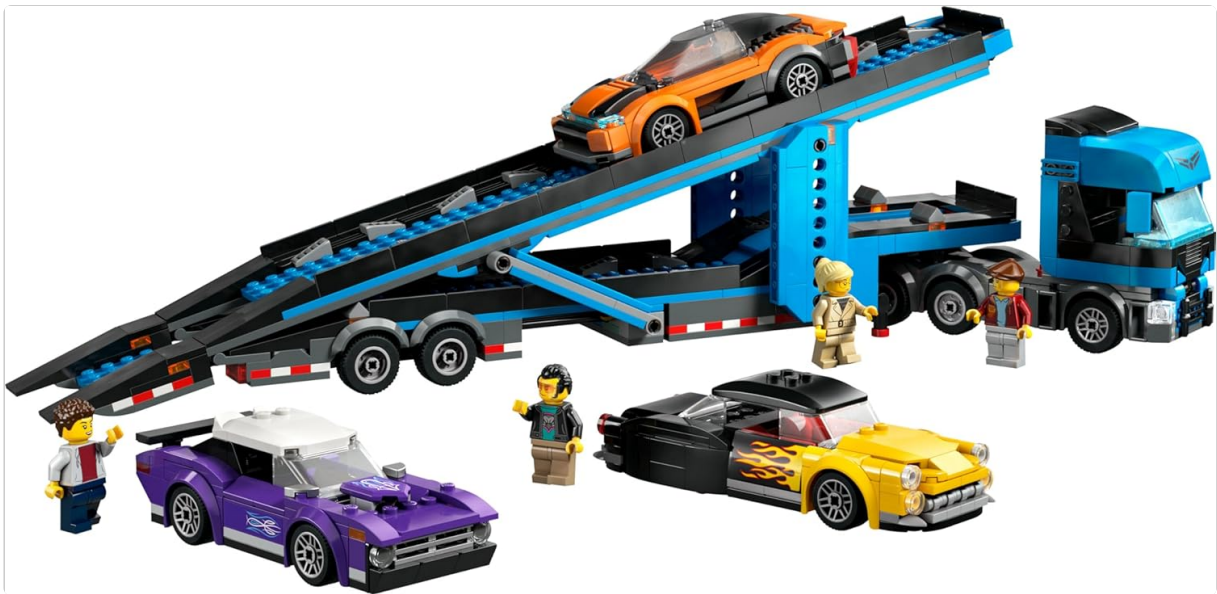
Image: Overview of the complete LEGO City Sports Car Transport Truck set with all vehicles and minifigures.