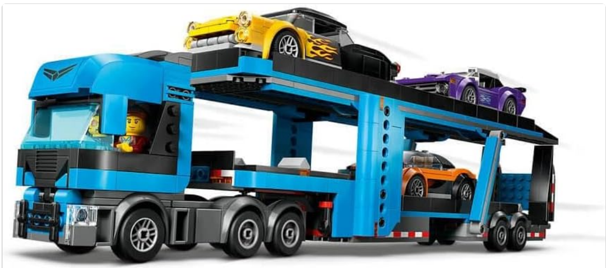
Image: The car transporter fully loaded with three sports cars on both levels.

Video: A demonstration of the LEGO City Transport Truck with Sports Cars, showcasing its assembly and interactive features like loading and unloading vehicles.