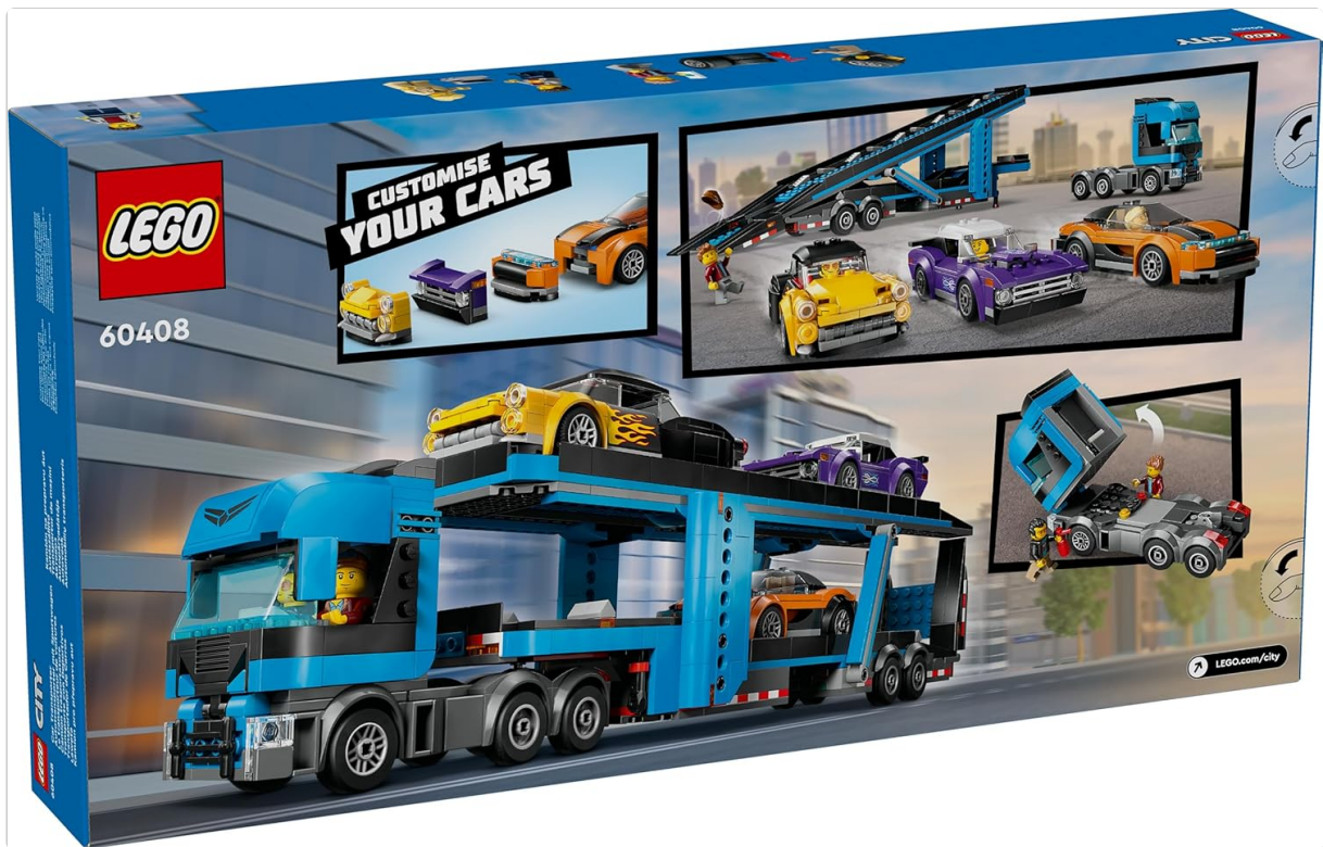
Image: The product packaging, illustrating the assembled set and its interactive features.