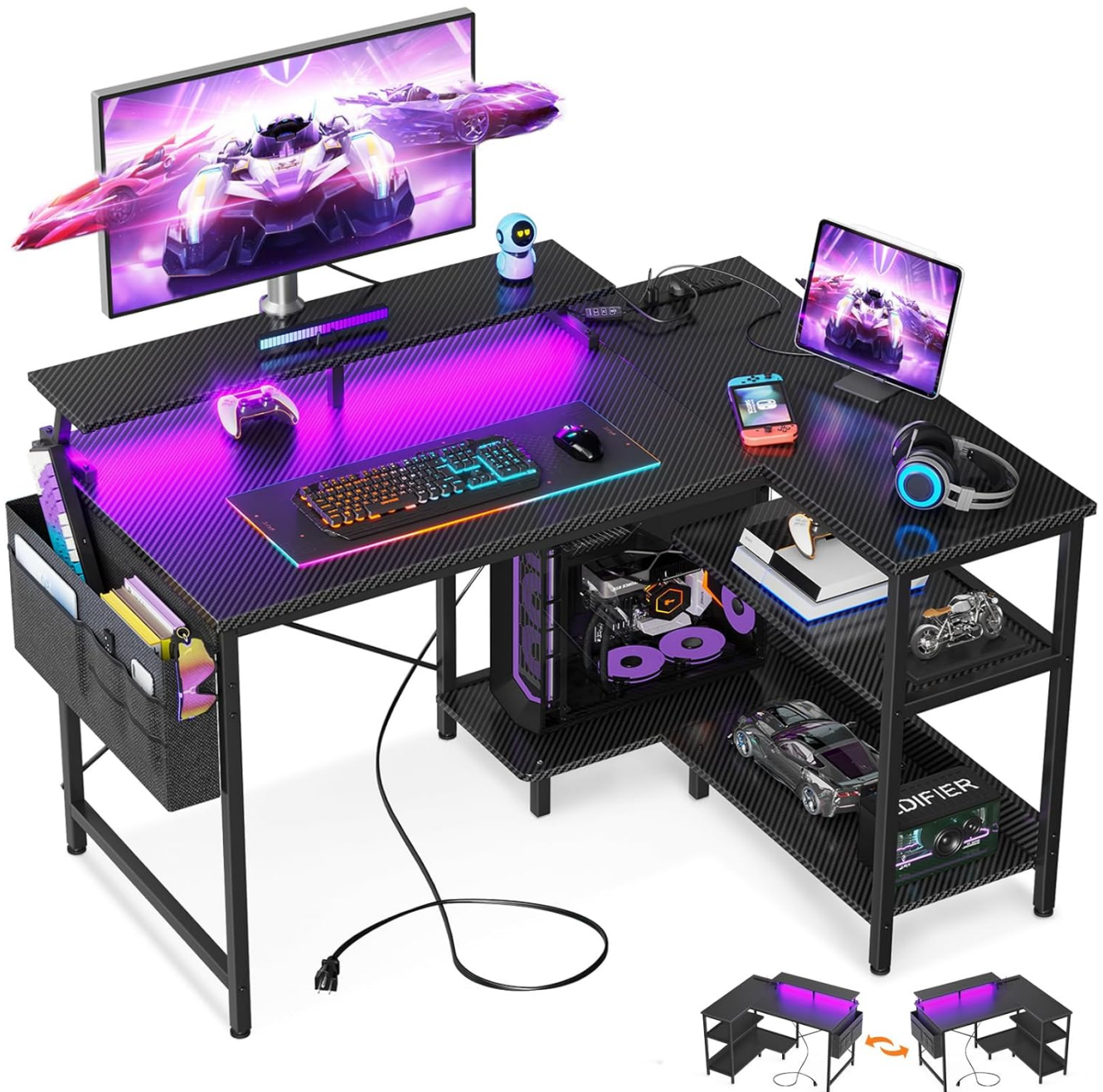
Image: The ODK 40 Inch Gaming Desk, showcasing its L-shaped design, integrated LED lighting, and power outlets. A monitor, keyboard, and mouse are set up on the desk, with storage shelves visible below.