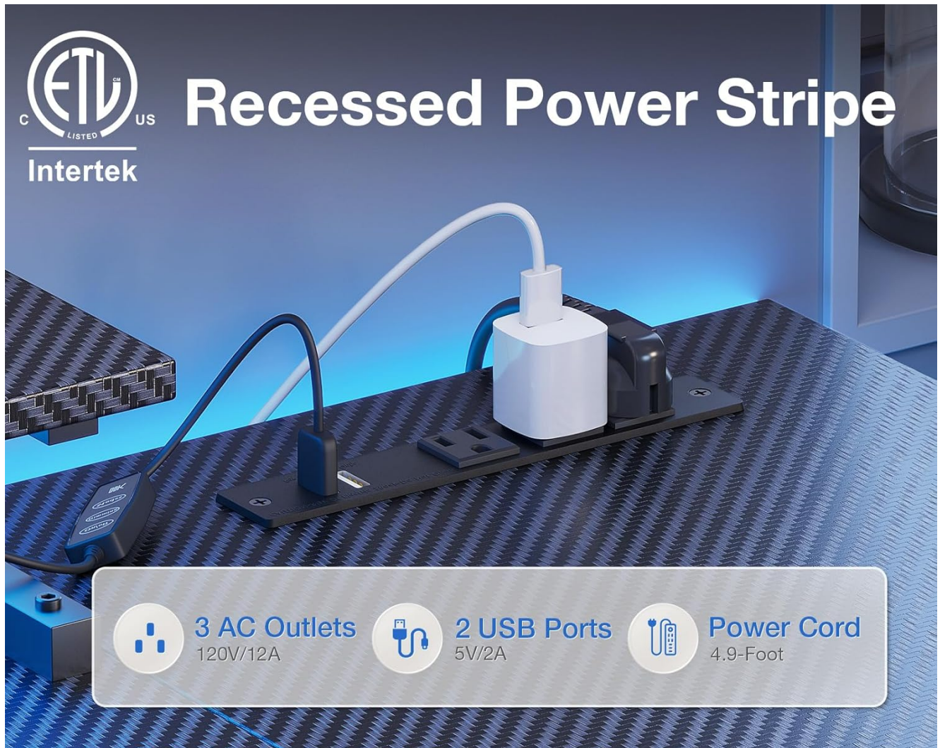
Image: A close-up view of the recessed power strip integrated into the desk, showing the 3 AC outlets and 2 USB charging ports, with devices plugged in.

Simply plug the desk's main power cord into a wall outlet. You can then connect your electronic devices, such as smartphones, gaming gear, or Bluetooth devices, directly to the integrated outlets and USB ports.