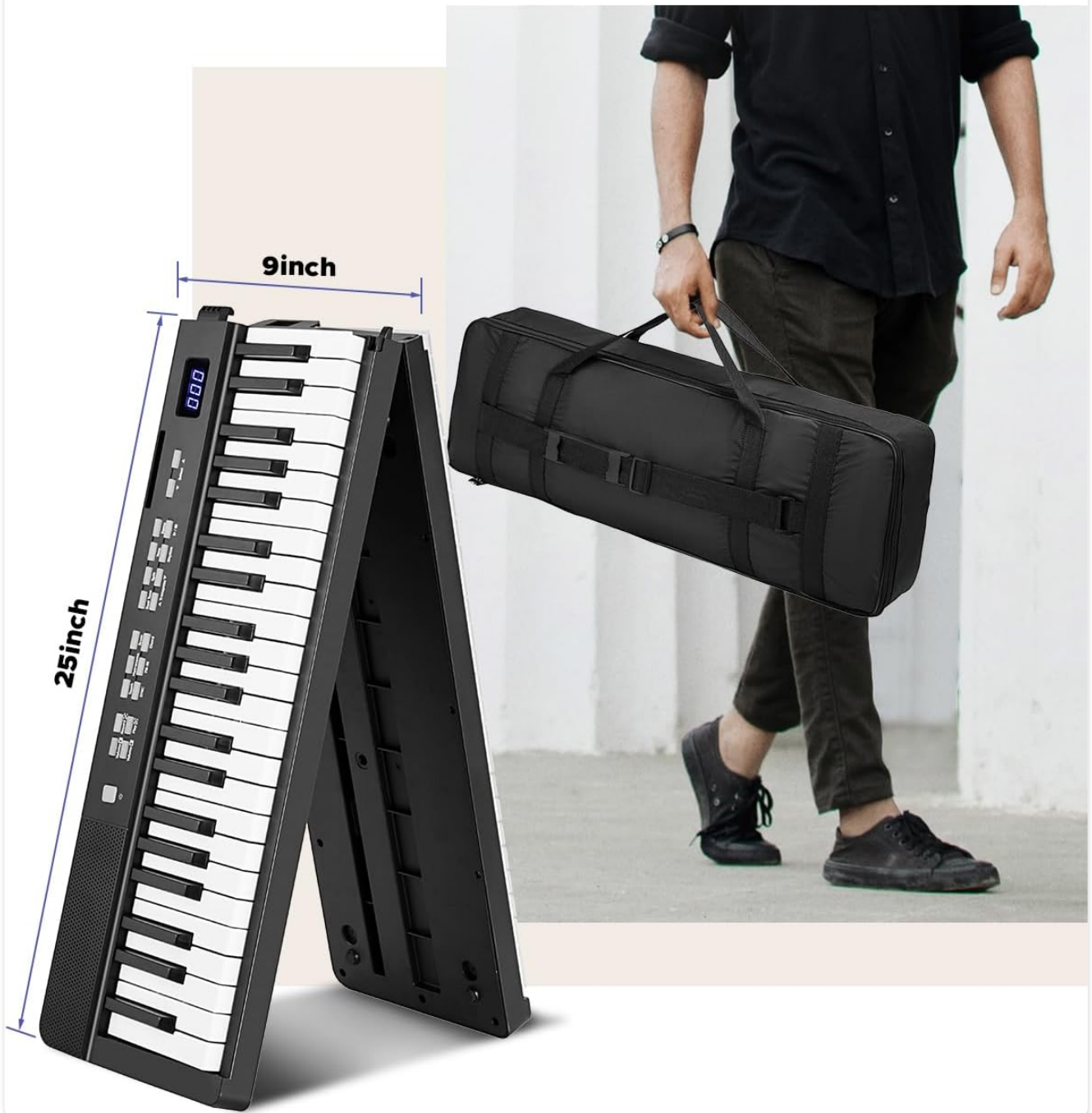
Image: The SP-15F in its folded state, positioned beside its dedicated carrying bag, illustrating its compact and portable design for convenient storage and travel.

Outdoor or Indoor Use with The Light Weight of 7.4lb