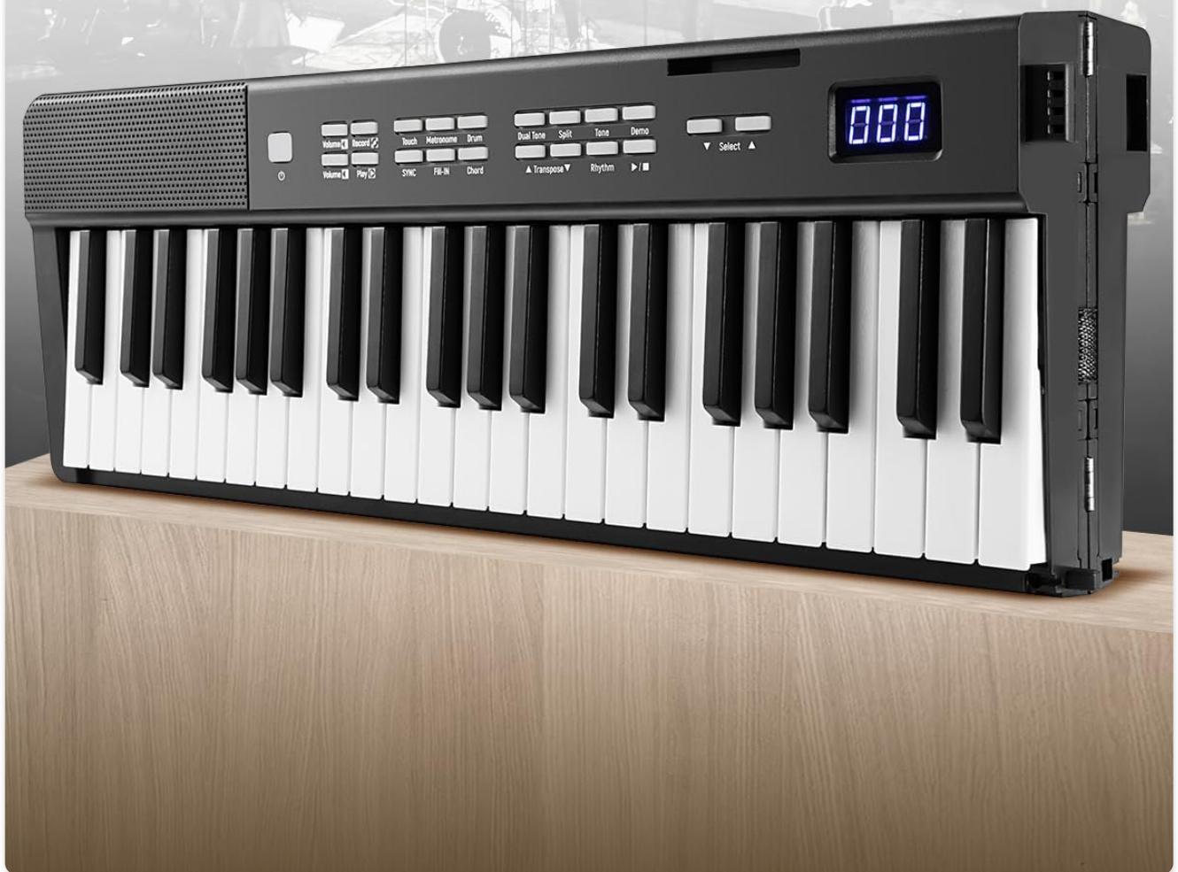
Image: A visual representation of the SP-15F's key features, including Auto Chord, Transpose, Metronome, Recording, Bluetooth connectivity, Headphone Jack, Dual Keyboard mode, and MIDI functionality.