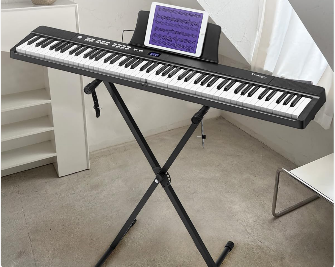
Image: The SP-15F's control panel and display, indicating its extensive sound library with 128 rhythms, 128 timbres (tones), and 80 built-in demo songs for diverse musical exploration.

Whole beginner kit with extra piano stand and big headphone, you can play with your loved one or with yourself.