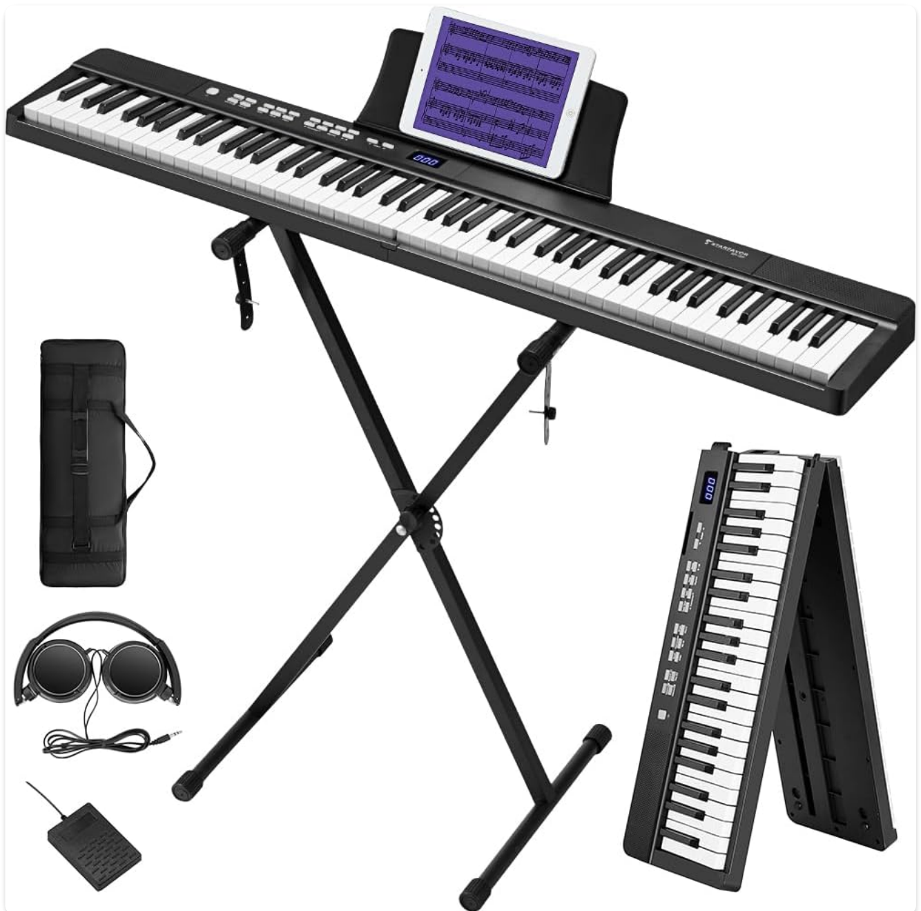
Image: The Starfavor SP-15F electronic piano displayed with all its accompanying accessories, including the foldable stand, headphones, sustain pedal, and a convenient carrying bag.