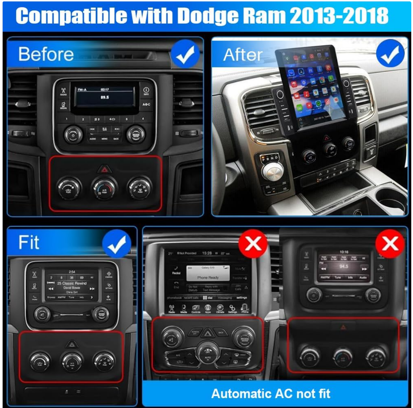
Image 4.1: Visual guide for vehicle compatibility, highlighting manual AC requirement.

Important Note: This unit is only compatible with vehicles equipped with Manual Air Conditioning (AC) controls. It is not compatible with vehicles that have Automatic AC controls.