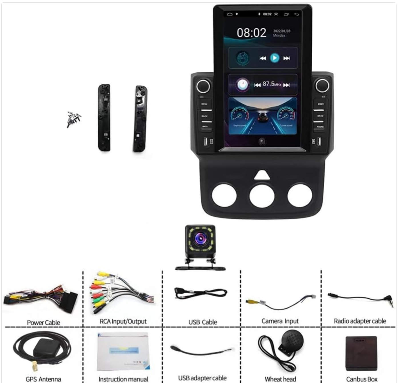
Image 3.1: Included components with the Lodderly Car Radio Stereo.