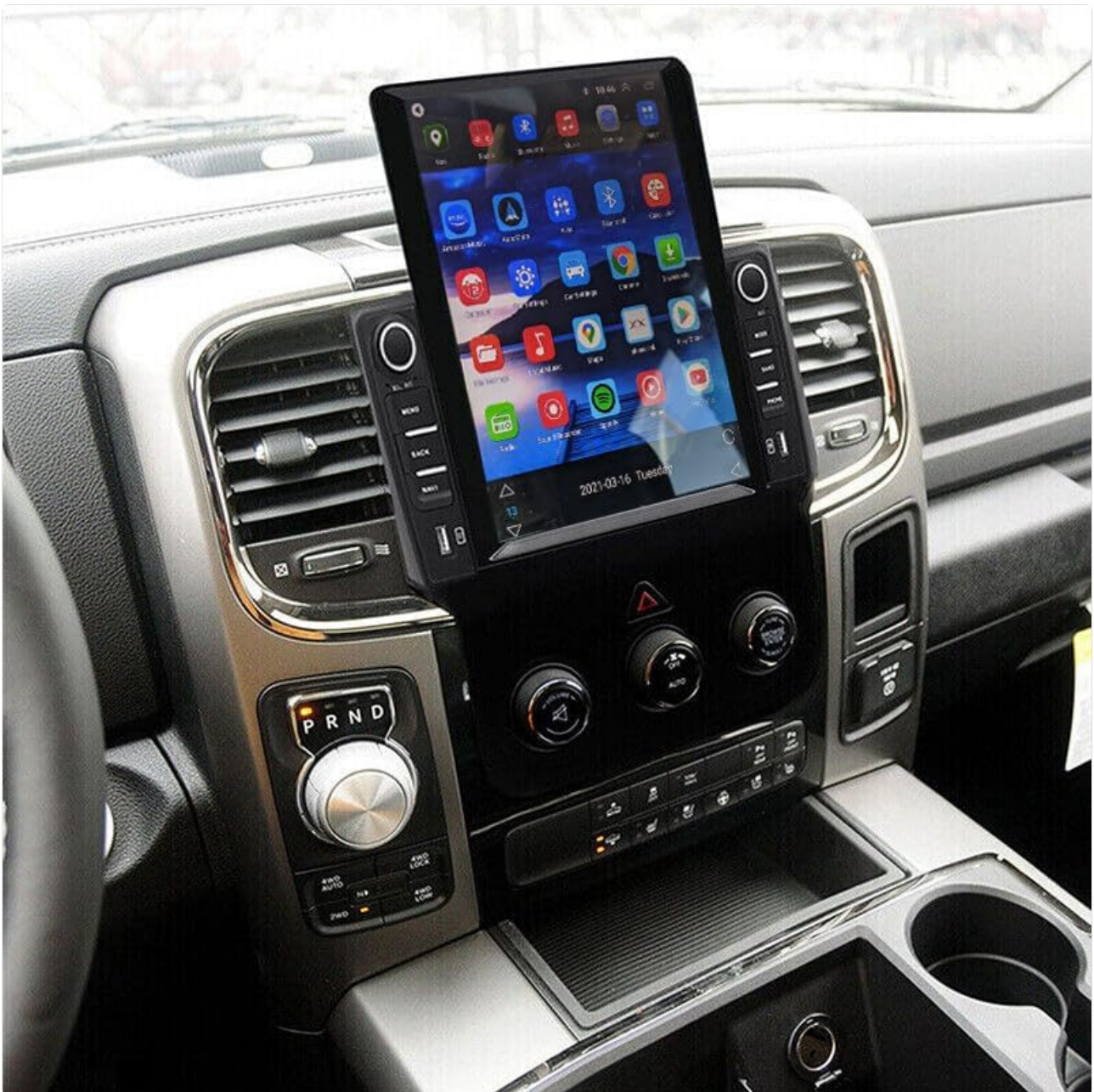
Image 5.1: Example of the Lodderly Car Radio Stereo installed in a compatible vehicle.