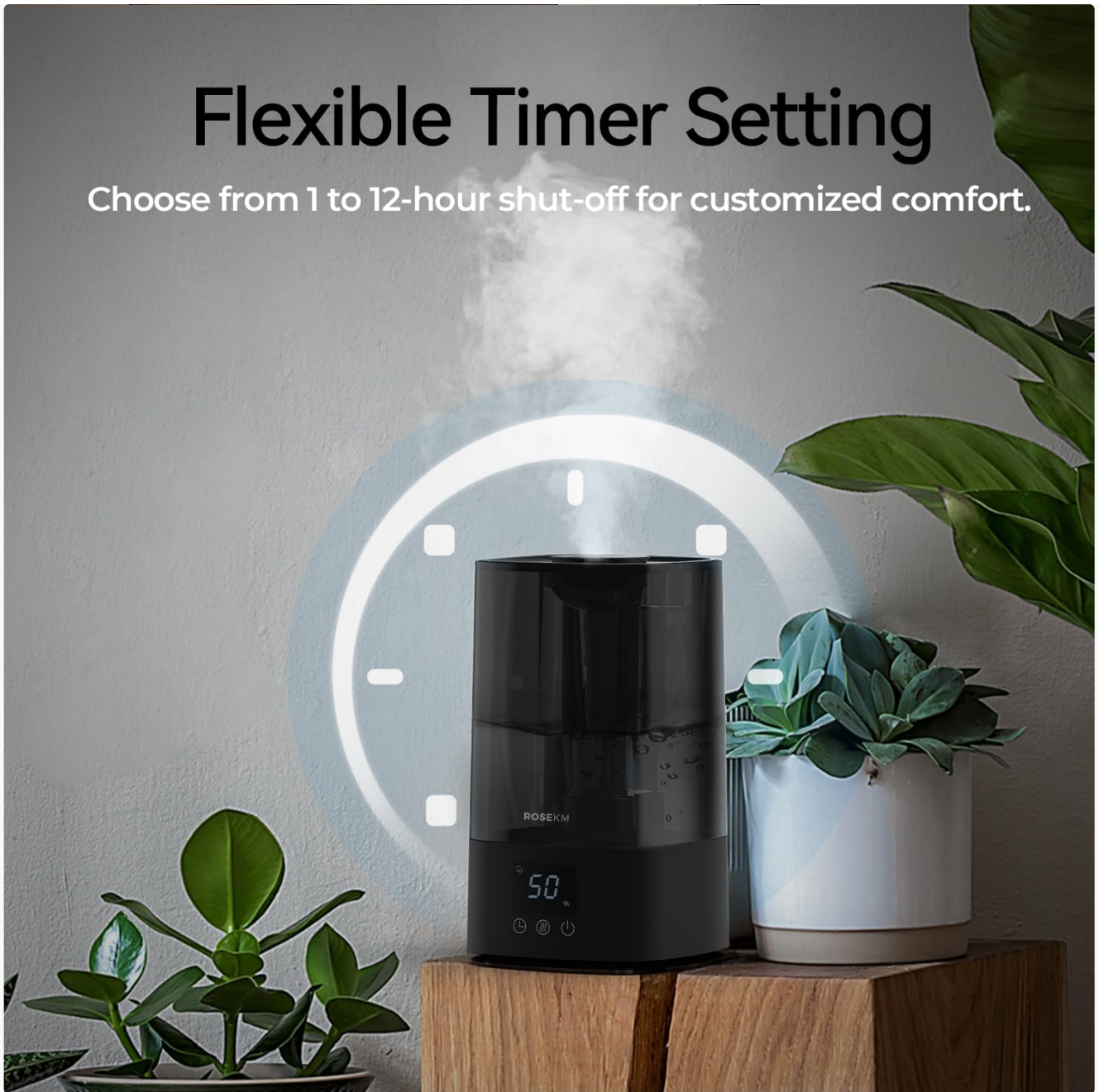
Image 6.3: Shows the humidifier with a visual representation of the 1 to 12-hour timer setting.

Choose from 1 to 12-hour shut-off for customized comfort.