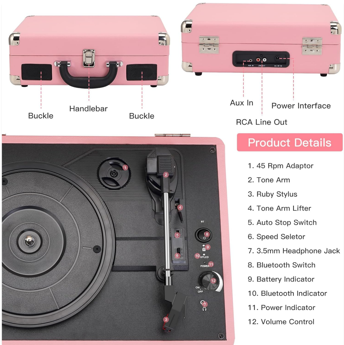
Image: Detailed view of the JORLAI record player highlighting its components. The image shows the top view of the turntable with a record on it, and a side view of the closed suitcase. Labels point to key features such as the 45 RPM adaptor, tone arm, ruby stylus, tone arm lifter, auto stop switch, speed selector, 3.5mm headphone jack, Bluetooth switch, battery indicator, Bluetooth indicator, power indicator, and volume control. The side view indicates the Aux In, Power Interface, and RCA Line Out ports.