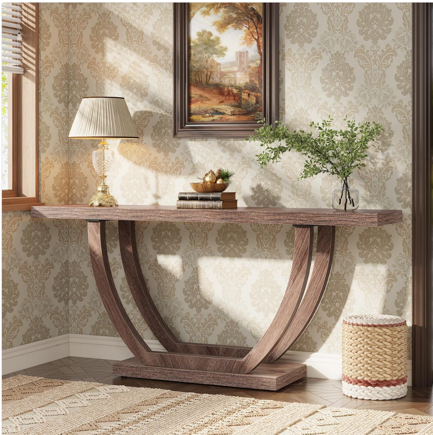
Image 5.2: The console table serving as an accent piece in a room with patterned wallpaper, holding a lamp, books, and decorative items.