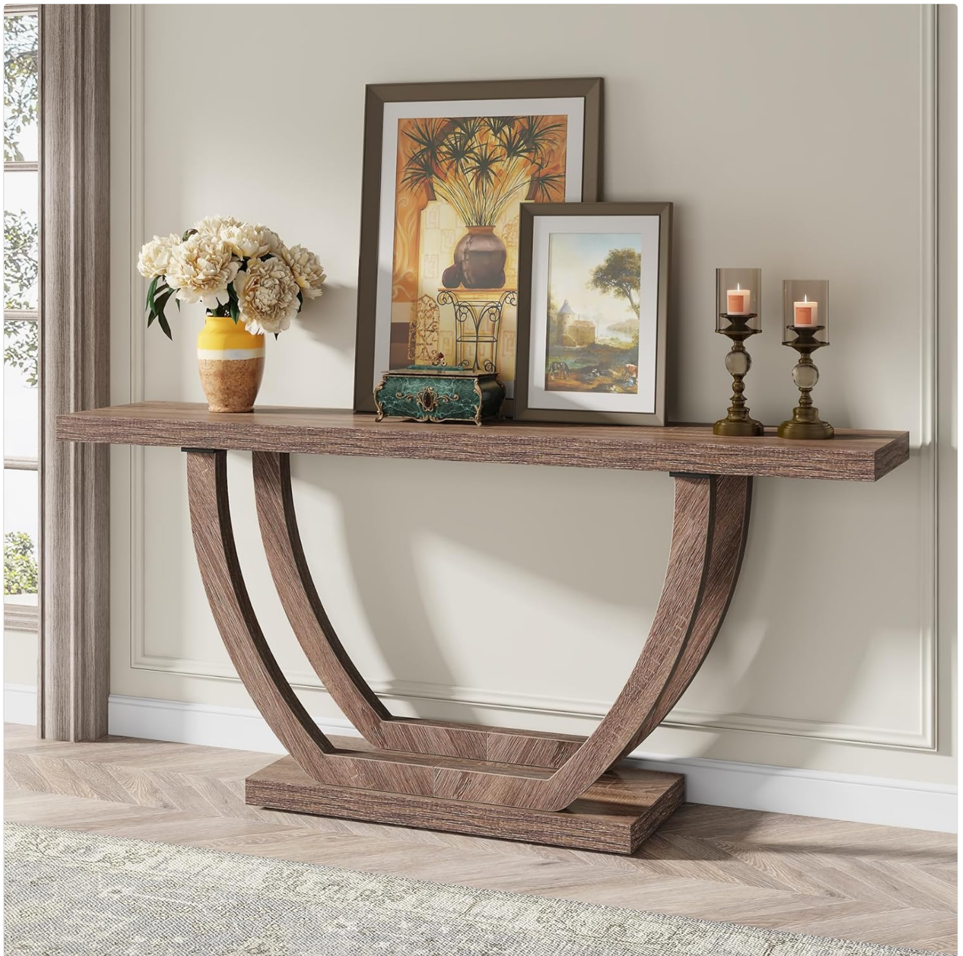
Image 1.1: The Tribesigns 63-Inch Wood Console Table, showcasing its design and potential use in an entryway or living room, adorned with decorative items.