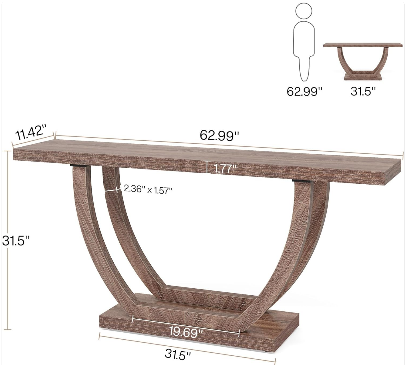
Image 8.1: Dimensional diagram of the console table, illustrating its length, width, and height for accurate placement and planning.