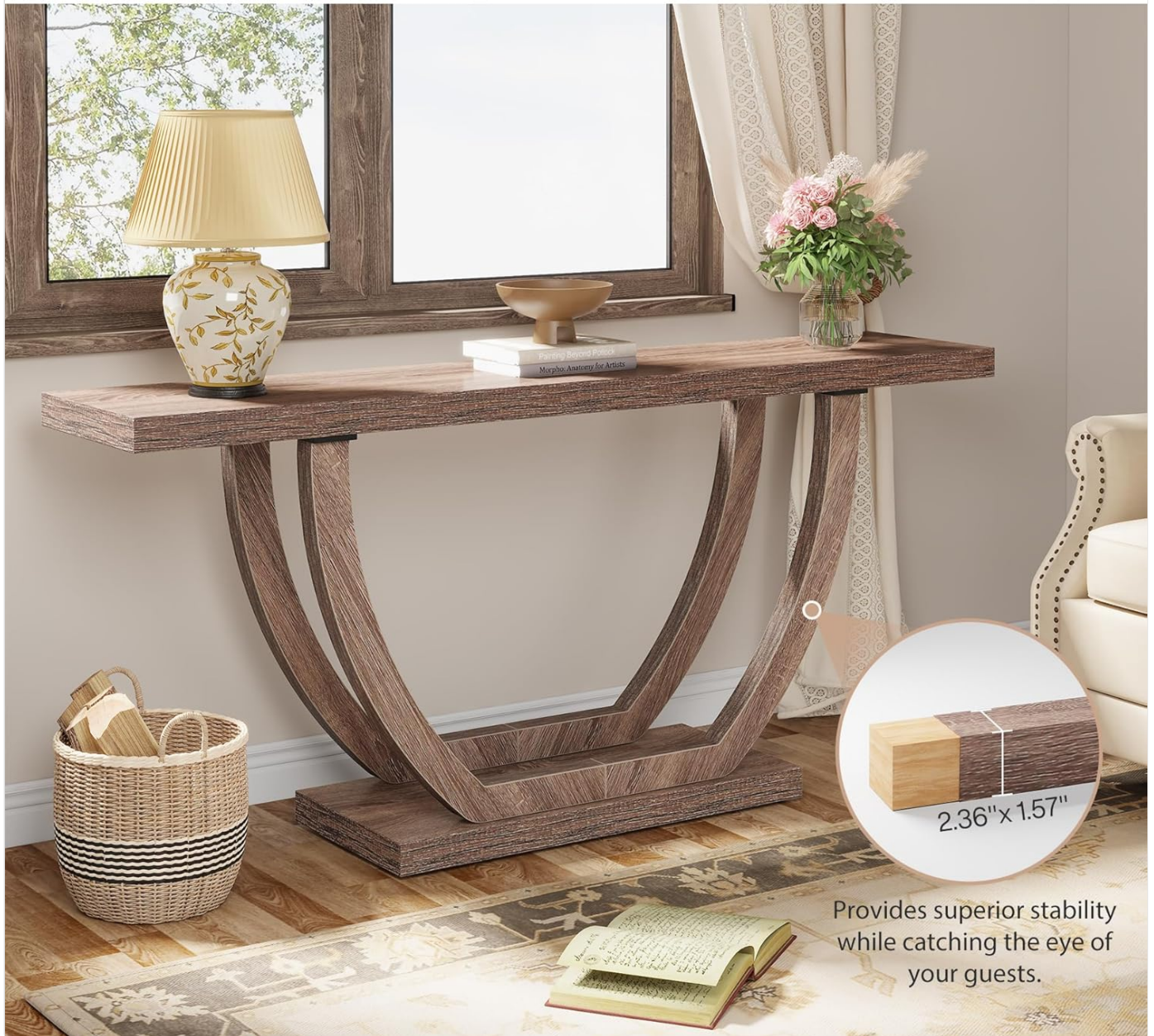
Image 4.1: Detail of the sturdy double U-shaped wood base, highlighting its construction and stability features.