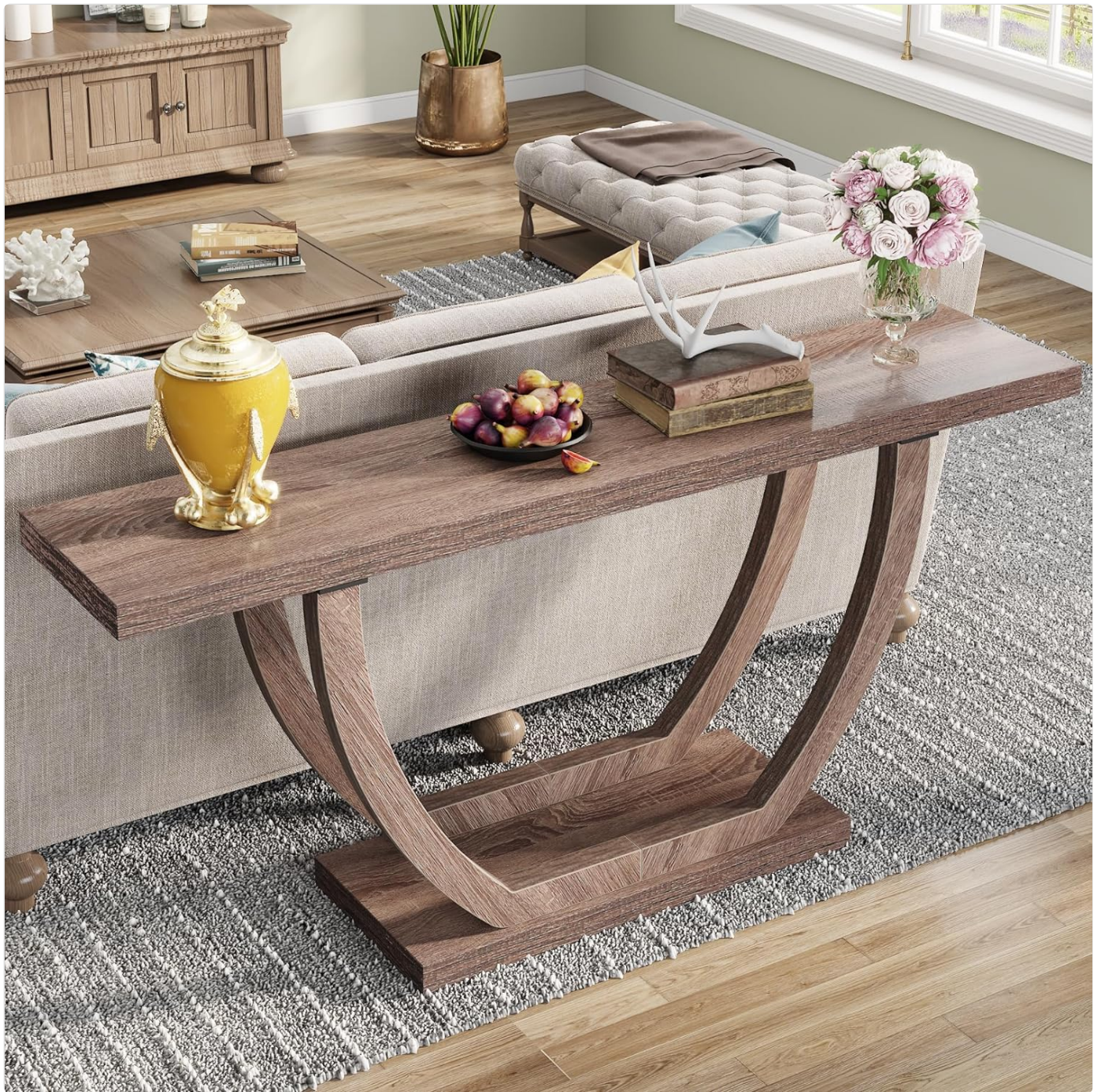
Image 5.1: The console table positioned behind a sofa, demonstrating its utility as a convenient surface for living room essentials and decor.