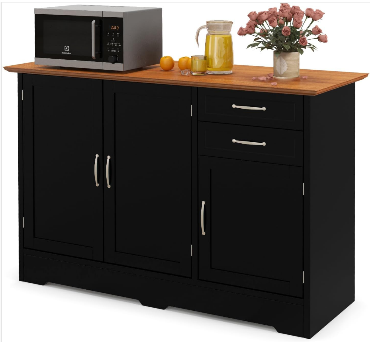
Image: The COSTWAY Farmhouse Buffet Cabinet, showcasing its black finish and wood-toned top, used as a coffee bar with a microwave and beverages.