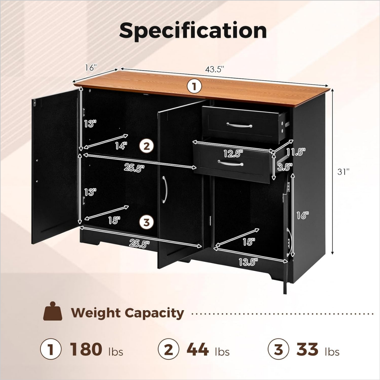
Image: Technical specifications diagram, illustrating the cabinet's dimensions and individual weight capacities for the top surface and shelves.

This product is eligible for 30-day easy returns. Please refer to your purchase platform's return policy for detailed information regarding eligibility and procedures.