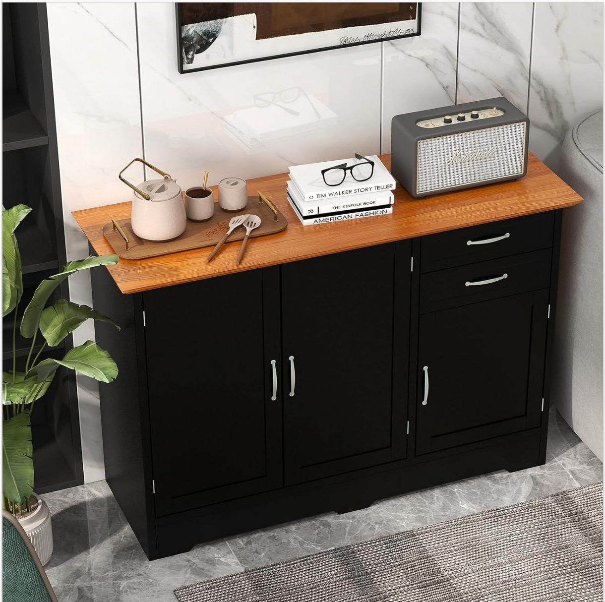
Image: The buffet cabinet positioned in an entryway, demonstrating its versatility as a console table.