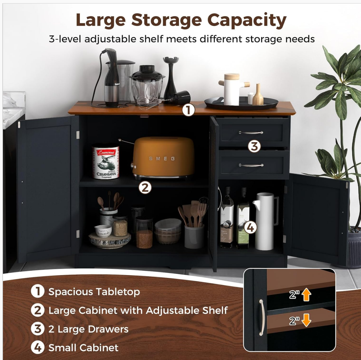
Image: The cabinet interior, highlighting the adjustable shelf in the large compartment and the two drawers.