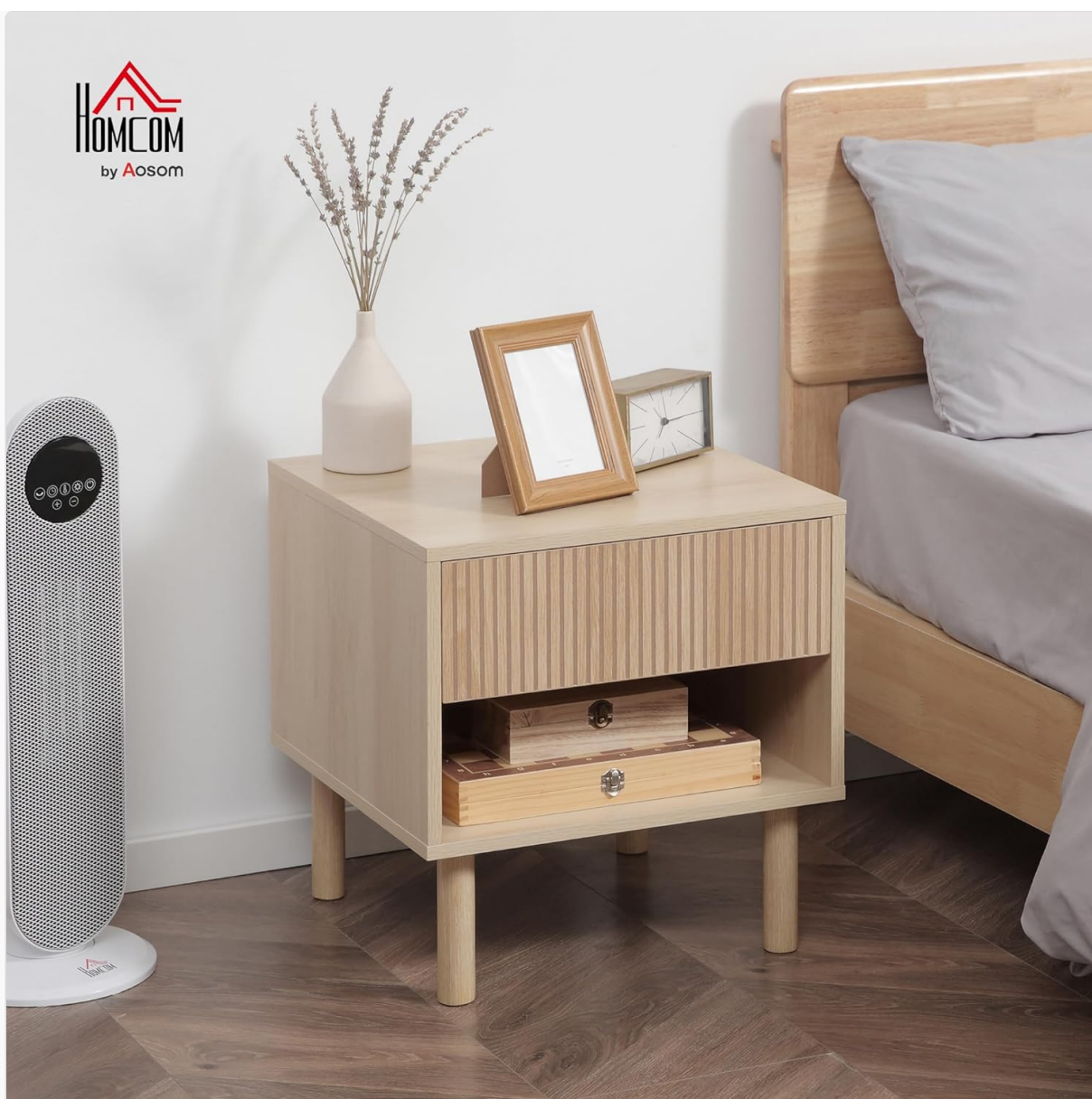
Image: The HOMCOM Modern Nightstand, showcasing its design with a drawer and an open storage compartment, positioned next to a bed.