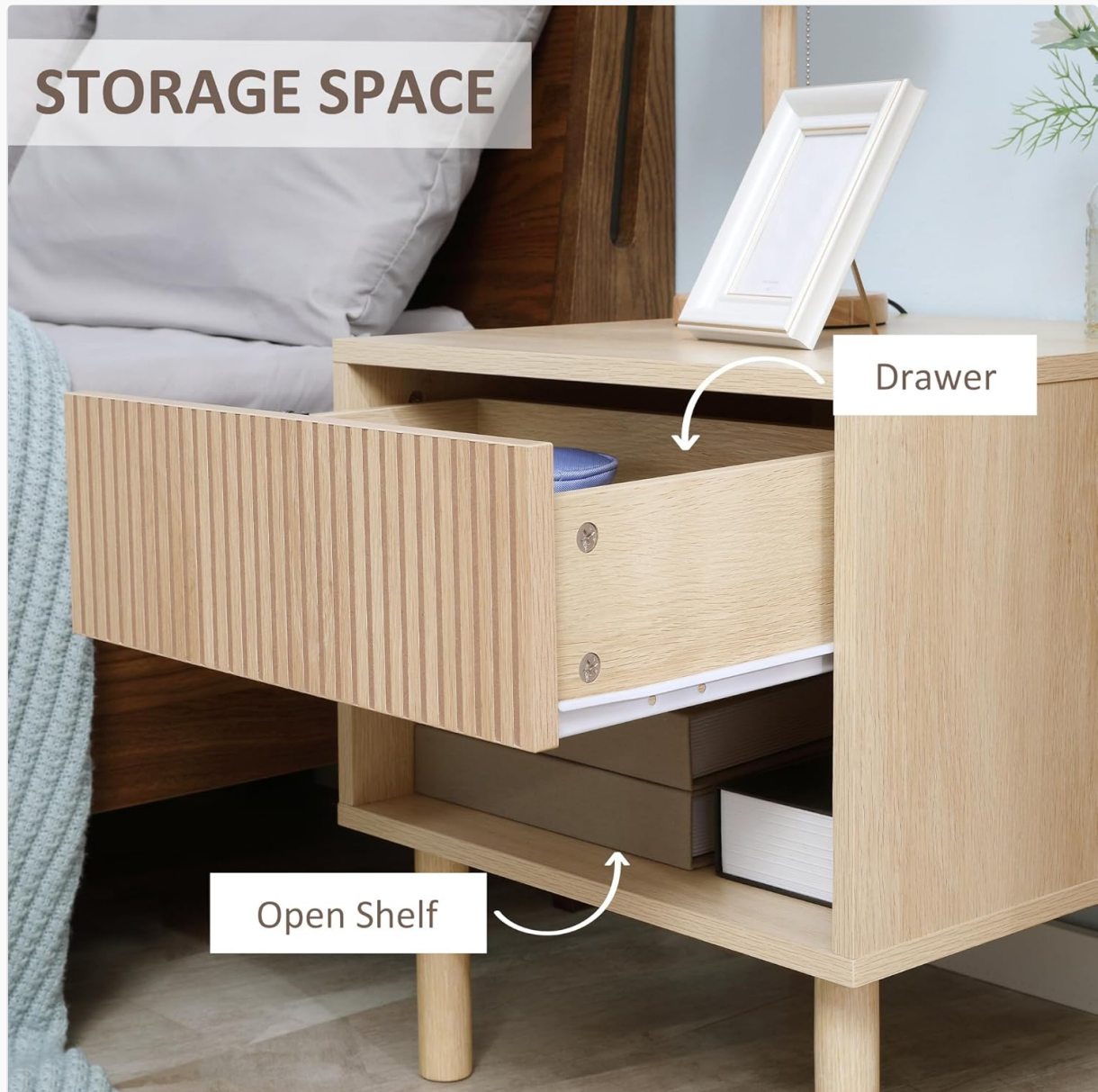
Image: The nightstand with its drawer partially open, revealing stored items, and an open shelf below, demonstrating its storage capabilities.