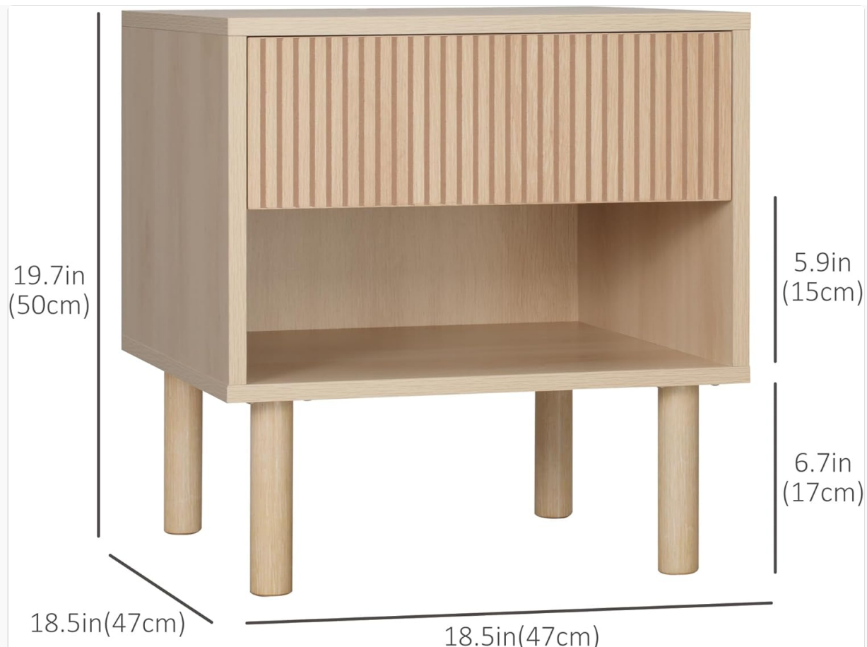
Image: A technical diagram illustrating the precise dimensions of the nightstand, including height, width, and depth of the unit and its internal compartments.