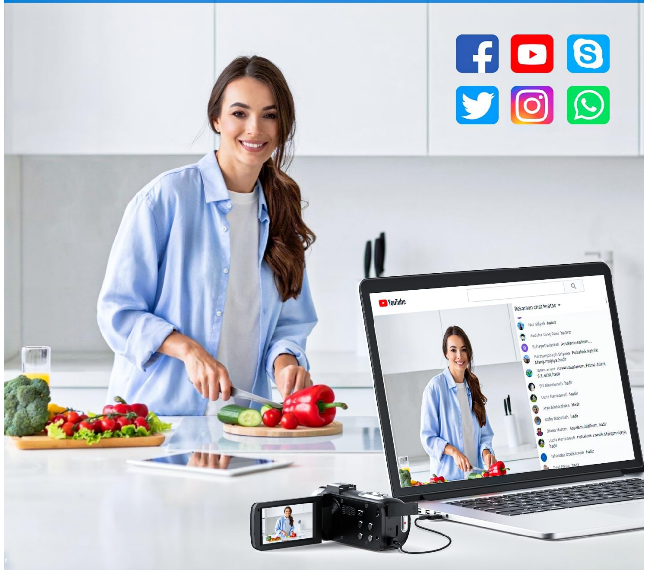
Figure 6: Camcorder used as a webcam.