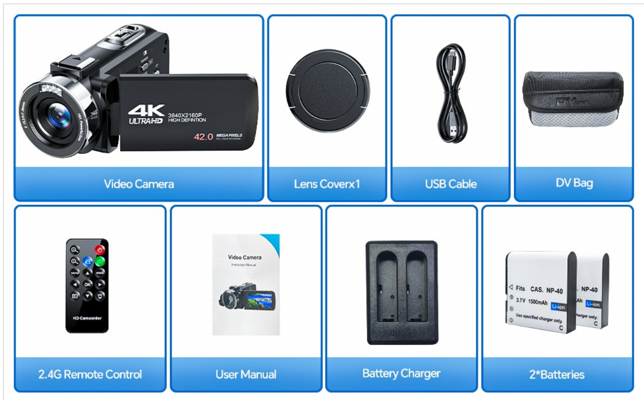
Figure 2: Included accessories with the CAMWORLD 4K Camcorder AC13.