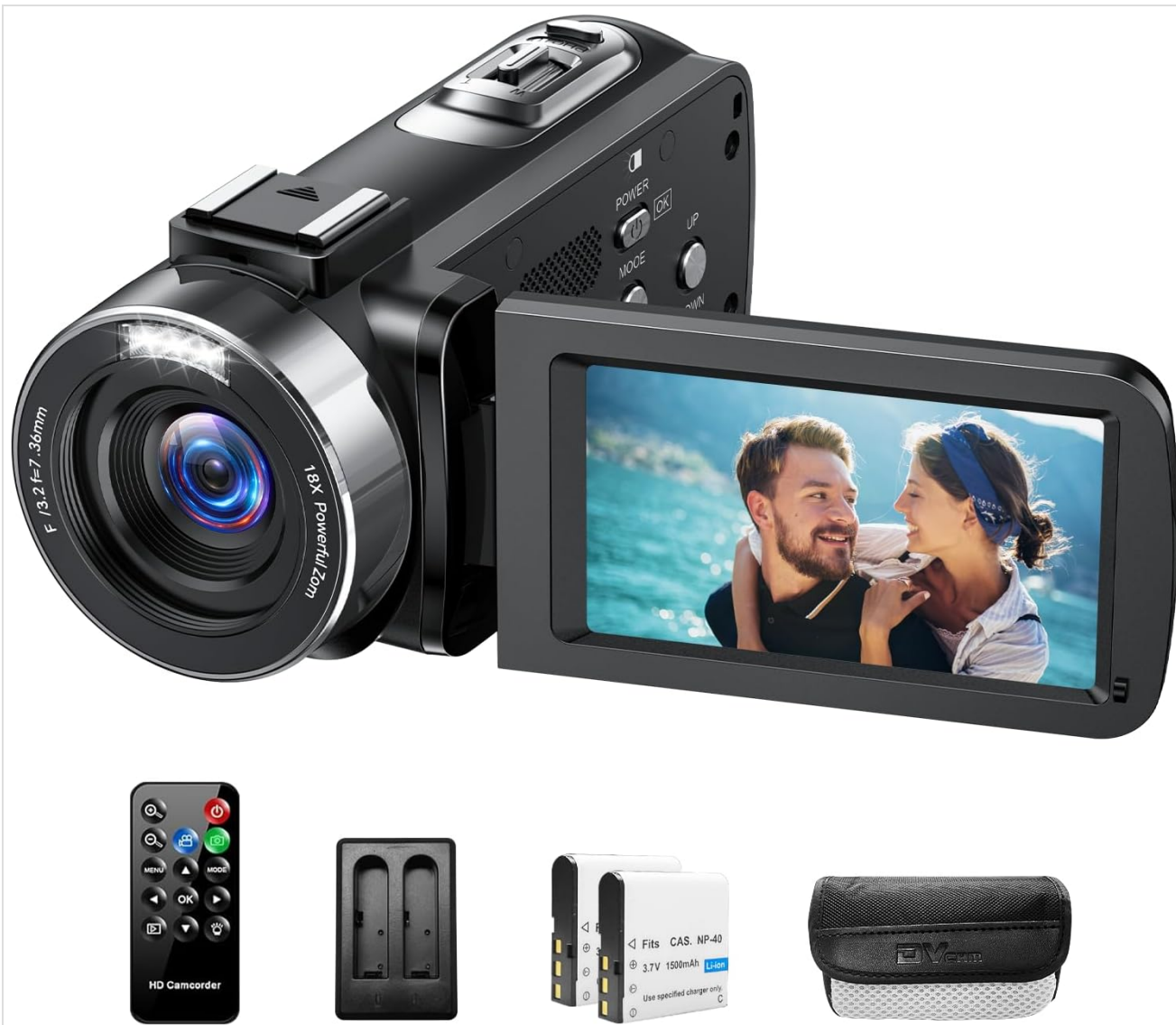
Figure 1: CAMWORLD 4K Camcorder AC13 and accessories.