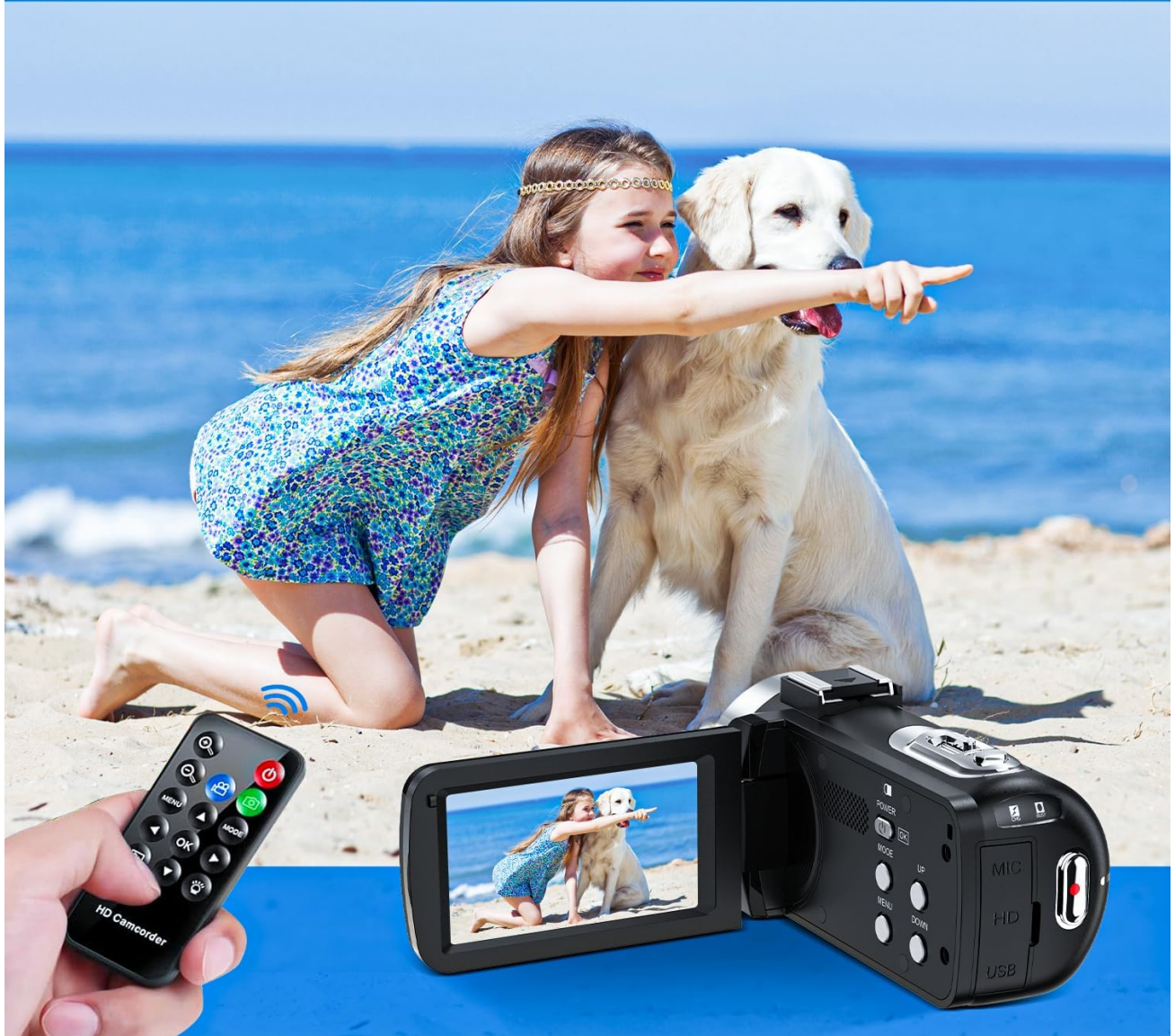
Figure 8: Using the wireless remote control.