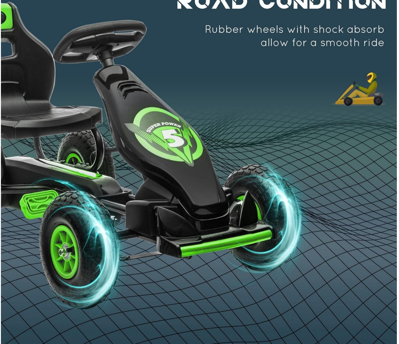
Image: Durable rubber wheels with shock absorption for a smooth ride on different surfaces.

Rubber wheels with shock absorb allow for a smooth ride