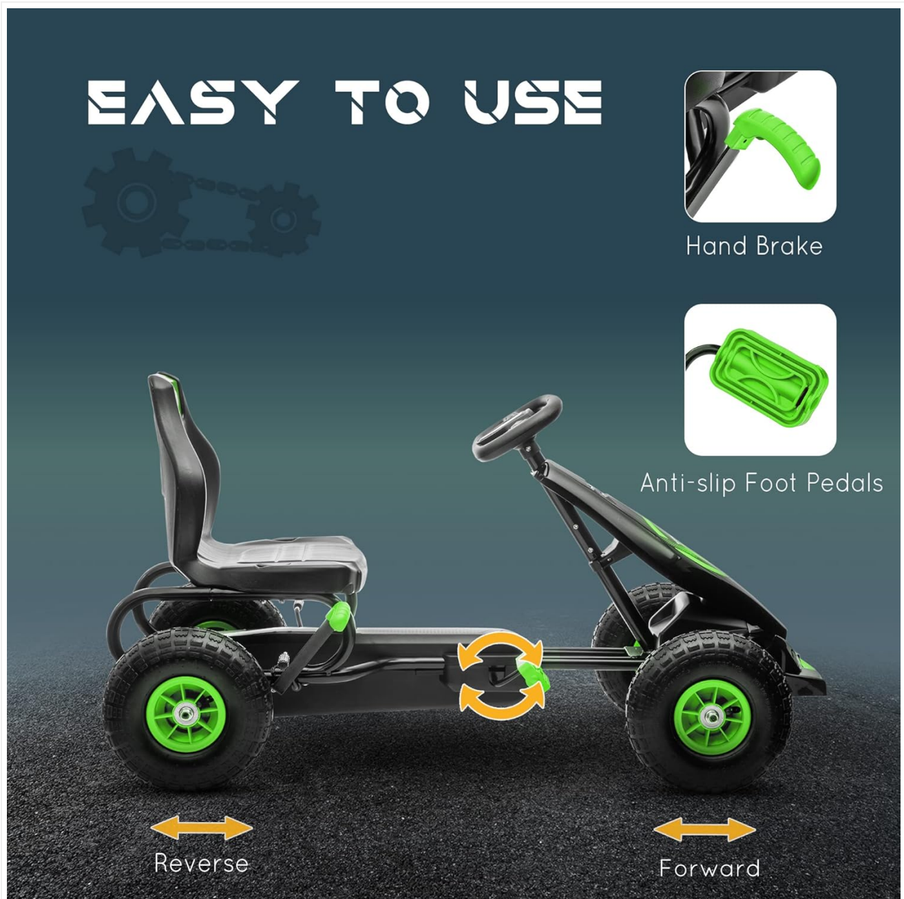
Image: Controls for the Aosom Kids Pedal Go Kart, including hand brake and pedal functions.