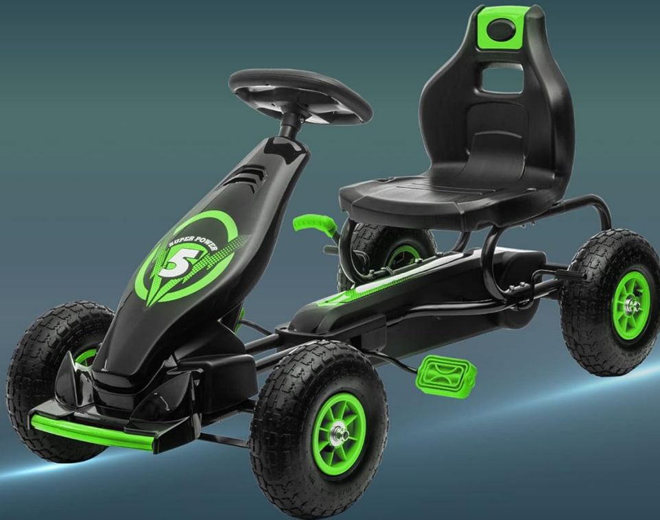
Image: Overview of the Aosom Kids Pedal Go Kart highlighting its key features and age suitability.