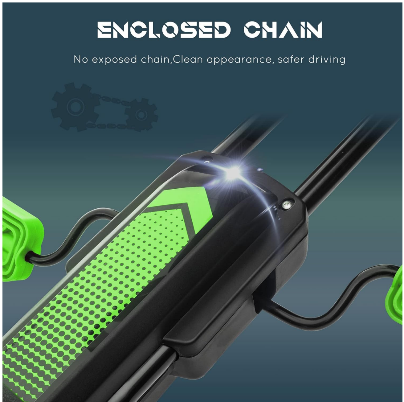
Image: The enclosed chain design ensures safety and a clean appearance.