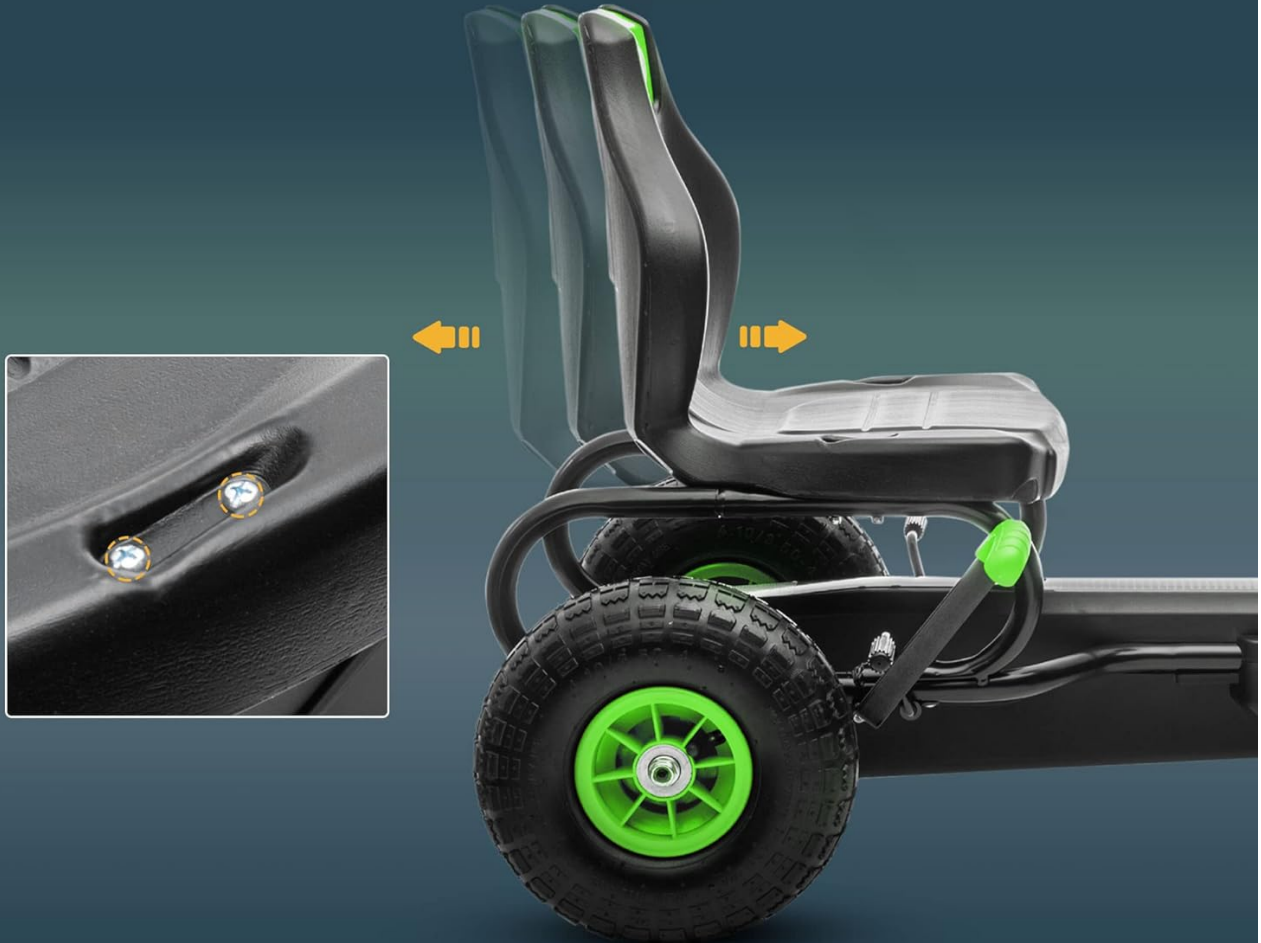
Image: The ergonomic seat can be adjusted to three positions for optimal comfort and fit.