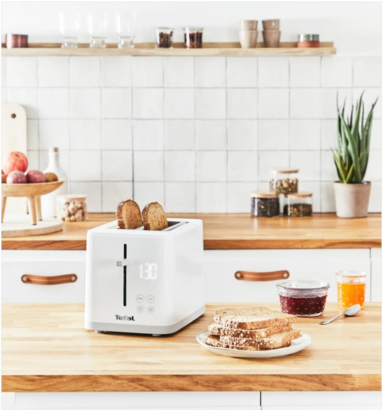
Figure 5: Toaster in Operation

The Tefal Sense 2 Toaster is shown on a wooden kitchen counter with two slices of toast emerging from its slots. Jams and other breakfast items are visible in the background.