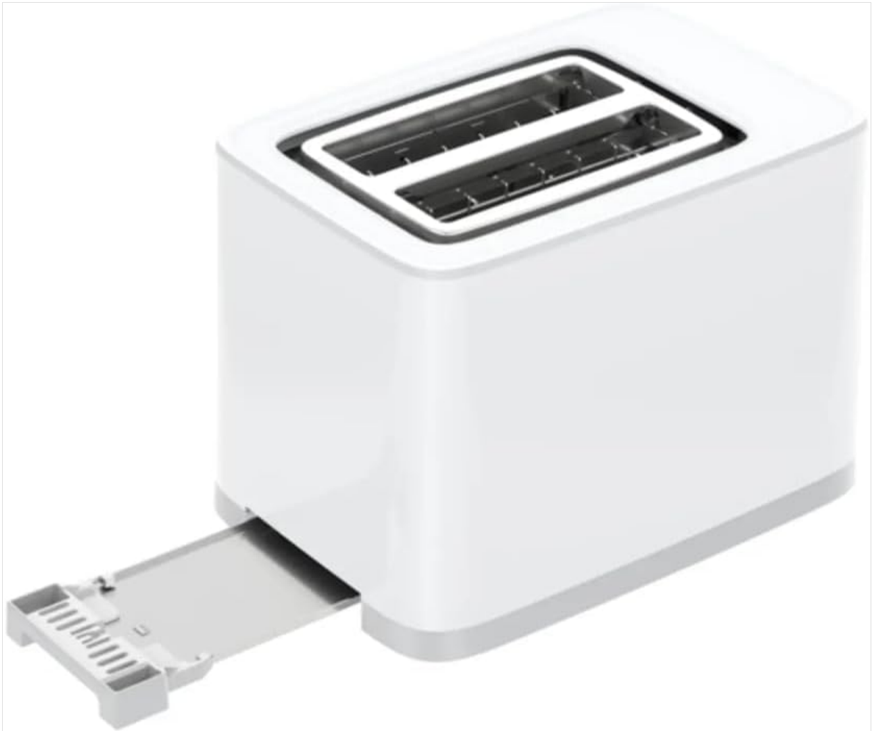
Figure 1: Tefal Sense 2 Toaster with Crumb Tray

This image shows the white Tefal Sense 2 Toaster from an angled view, with the removable crumb tray pulled out from the bottom front. The two toasting slots are visible at the top.