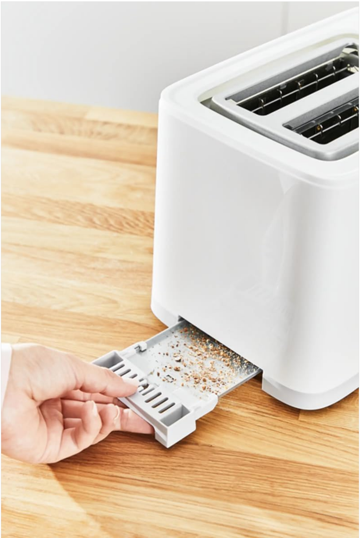
Figure 6: Removing the Crumb Tray for Cleaning

A hand is shown pulling out the crumb tray from the bottom of the white Tefal Sense 2 Toaster, revealing accumulated crumbs.