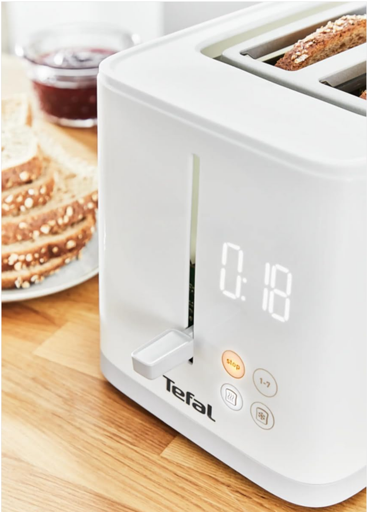
Figure 3: Control Panel with Digital Display

A close-up view of the toaster's side, highlighting the digital display showing '0:18' and the touch buttons for 'stop', '1-7' (browning levels), defrost, and reheat functions.