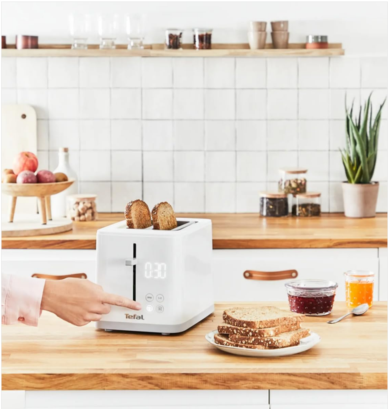
Figure 4: Adjusting Browning Level

This image shows a hand interacting with the touchscreen control panel of the Tefal Sense 2 Toaster, likely adjusting the browning level or selecting a function. The digital display shows '0:30'.