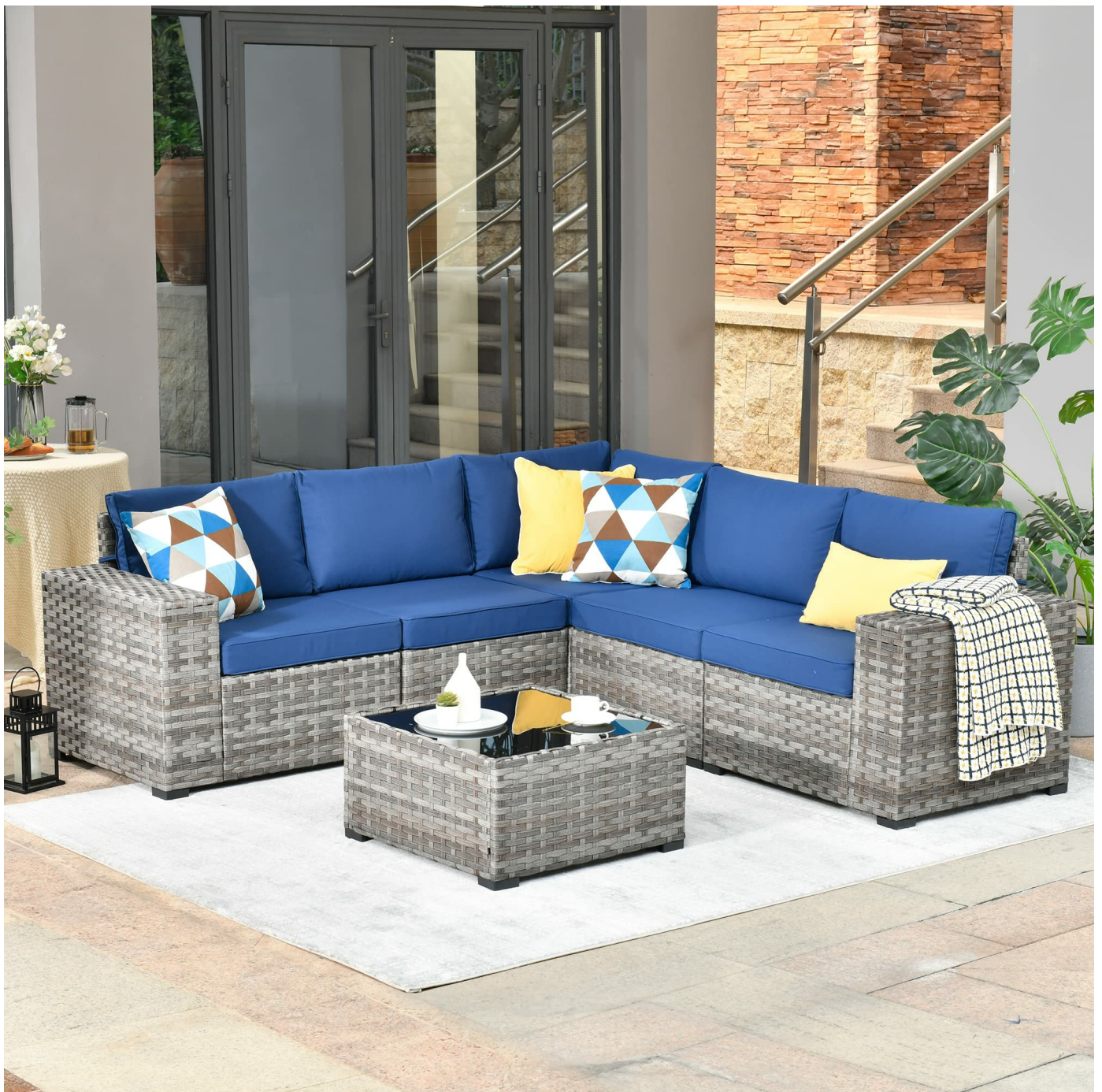
Image: The complete 6-piece modular patio set with navy blue cushions, arranged in an L-shape with a coffee table.