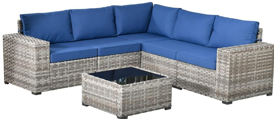
Image: Shows the individual components and various possible arrangements of the modular patio set.