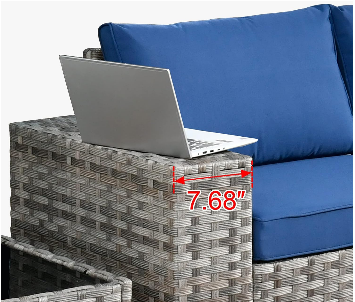
Image: A close-up of the wide armrest, demonstrating its utility as a surface for a laptop or other items.

Your browser does not support the video tag.