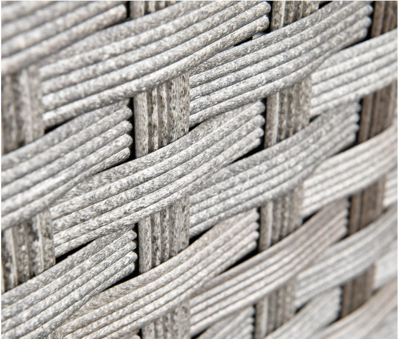
Image: A close-up view of the PE rattan wicker, highlighting its texture and UV-resistant properties.