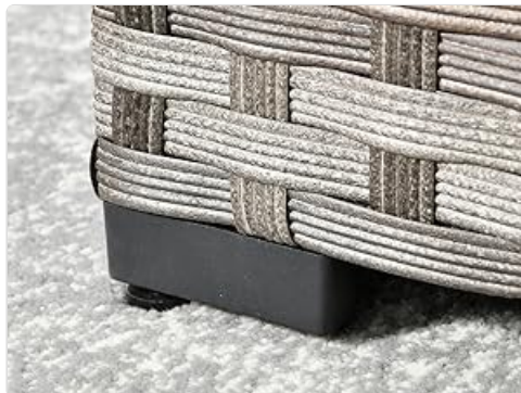
Image 5: Adjustable feet for leveling the furniture on uneven ground.