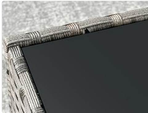
Image 10: The tempered glass table top features rounded edges for enhanced safety.