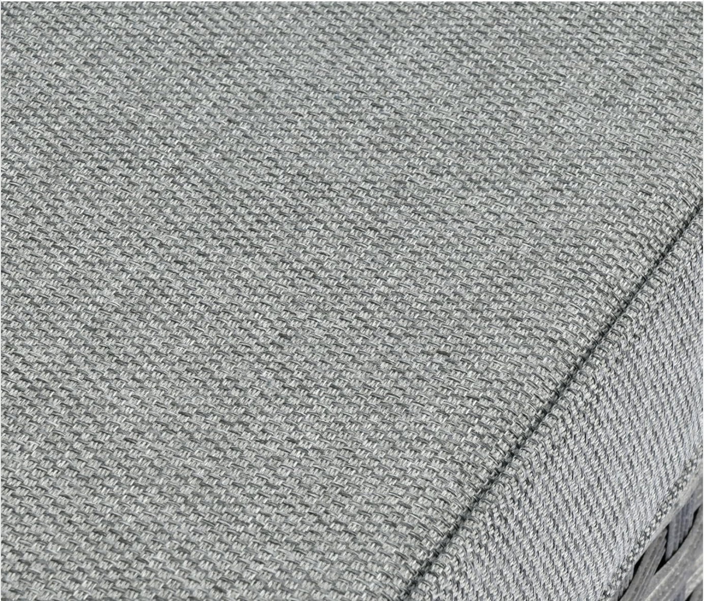
Image 9: Close-up of the premium olefin fabric, highlighting its texture and water-resistant properties.