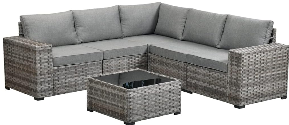
Image 7: Examples of various free combination layouts for the sectional set.