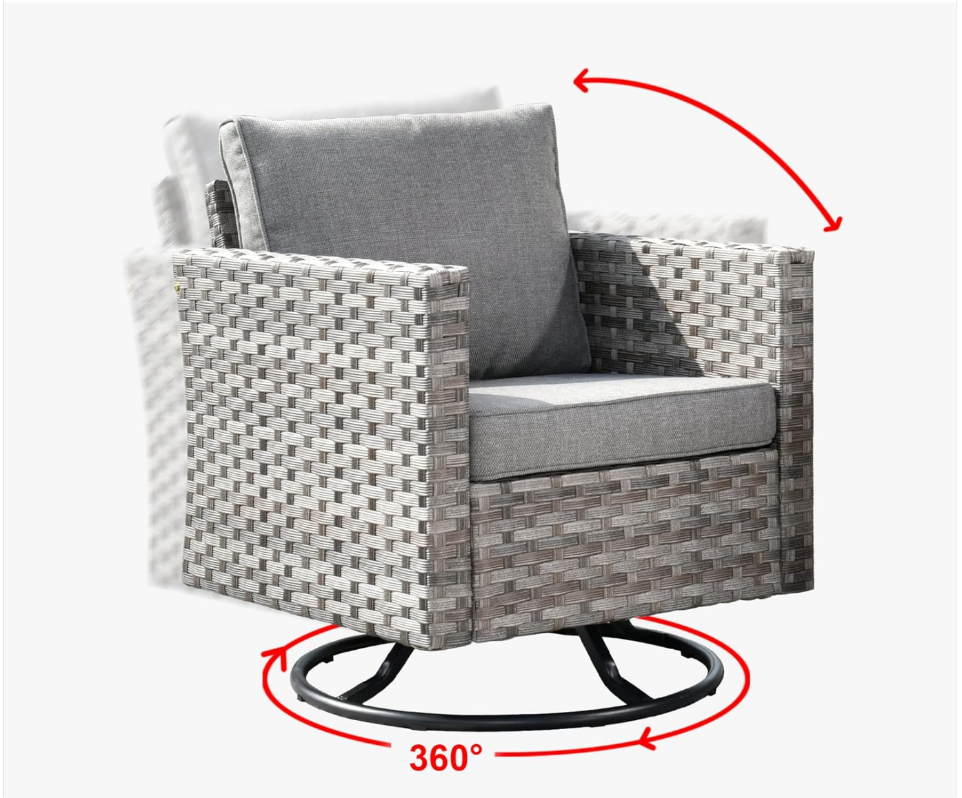
Image 6: Illustration of the swivel and rocking functionality of the chairs.

360-degree spin and gentle rocking motion