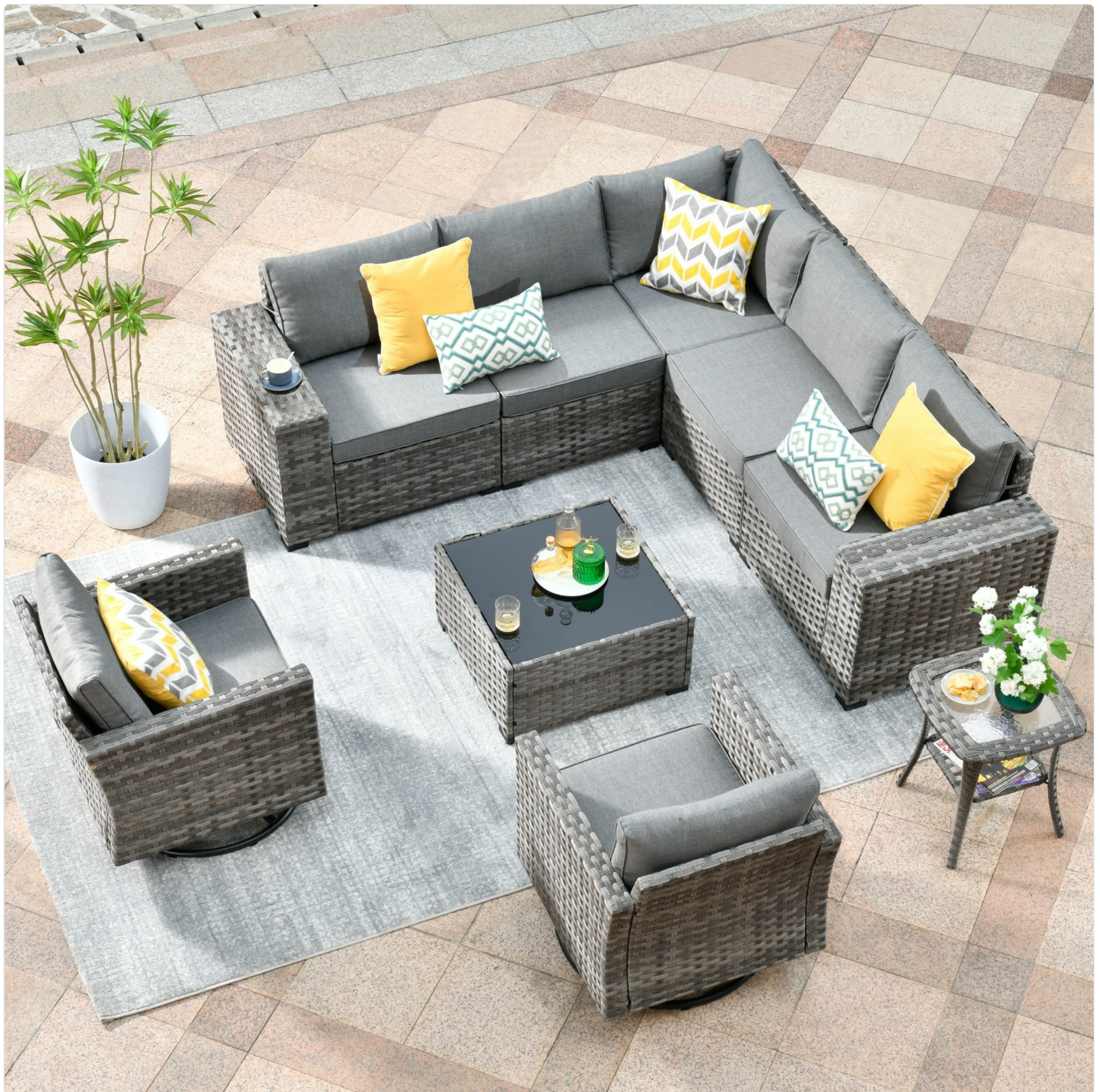
Image 1: The HOOOWOOO 9-Piece Modular Patio Outdoor Sectional Furniture Set in Dark Grey.