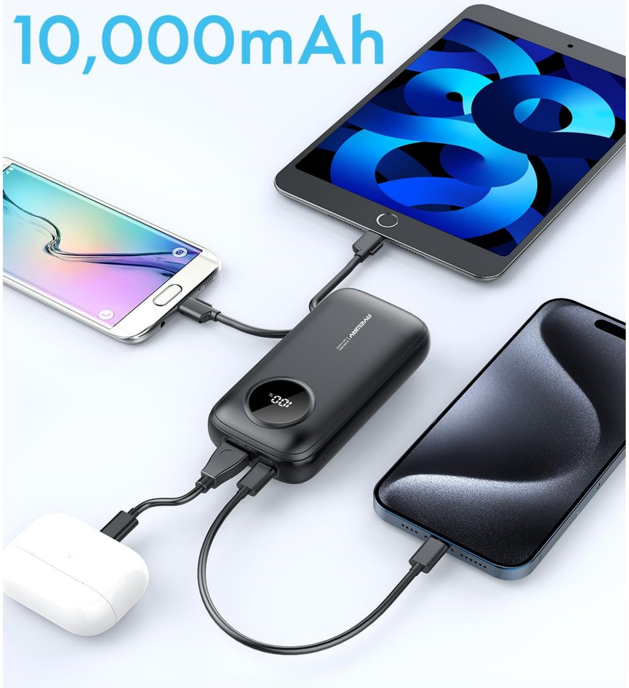
Image: The power bank can charge up to four devices concurrently using its built-in cables and USB ports.