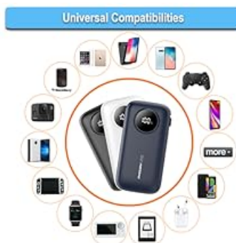
Image: The portable charger is suitable for air travel and can be carried in hand luggage.

Image: The Ayeway Portable Charger is designed to be small and lightweight, yet powerful enough to charge multiple devices like smartphones, tablets, and earbuds.