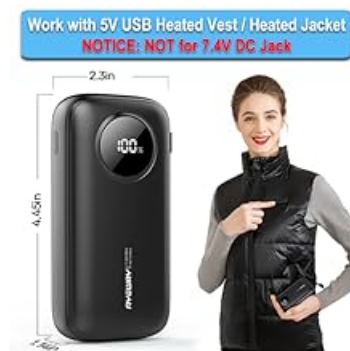
Image: The power bank features built-in cables and additional USB ports for versatile charging options.