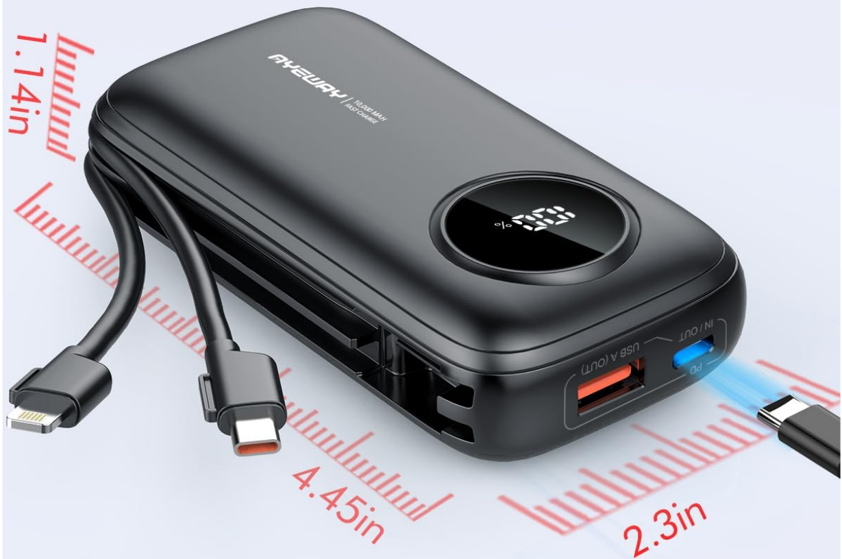
Image: The power bank features built-in USB-C and Lightning cables for direct connection to modern devices.