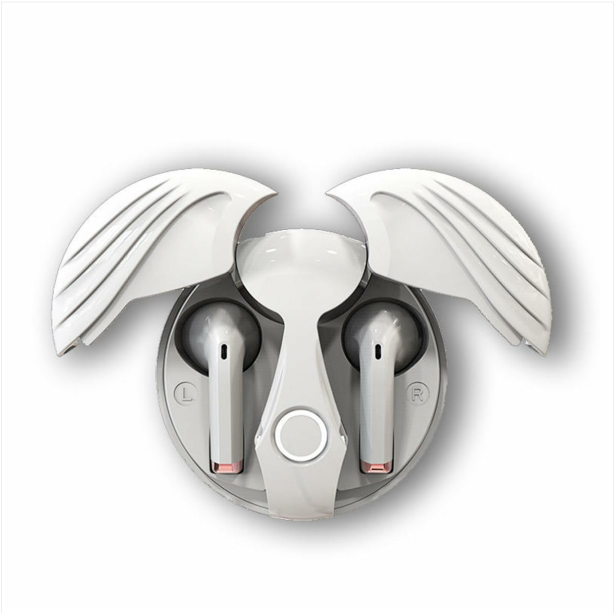
Image: The charging case features a Type-C fast charging port. The case has a 300 mAh battery capacity, and each earphone has a 30 mAh battery, providing long battery life.