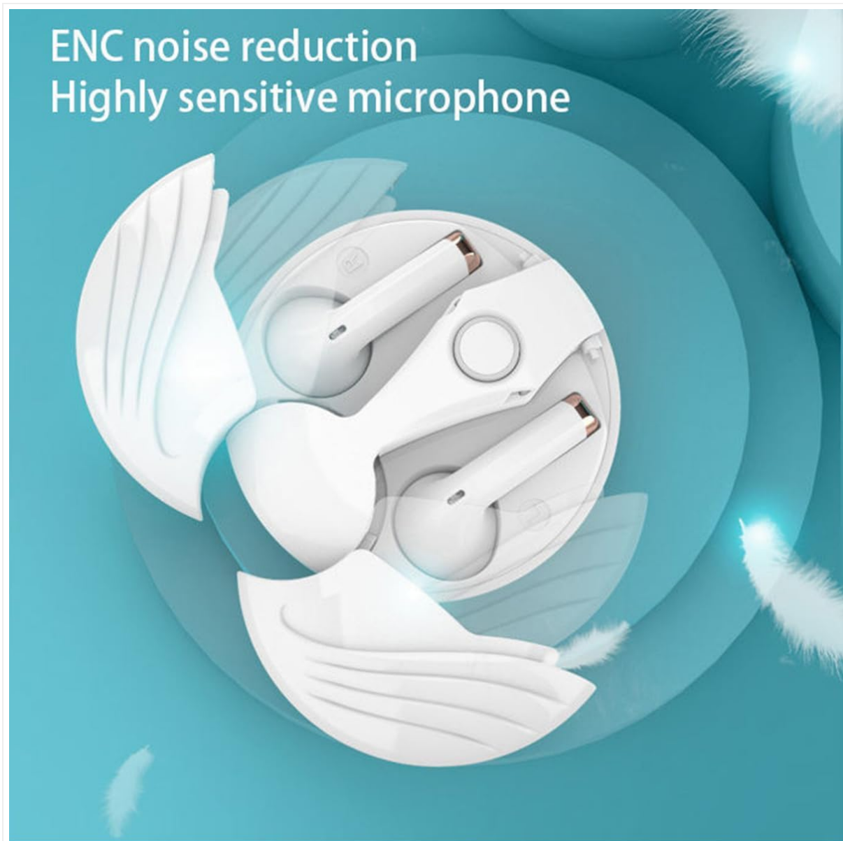
Image: The earphones feature ENC noise reduction and a highly sensitive microphone for clear communication.

Each earphone includes a built-in microphone with Environmental Noise Cancellation (ENC) for clear calls.