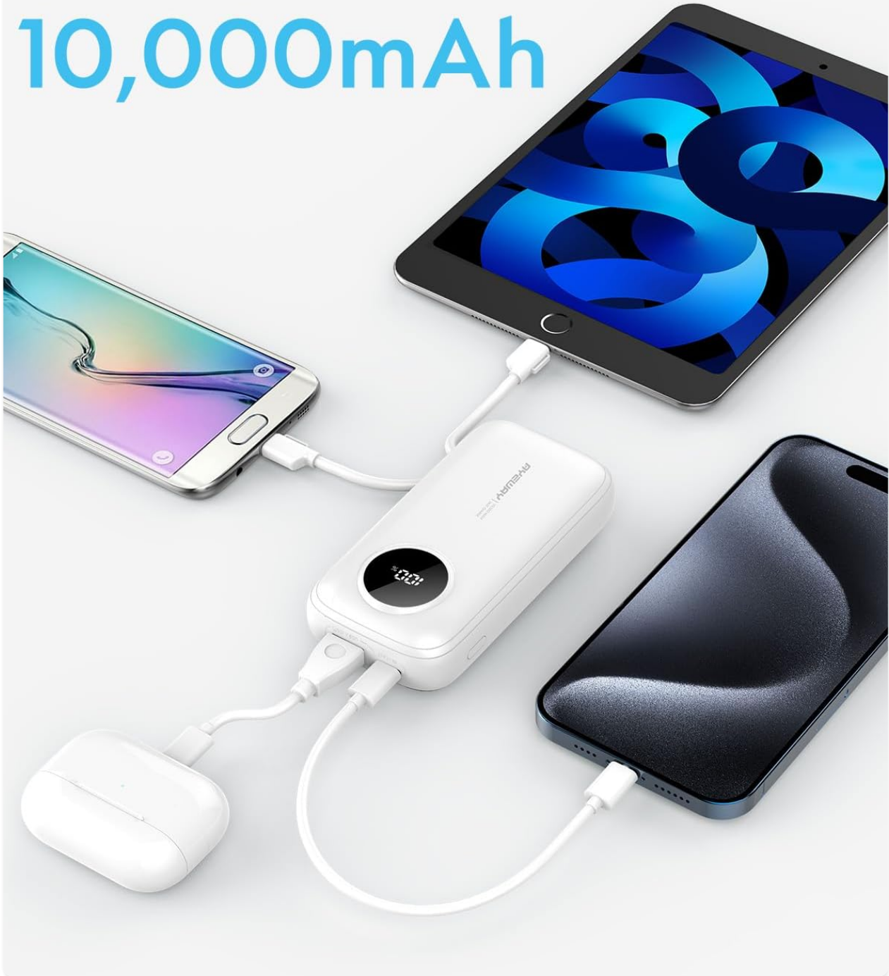
Figure 3: Illustration of the power bank simultaneously charging a smartphone, tablet, wireless earbuds, and another smartphone, demonstrating its multi-device charging capability.