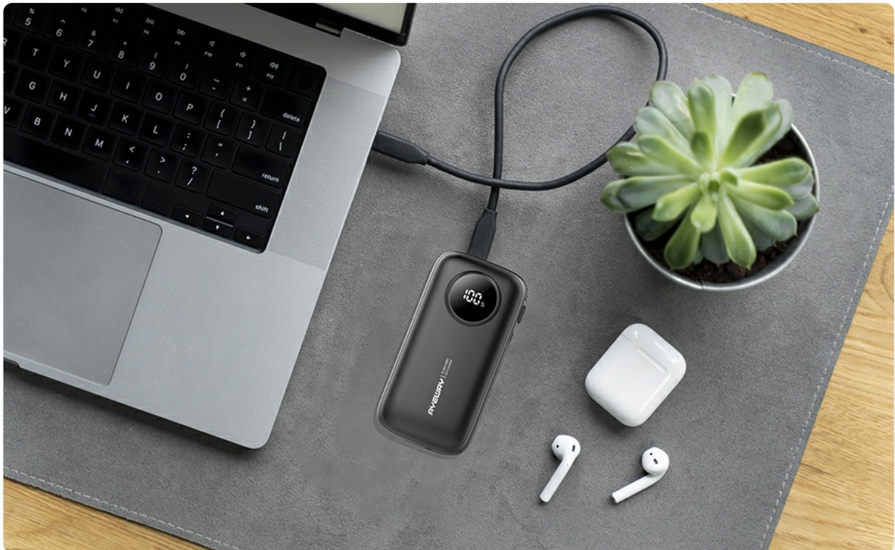
Figure 5: The power bank actively charging a laptop via its USB-C port and wireless earbuds, demonstrating its versatility for various devices in a typical use scenario.