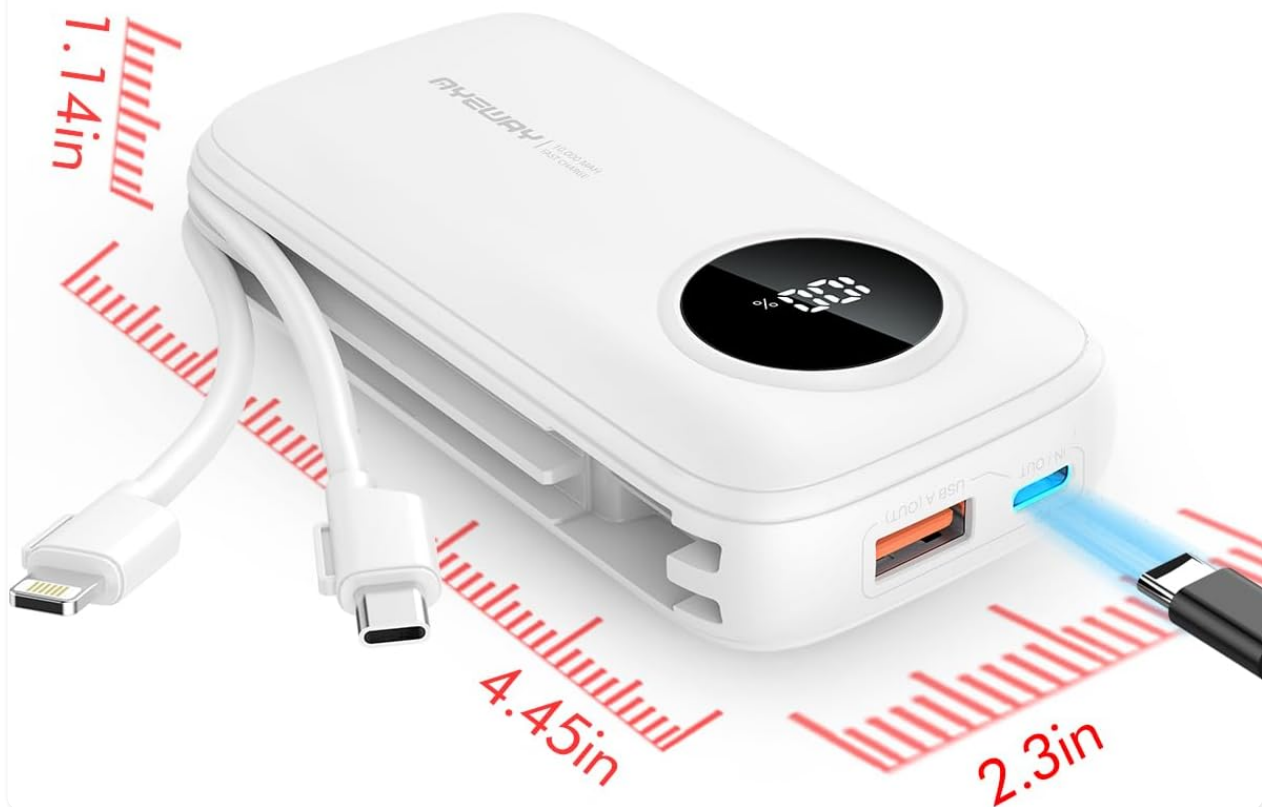
Figure 2: The power bank highlighting its USB-C output port and the two built-in charging cables (USB-C and Lightning) designed for compatibility with various modern devices.