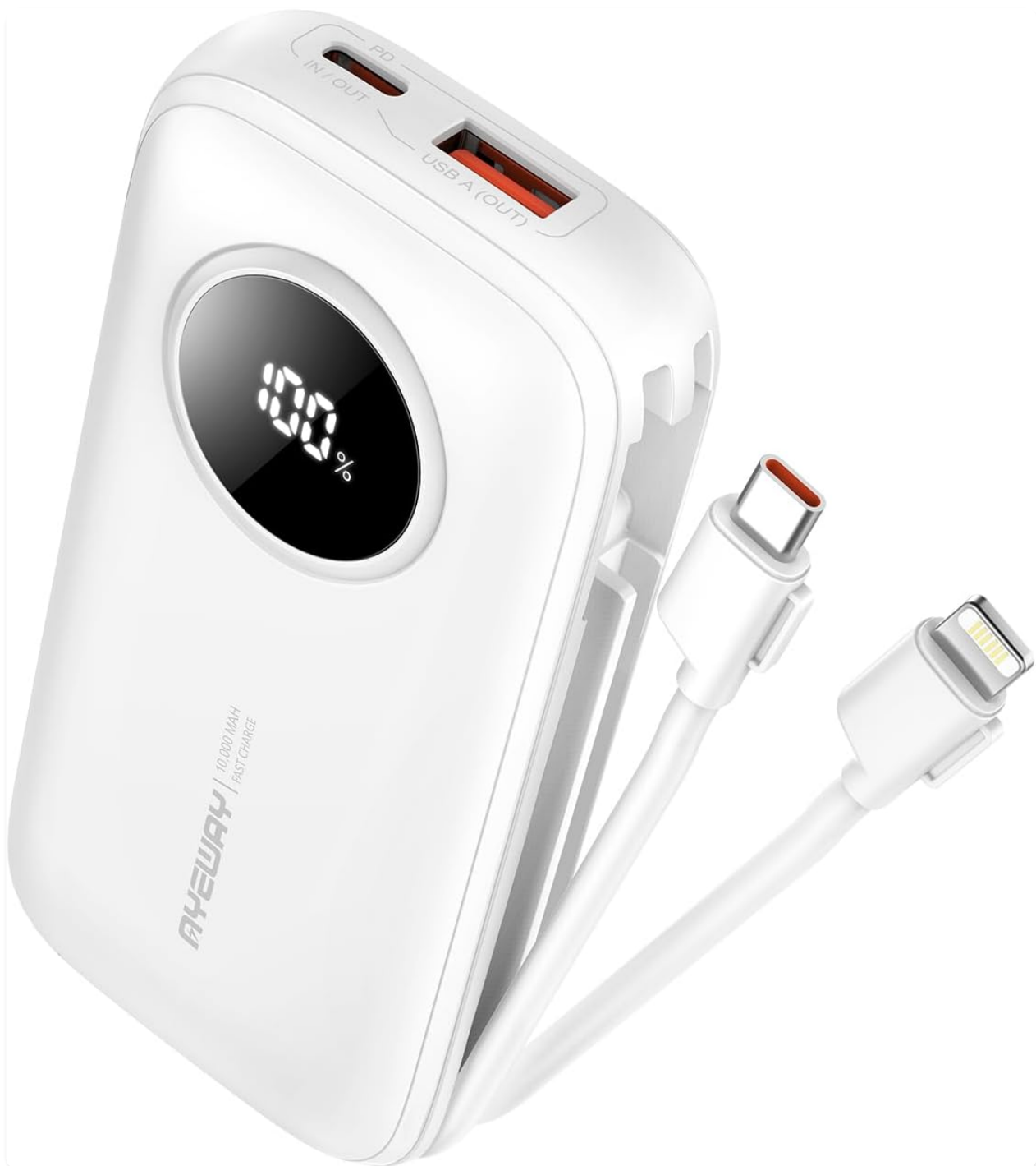
Figure 1: Front view of the Ayeway 10,000mAh Portable Power Bank, showing the digital display, USB-A output, USB-C input/output, and built-in Lightning and USB-C cables.

The Ayeway Portable Power Bank features a compact design with integrated charging solutions.