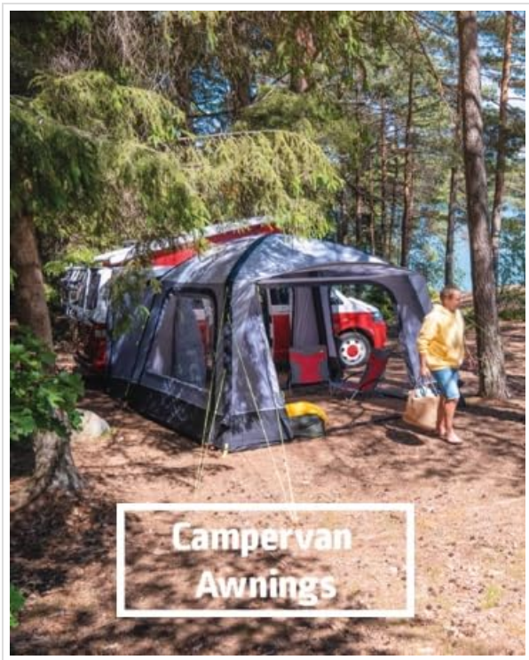
Figure 2: Examples of outdoor setups where the Kampa Standard Windbreak can provide shelter and enhance comfort. The images show a family cooking outdoors and a campervan with an awning, illustrating common camping scenarios.