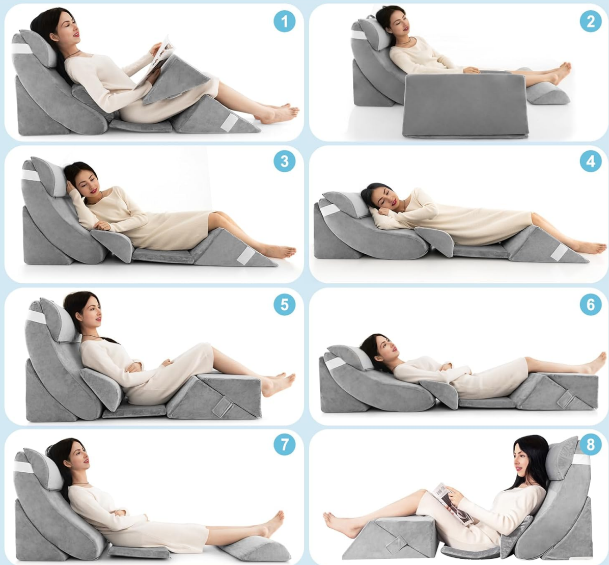
Image: Multiple Positions. This image displays eight different ways the bed wedge pillow set can be arranged and used, demonstrating its versatility for various activities and comfort needs, such as reading, sleeping, and leg elevation.