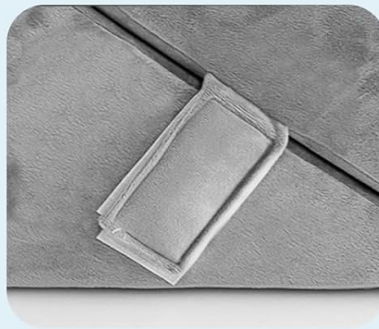
Hook & Loop Fasteners