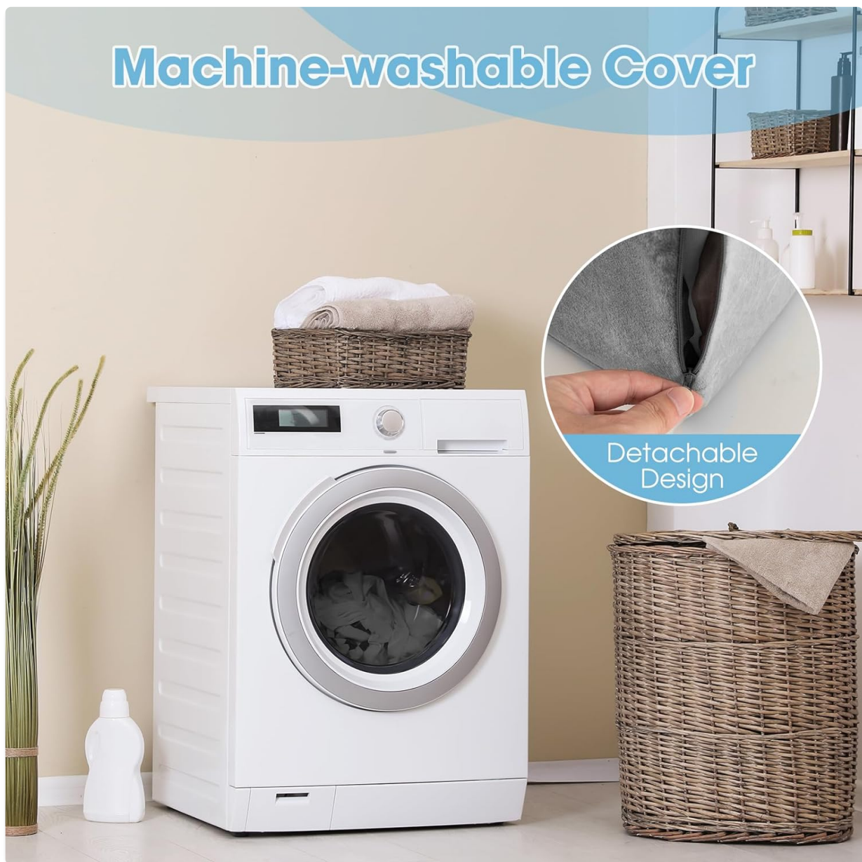
Image: Machine-washable Cover. This image shows a washing machine and a close-up of the pillow cover's zipper, illustrating its detachable design for easy cleaning.