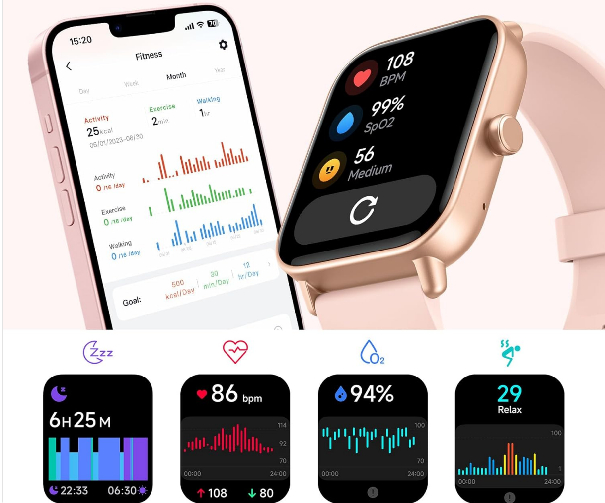
Image: The smartwatch screen showing real-time heart rate, blood oxygen saturation, and stress levels. A smartphone screen next to it displays a detailed health data overview from the companion app.

stay on top of your health with 24/7 real-time monitoring