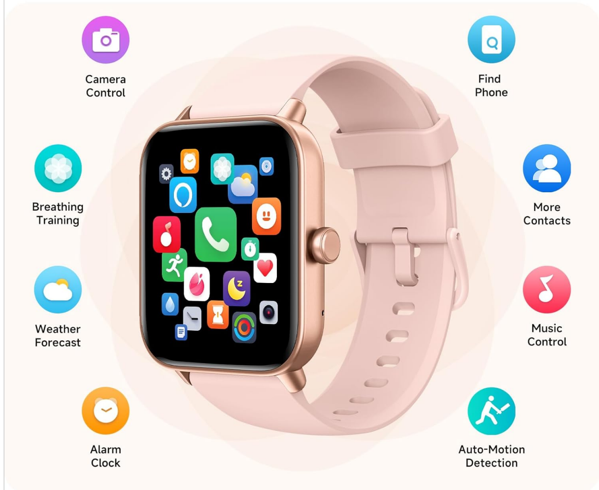
Image: The smartwatch screen showing a grid of icons representing various functions such as camera control, find phone, breathing training, weather forecast, alarm clock, music control, and auto-motion detection.