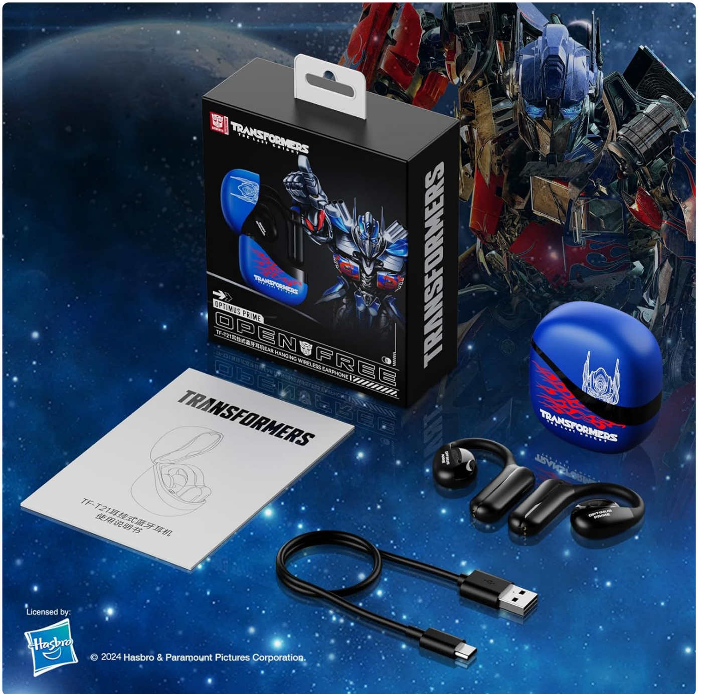
Figure 2: Package contents of the Transformers TF-T21 Open Ear Headphones.