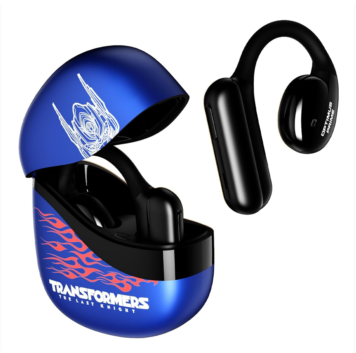
Figure 3: Transformers TF-T21 Open Ear Headphones and Charging Case.