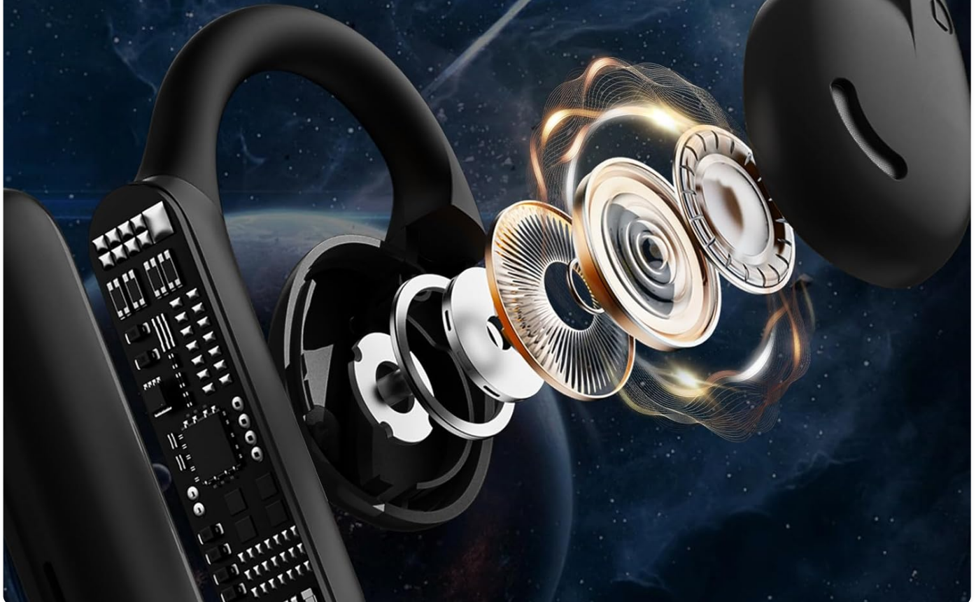
Figure 5: Internal components and sound technology of the TF-T21 headphones.