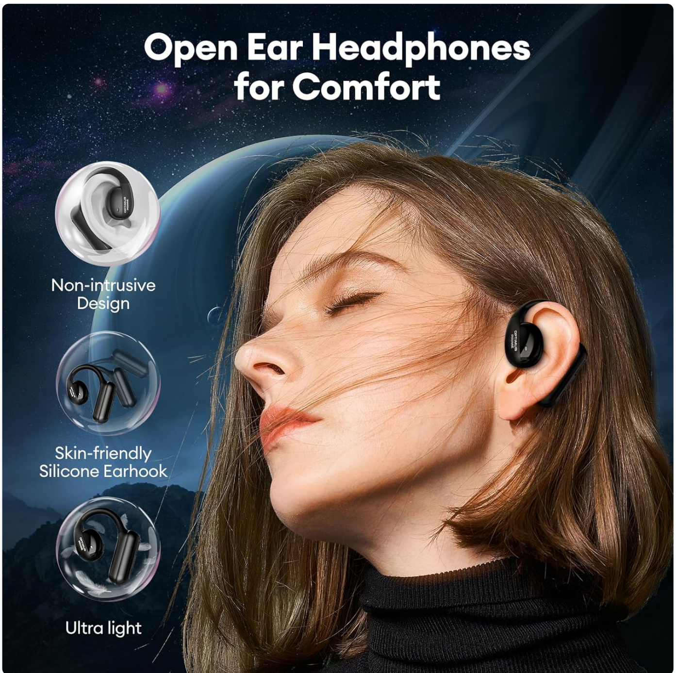
Figure 4: Comfort features of the TF-T21 Open Ear Headphones.