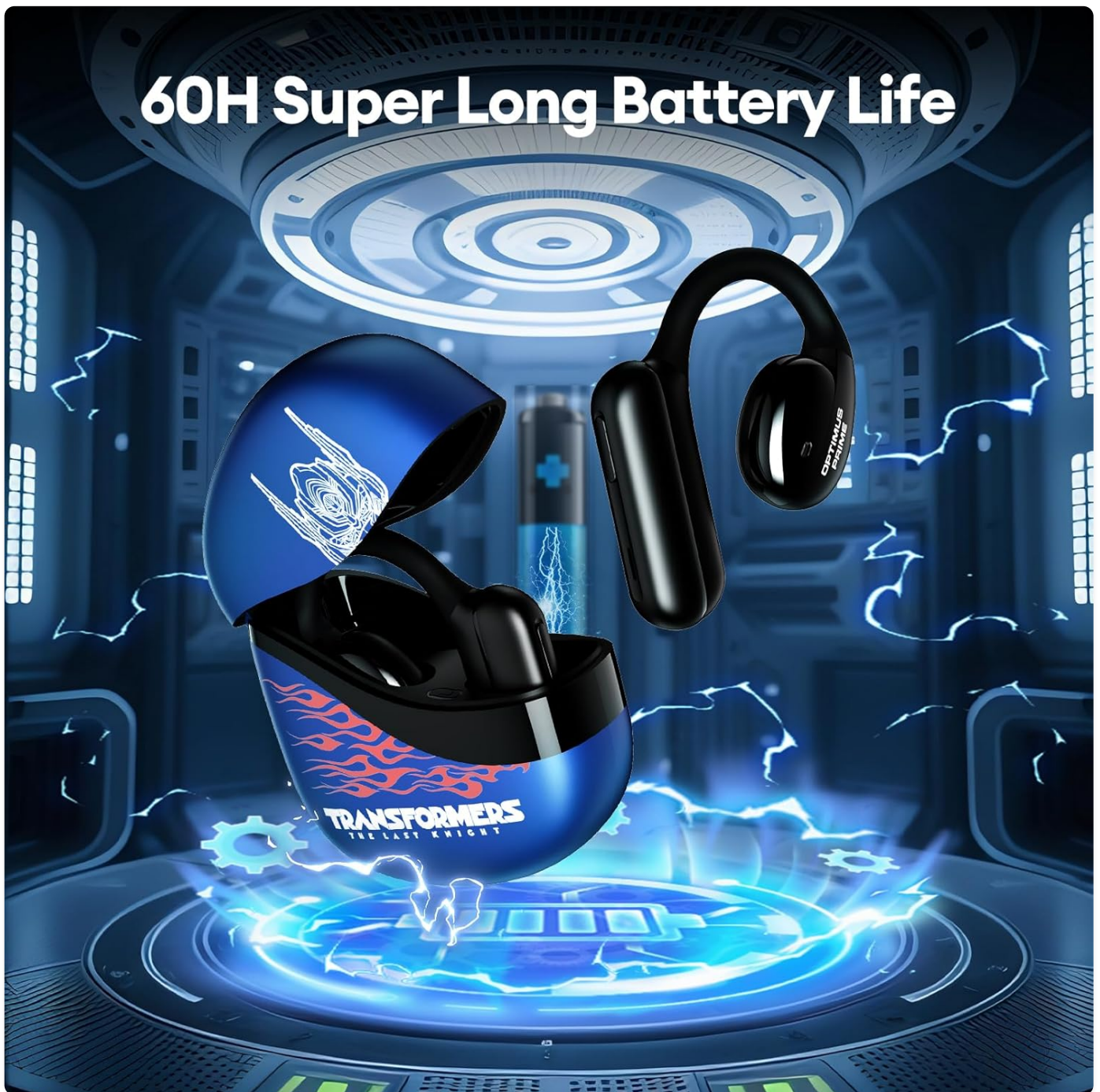
Figure 6: Charging the TF-T21 Headphones and Case.