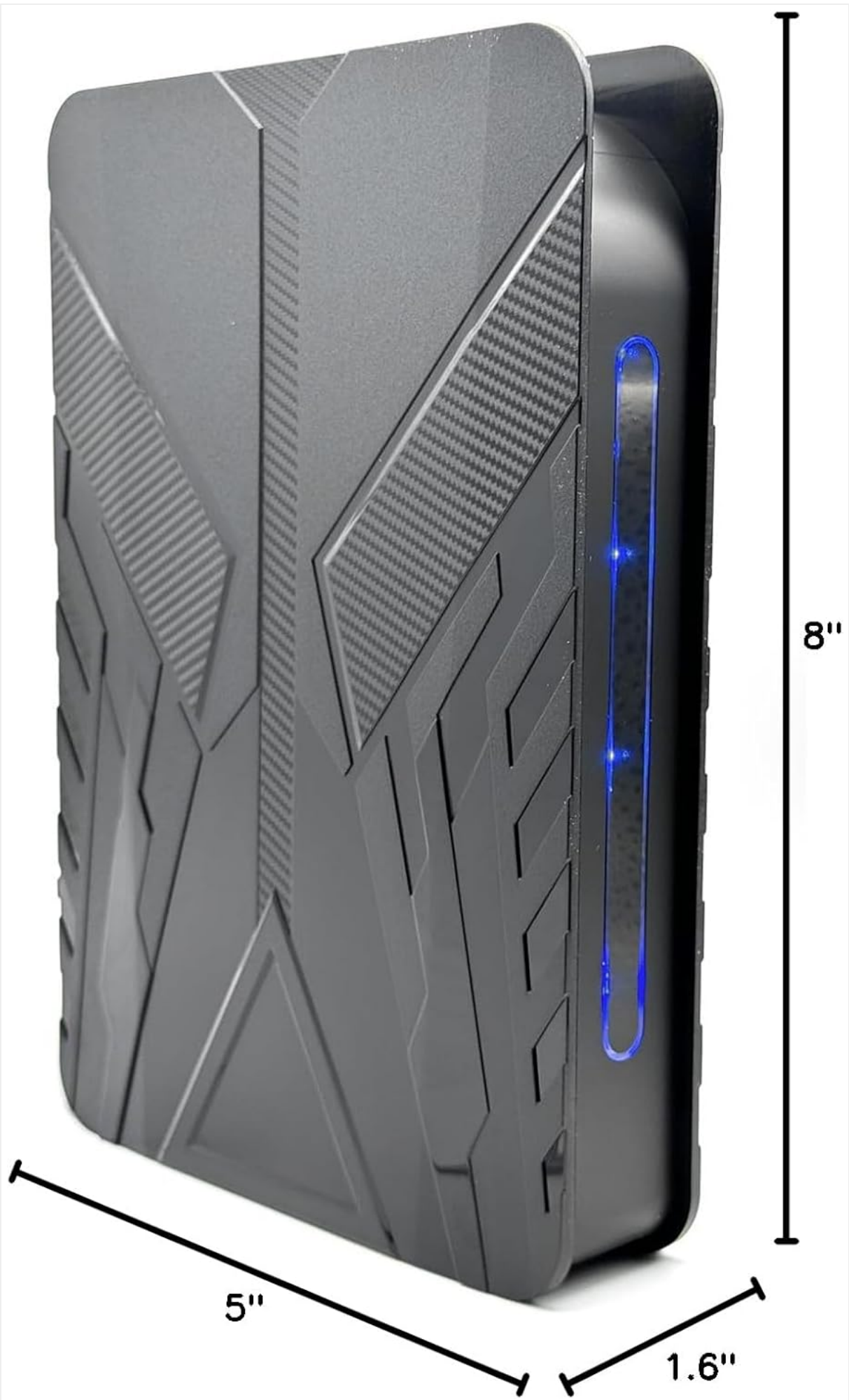
Image: Dimensions of the Avolusion PRO-T8 Series external hard drive, showing its length, width, and height.