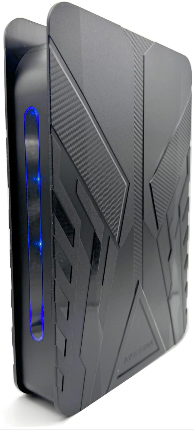
Image: Angled view of the Avolusion PRO-T8 Series external hard drive, highlighting its textured black casing and the blue LED status indicator.