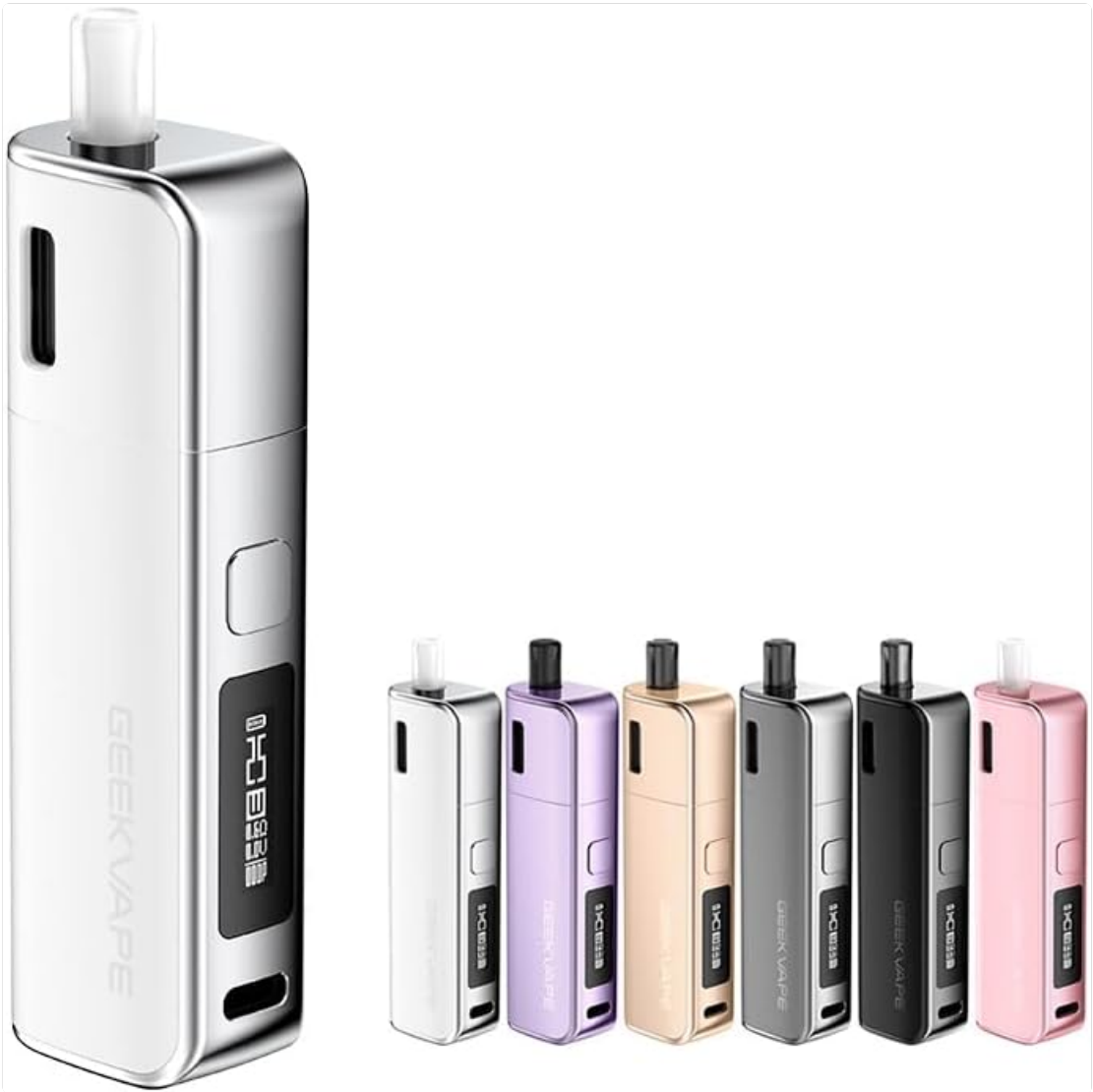
Image: The GEEK VAPE Soul AIO Pod System Kit in white, with a display of various available colors.