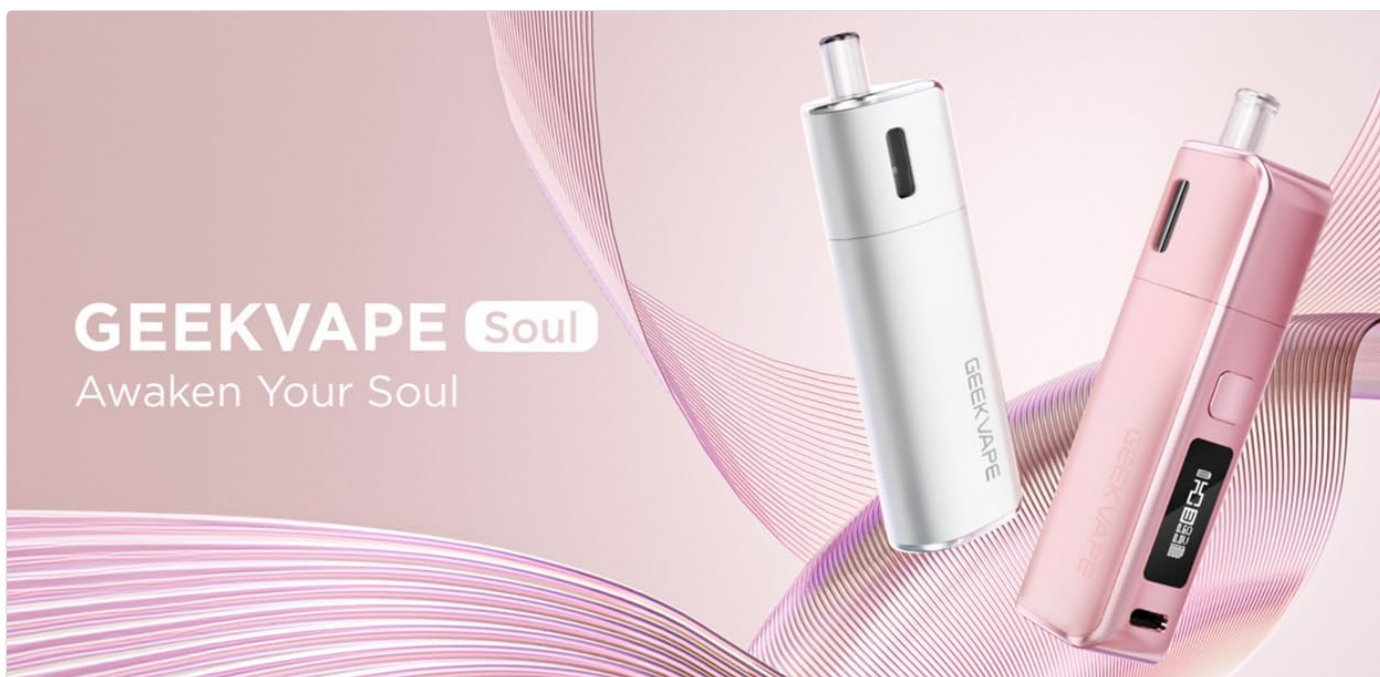
Image: The GEEK VAPE Soul AIO Pod System Kit, highlighting its sleek design and the brand's tagline.

The GEEK VAPE Soul AIO Pod System Kit is an innovative and elegantly designed open pod system. Engineered for comfort and ease of use, its ergonomic form factor provides a superior tactile experience. Featuring a patented leak-proof design, this device ensures a worry-free vaping experience. With a large capacity cartridge and a robust 1500mAh battery, the Soul Kit allows for extended enjoyment of your favorite e-liquids.