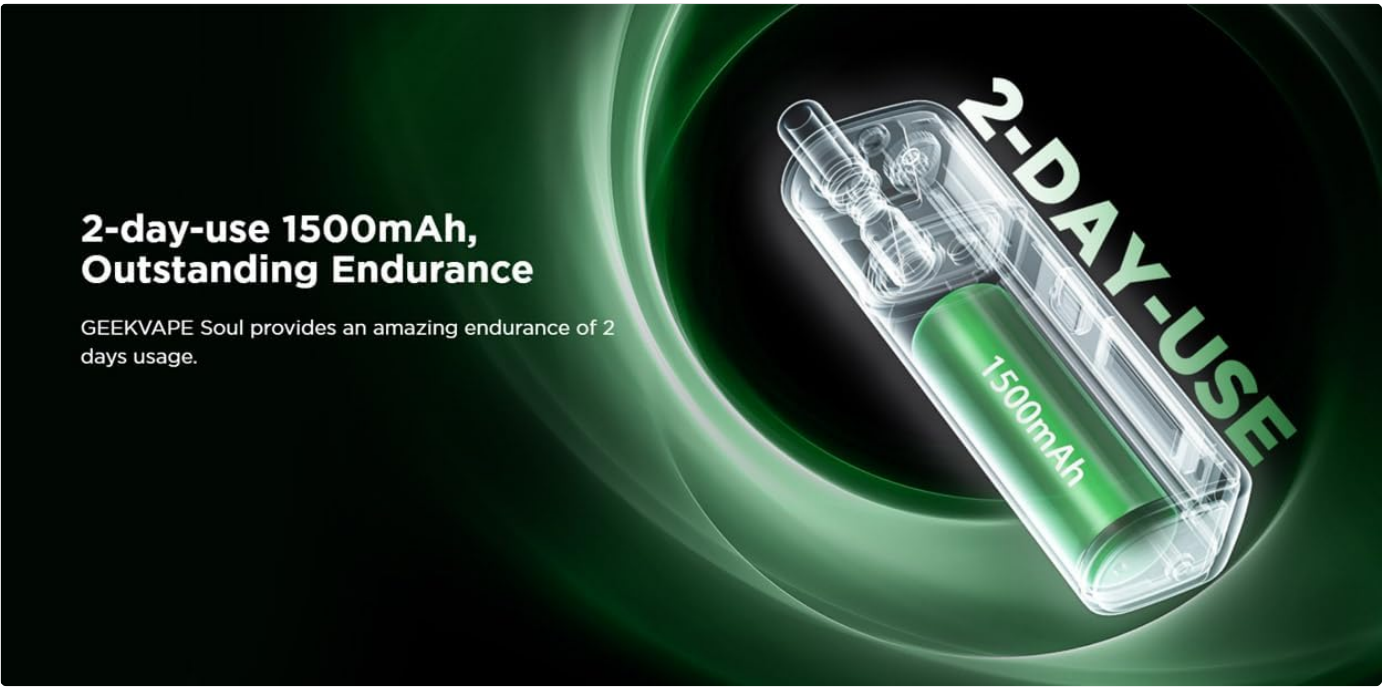
Image: An illustration highlighting the 1500mAh battery capacity, indicating up to two days of usage.