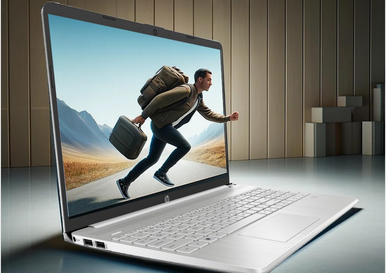
Figure 1: HP Laptop 15 Essential, showcasing its display and keyboard layout.