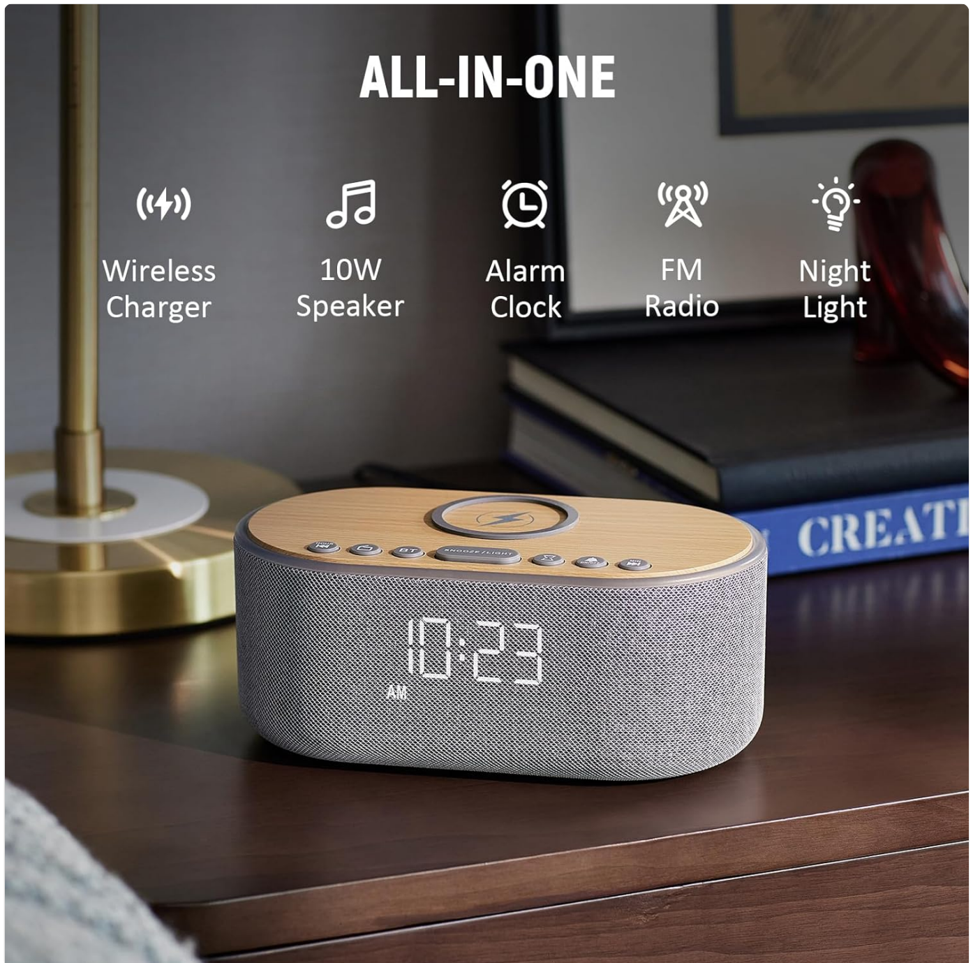
Figure 2: Overview of the uscce Alarm Clock's all-in-one functionalities.