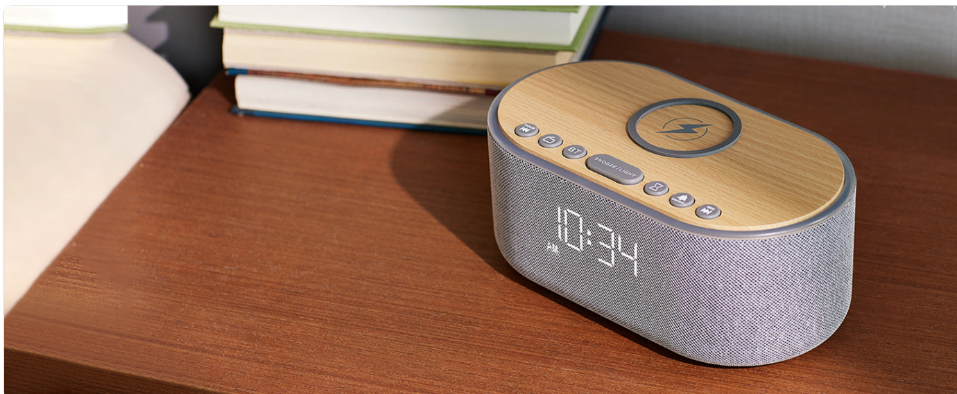
Figure 5: The alarm clock showcasing its 7-color night light options.