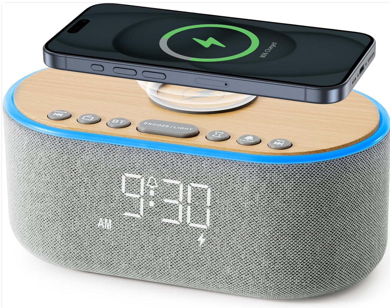
Figure 1: The uscce Alarm Clock Bluetooth FM Radio with a smartphone placed on its wireless charging pad.

This manual provides detailed instructions for the setup, operation, and maintenance of your uscce Alarm Clock Bluetooth FM Radio. Please read this manual thoroughly before using the product to ensure proper function and longevity.