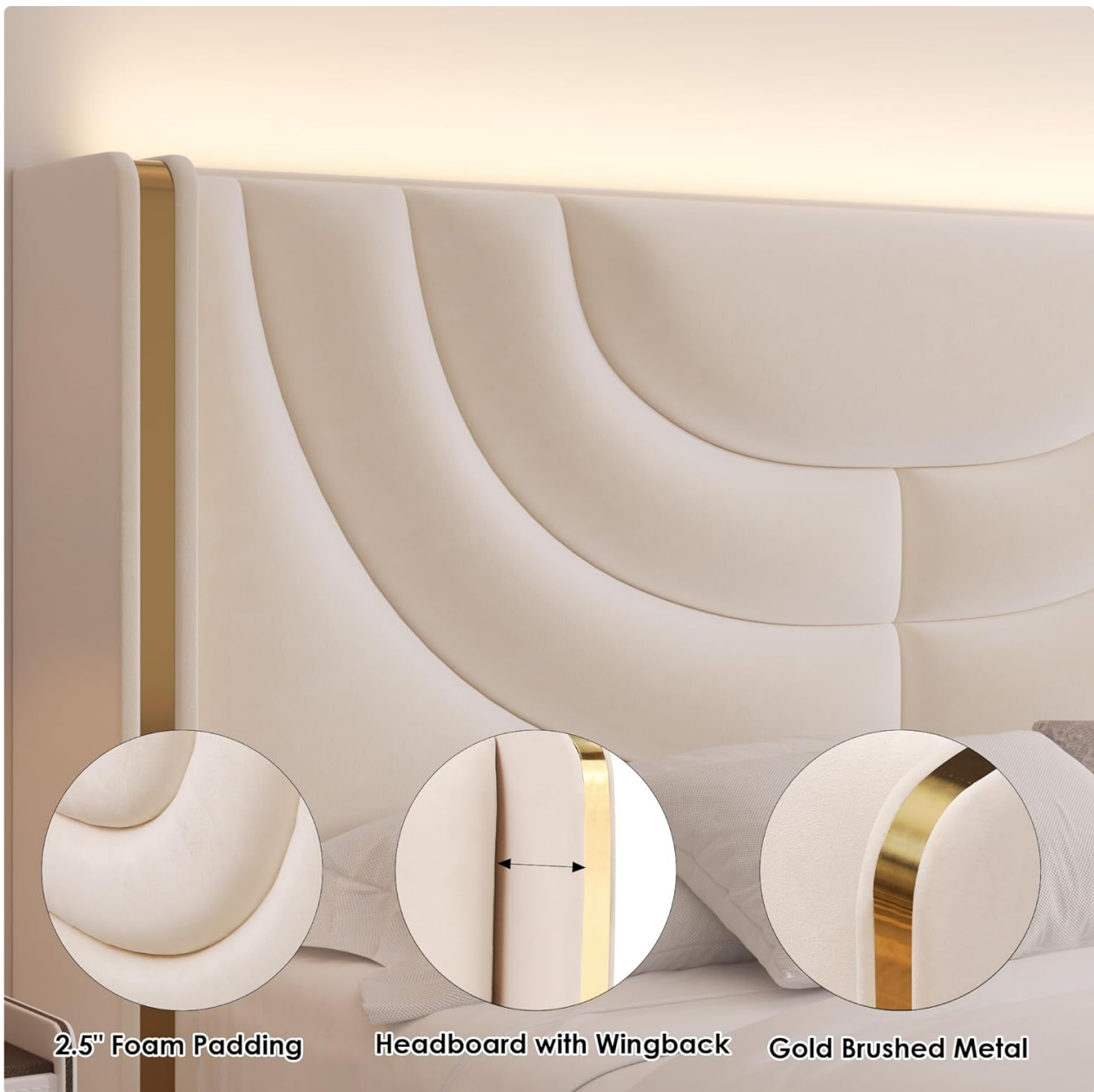
Image: Detailed views of the headboard, highlighting its 2.5" foam padding for comfort, the elegant wingback design, and the gold brushed metal accents that provide a modern aesthetic.