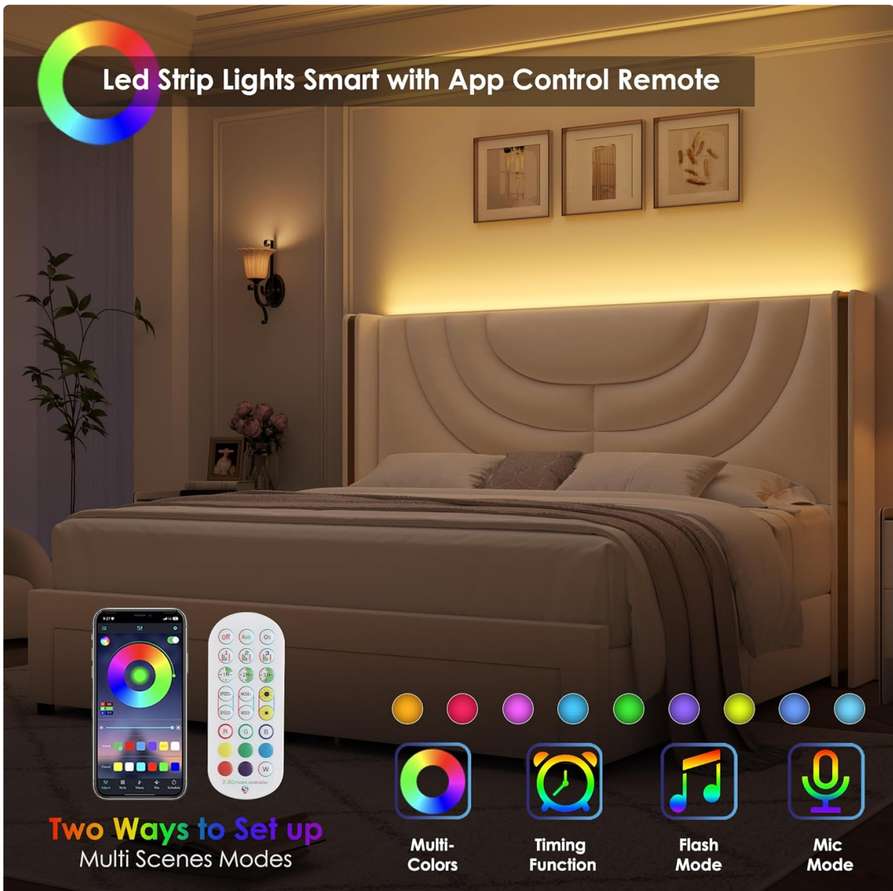
Image: A visual representation of the LED strip lights with options for control via a remote and a smartphone app, highlighting features like multi-colors, timing function, flash mode, and mic mode.

The integrated RGB LED lights in the headboard offer customizable ambiance for your bedroom. They can be controlled via the included remote control or a dedicated smartphone application.