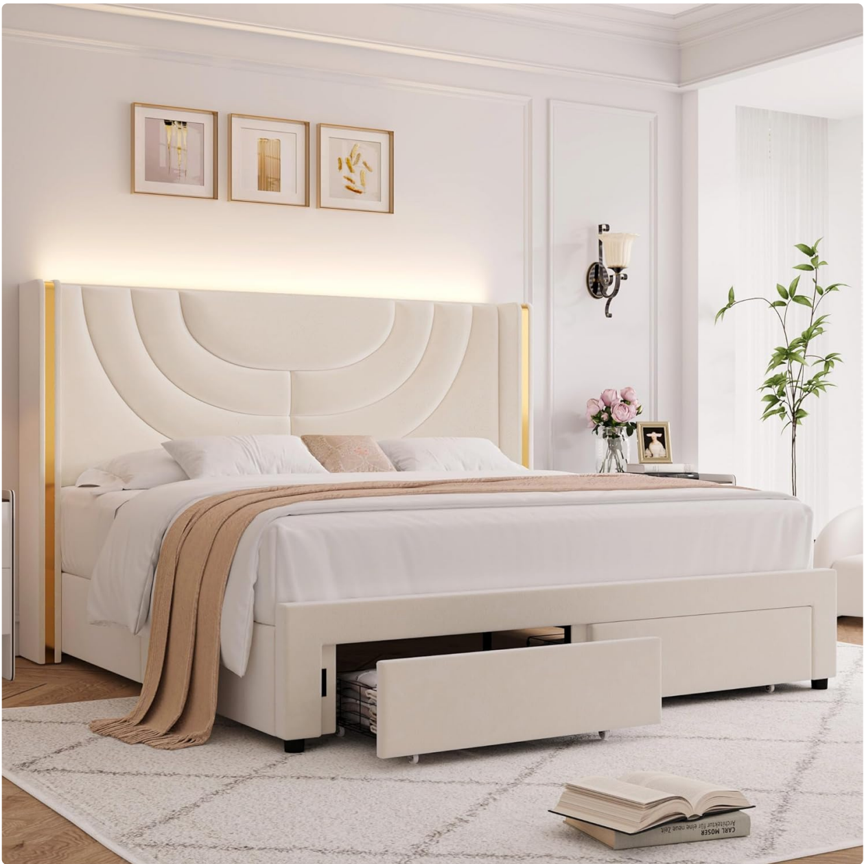
Image: The HITHOS King Upholstered LED Bed Frame, showcasing its beige velvet upholstery, wingback headboard, and integrated LED lighting, with one storage drawer partially open.