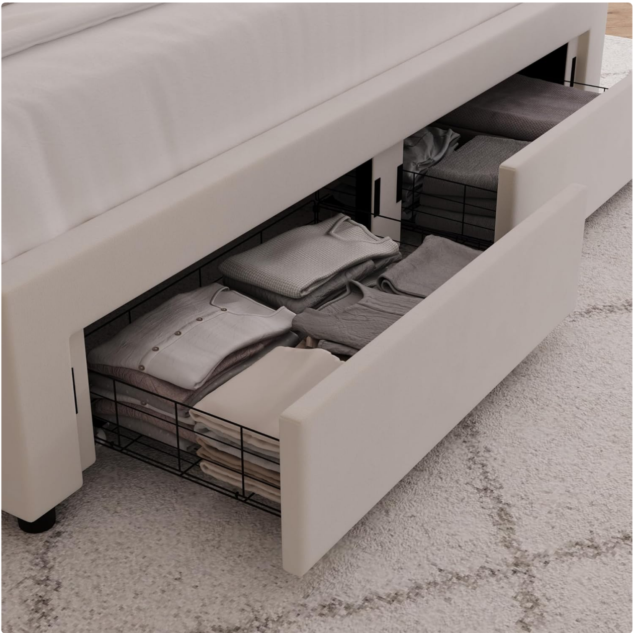
Image: A close-up view of one of the under-bed storage drawers, pulled out to reveal folded clothes and other items stored within, demonstrating its practical use.