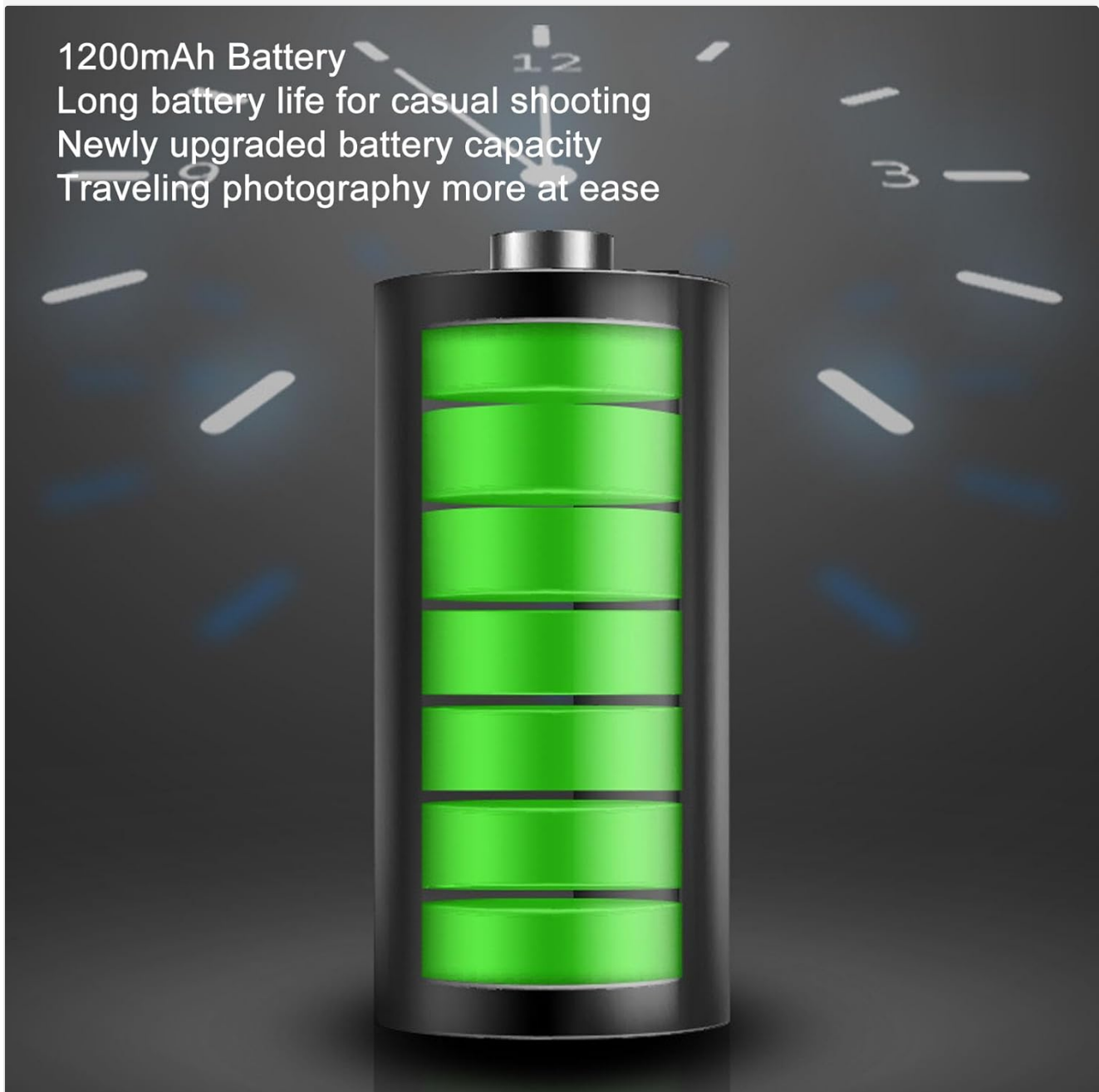
Figure 4: Battery charge indication.