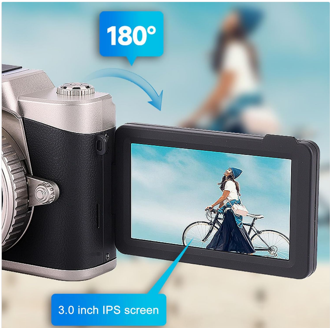
Figure 5: The 180° flip screen in action.