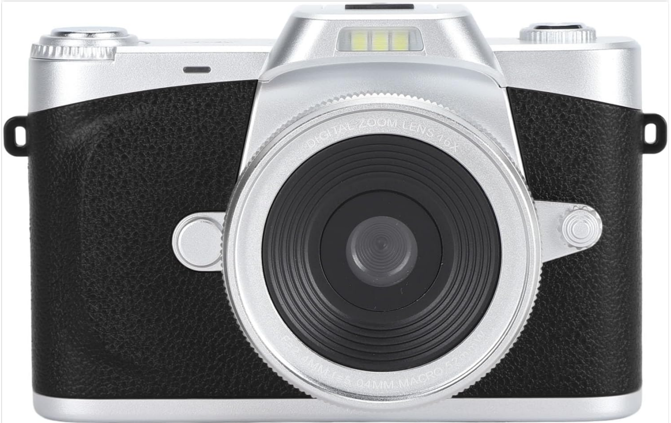
Figure 1: Front view of the Goshyda Smart Digital Camera.

Thank you for choosing the Goshyda Smart Digital Camera. This manual provides essential information for the proper setup, operation, and maintenance of your camera. Please read it thoroughly before use to ensure optimal performance and longevity of your device.