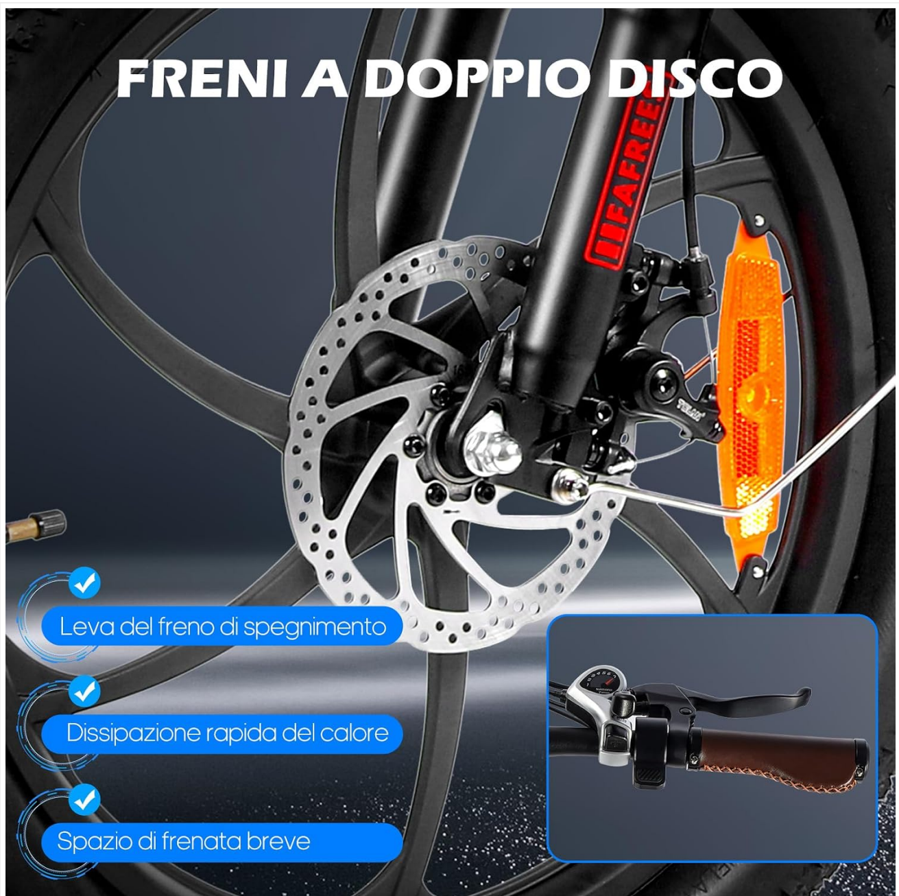
Figure 4.2: Front disc brake system, highlighting the brake lever with power cut-off function.