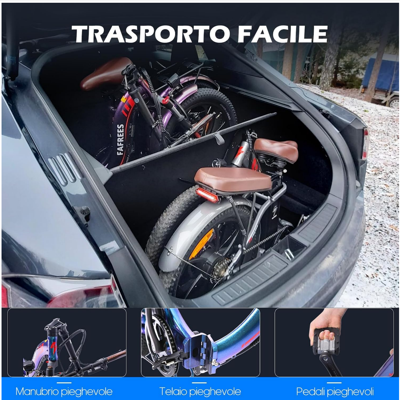
Figure 3.1: The F20 Pro's folding handlebar, frame, and pedals for easy transport.