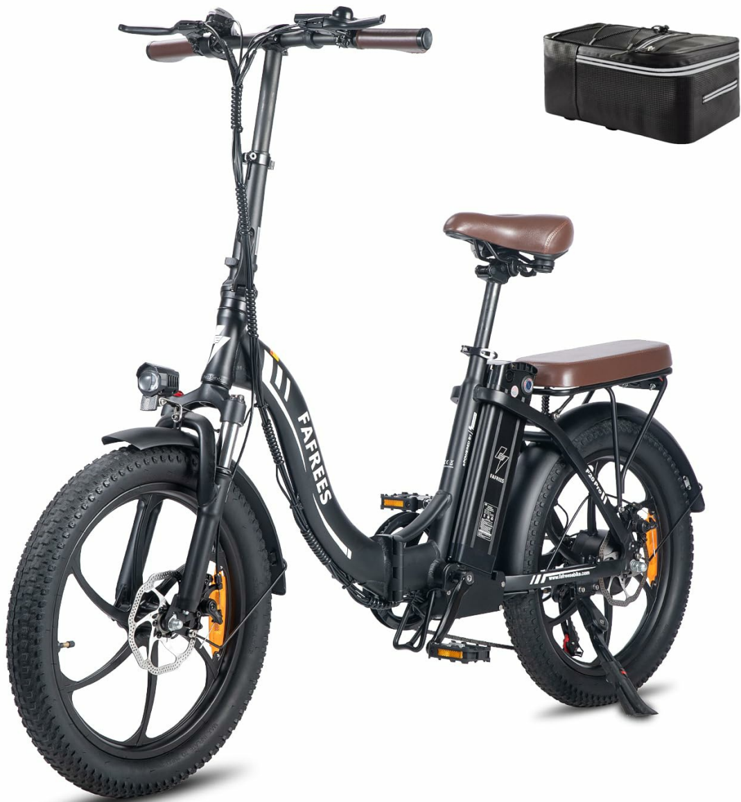
Figure 2.1: Fafrees F20 Pro Electric Folding Bicycle in black.