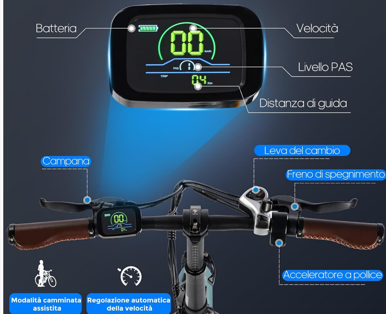
Figure 2.4: Intelligent LCD color display and handlebar controls, including bell, gear shifter, brake levers, and thumb throttle.