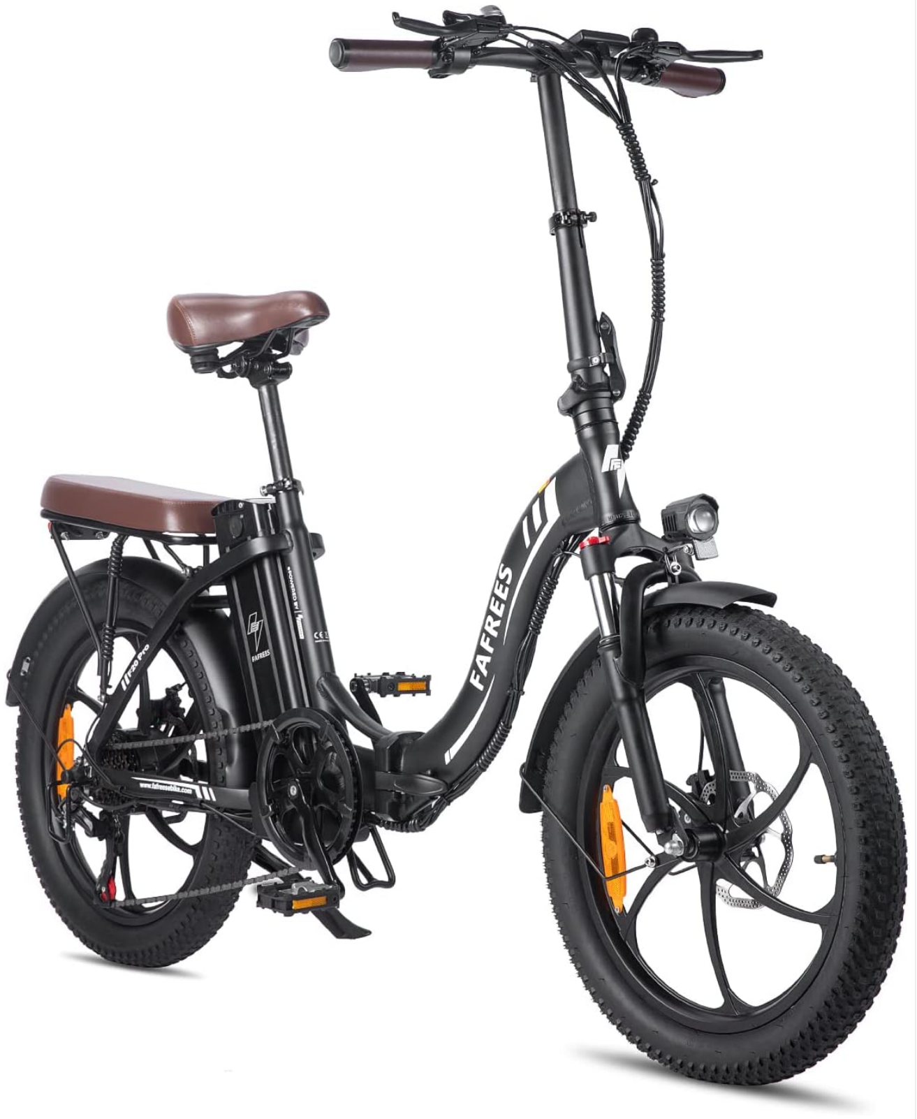
Figure 2.2: The 36V 18Ah lithium-ion battery, providing extended range.