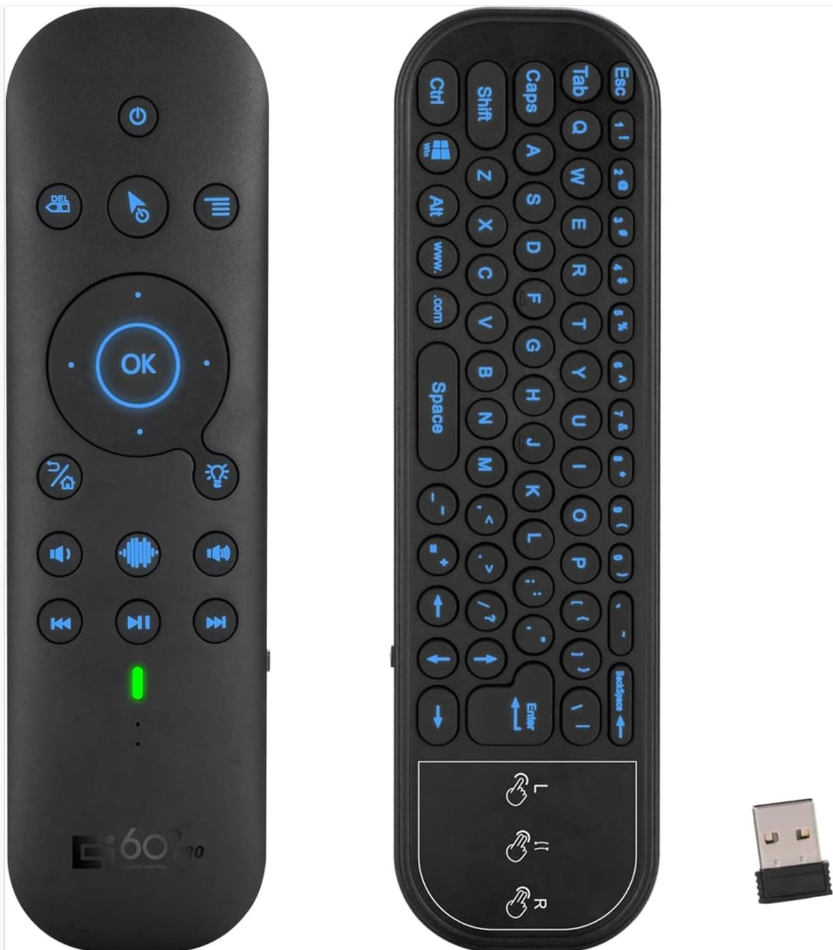
Image: The G60S Pro BT remote control showing both its front (remote) and back (keyboard with touchpad) sides, alongside its USB receiver.

The G60S Pro BT is a multi-functional air mouse remote control designed for versatile use with various smart devices. It features a dual-sided design, with a traditional remote control interface on one side and a full QWERTY keyboard with a touchpad on the other. Key features include: