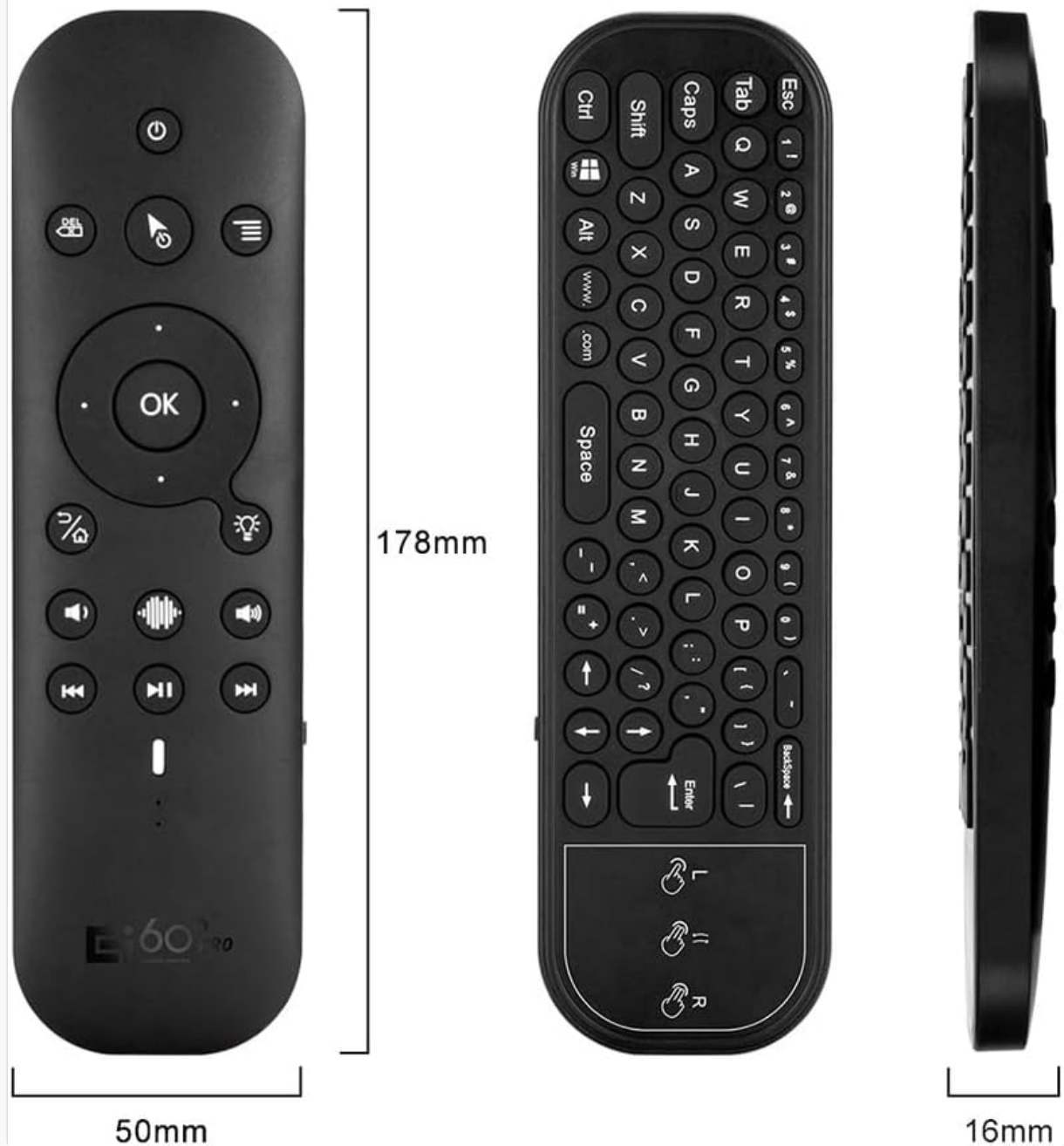
Image: Diagram showing the dimensions of the G60S Pro BT remote control, indicating a length of 178mm (7.01 inches),