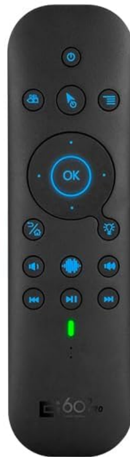
Image: Icons representing the key features of the G60S Pro BT: Bluetooth remote control, 2.4G wireless transmission, Voice Search, Gyroscope, Backlight, and Built-in batteries.