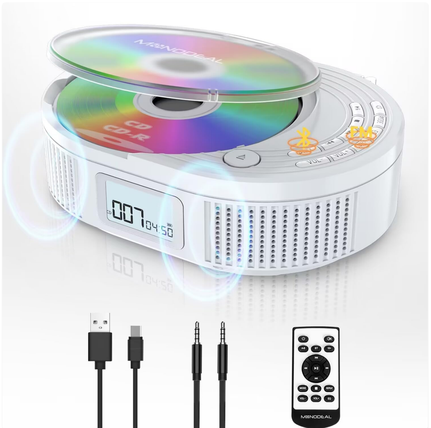
Image: The MONODEAL MD706 Portable CD Player shown with its USB-C charging cable, AUX cable, and remote control.