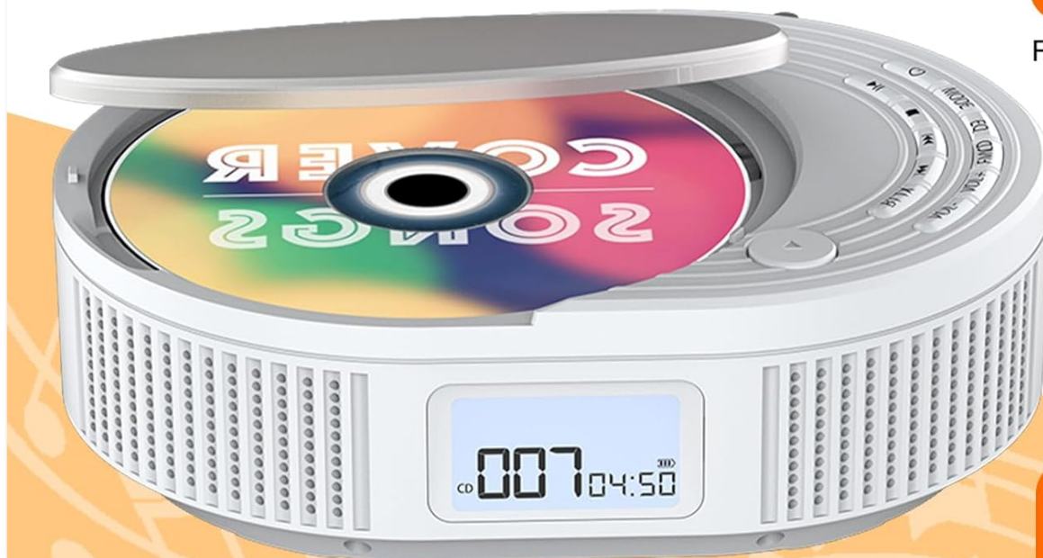
Image: Overview of the MD706's multi-functionality.