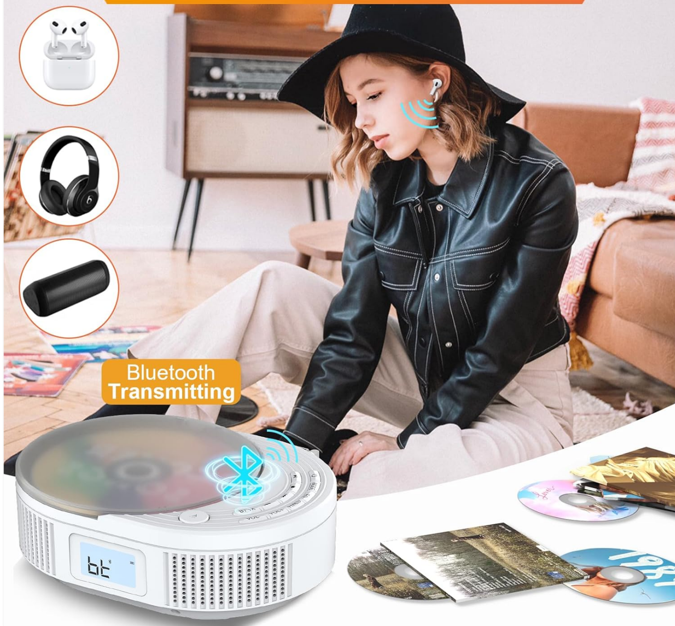
Image: Demonstrates Bluetooth transmitting functionality to external audio devices.