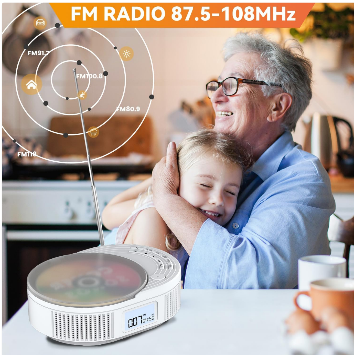
Image: Depicts the MD706 in FM radio mode, highlighting its antenna and frequency display.