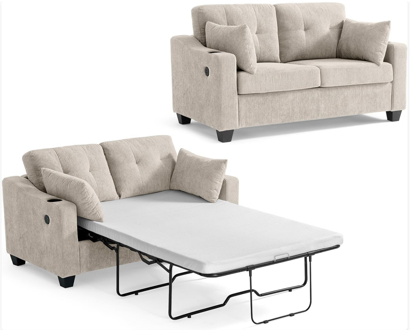
Image 1.1: The CHIC HOUSE CURLIN sofa bed shown as a sofa and extended into a bed.

The CURLIN sofa bed is designed for versatility, offering a comfortable seating area and a convenient full-size bed. It features a durable construction, integrated USB charging ports, LED lighting, and cup holders to enhance your living space.