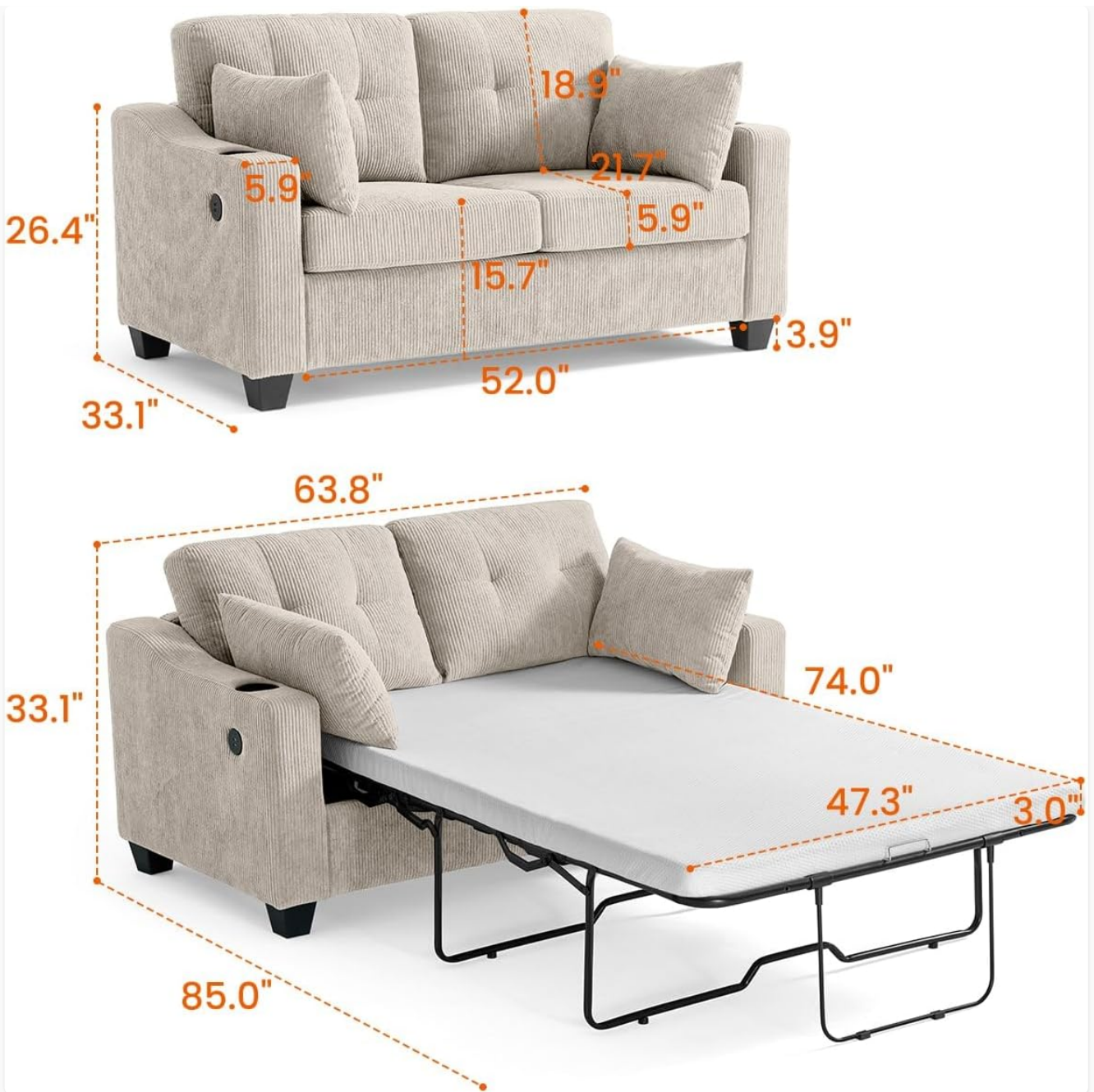
Image 8.1: Detailed dimensions of the sofa in both compact and extended bed configurations.