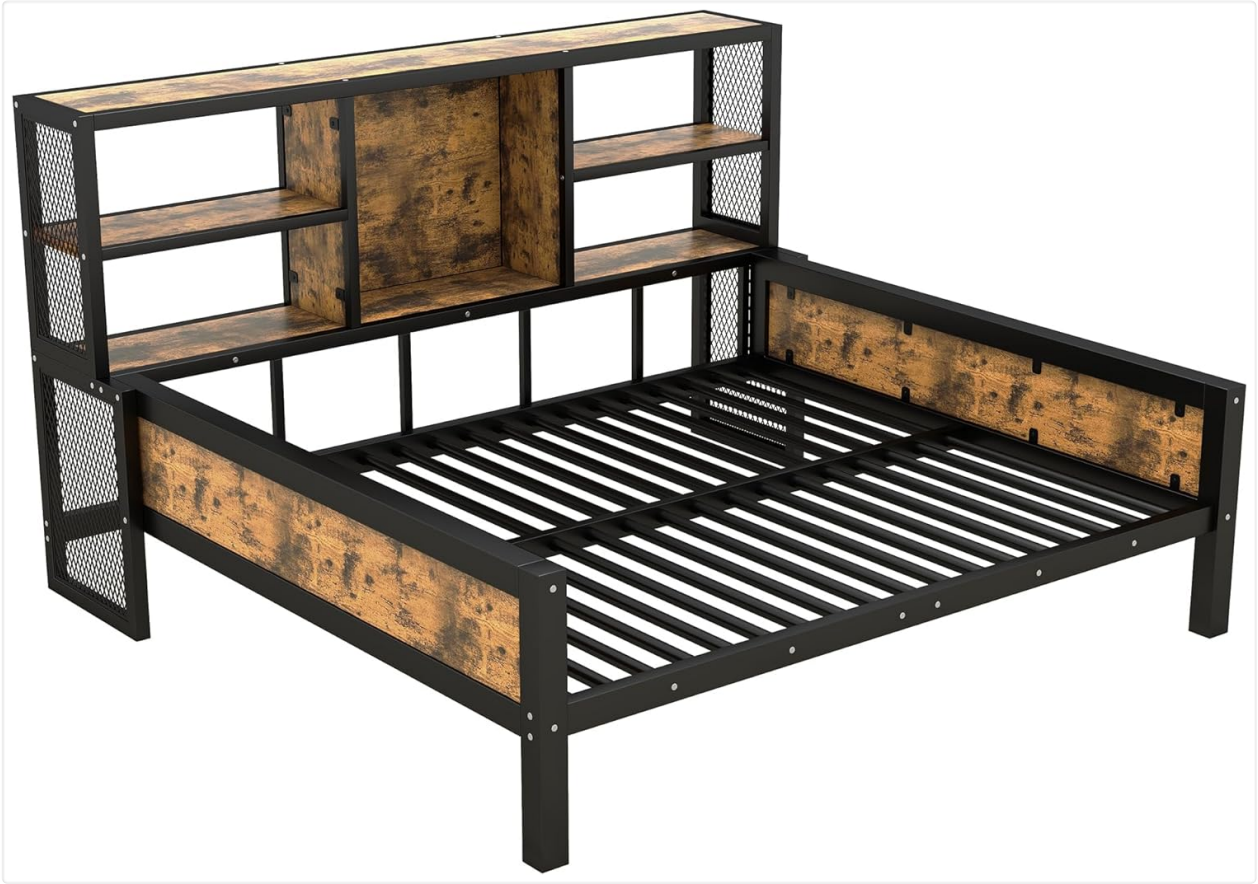
Image: Assembled Merax Daybed with Storage Shelves.

Once all components are in place, go back and fully tighten all bolts and fasteners. Ensure the daybed is stable and level before use.