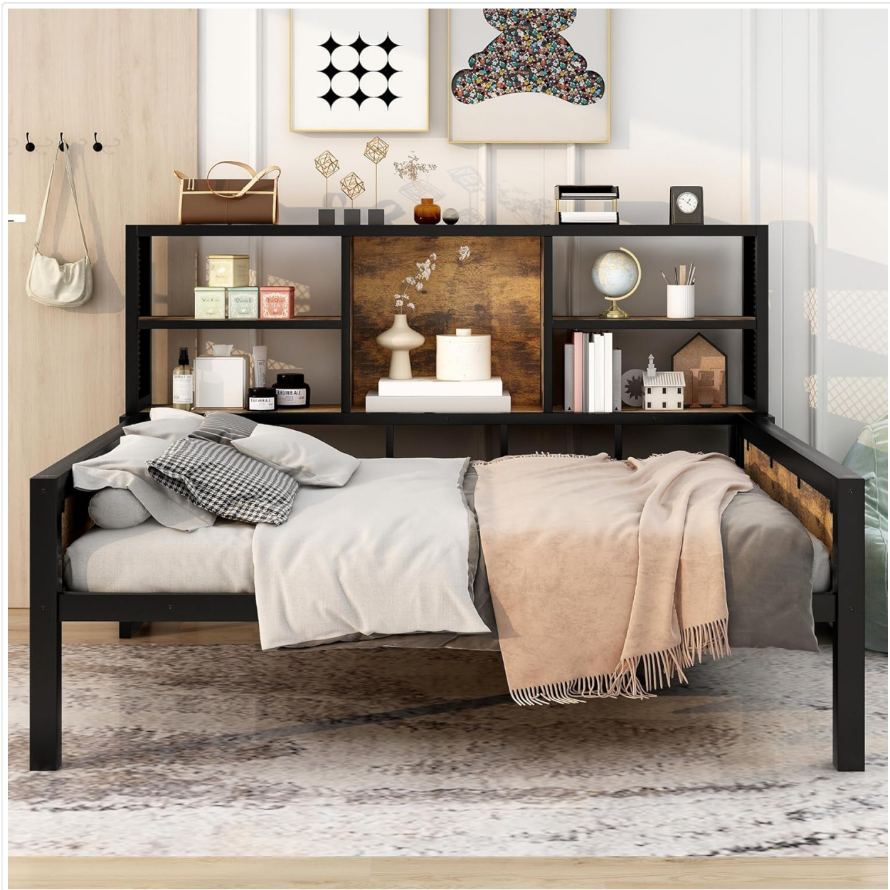
Image: Merax Daybed in a typical room setup.