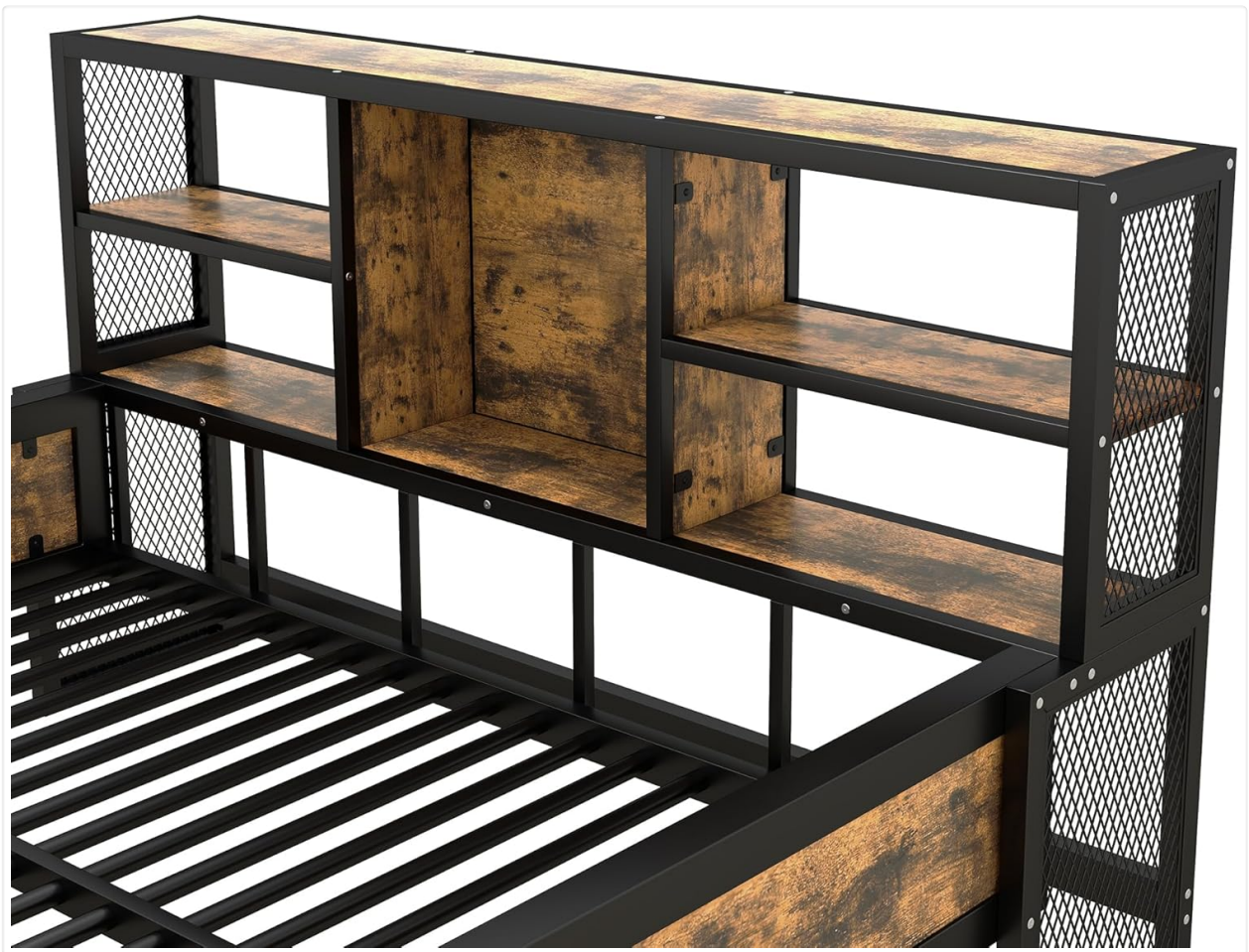
Image: Detail of the integrated storage shelves.

Assemble the storage shelf unit according to the diagrams in your physical instruction manual. Attach the completed shelf unit to the headboard section of the daybed frame using the designated hardware.