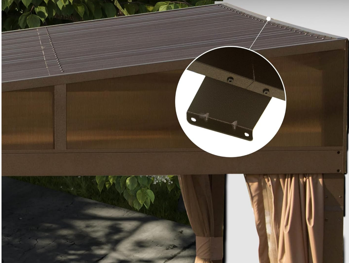
Image: Detail of the wall-mounted design, highlighting the attachment bracket for secure installation.

Straight side design can be against the wall to blend beautifully with your home.