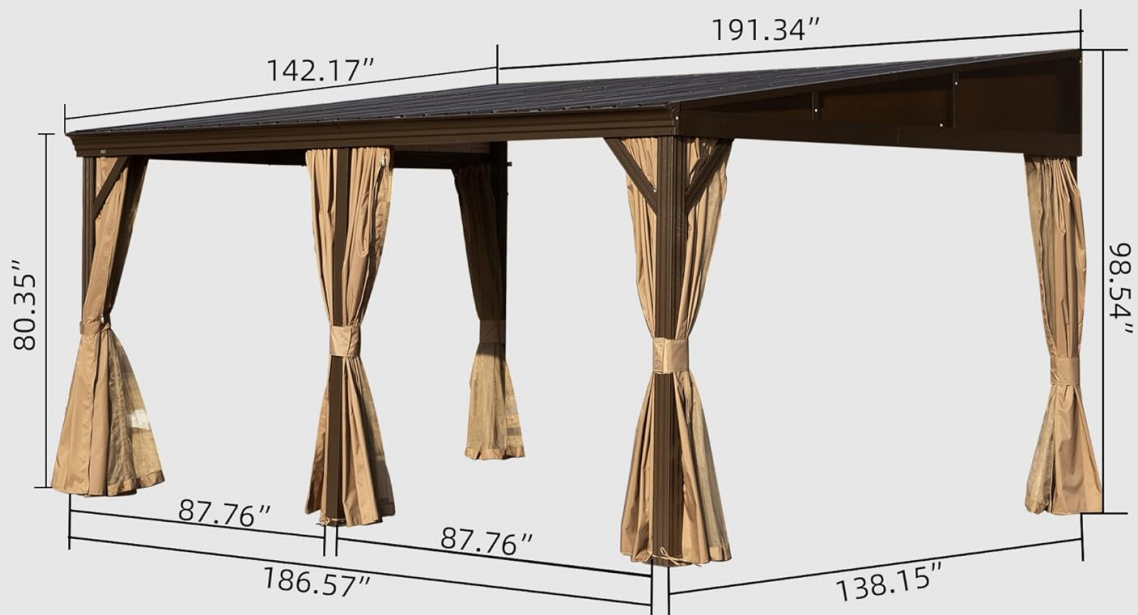
Image: Detailed dimensions diagram of the 12x16FT Wall-Mounted Gazebo.