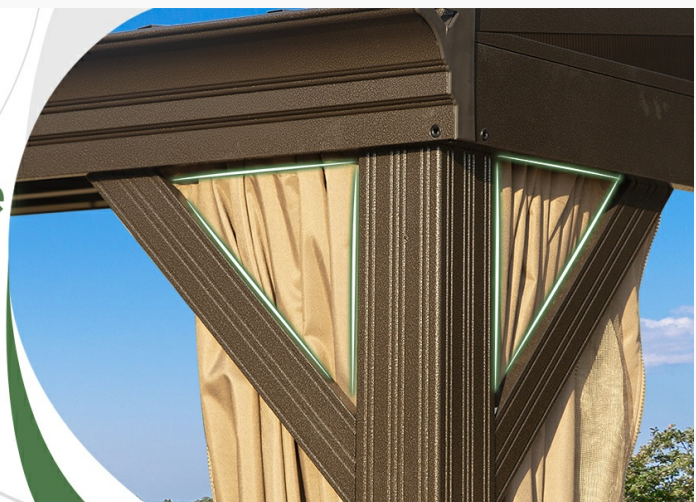
Image: The sturdy triangular aluminum structure of the gazebo frame, designed for stability and anti-rust properties.