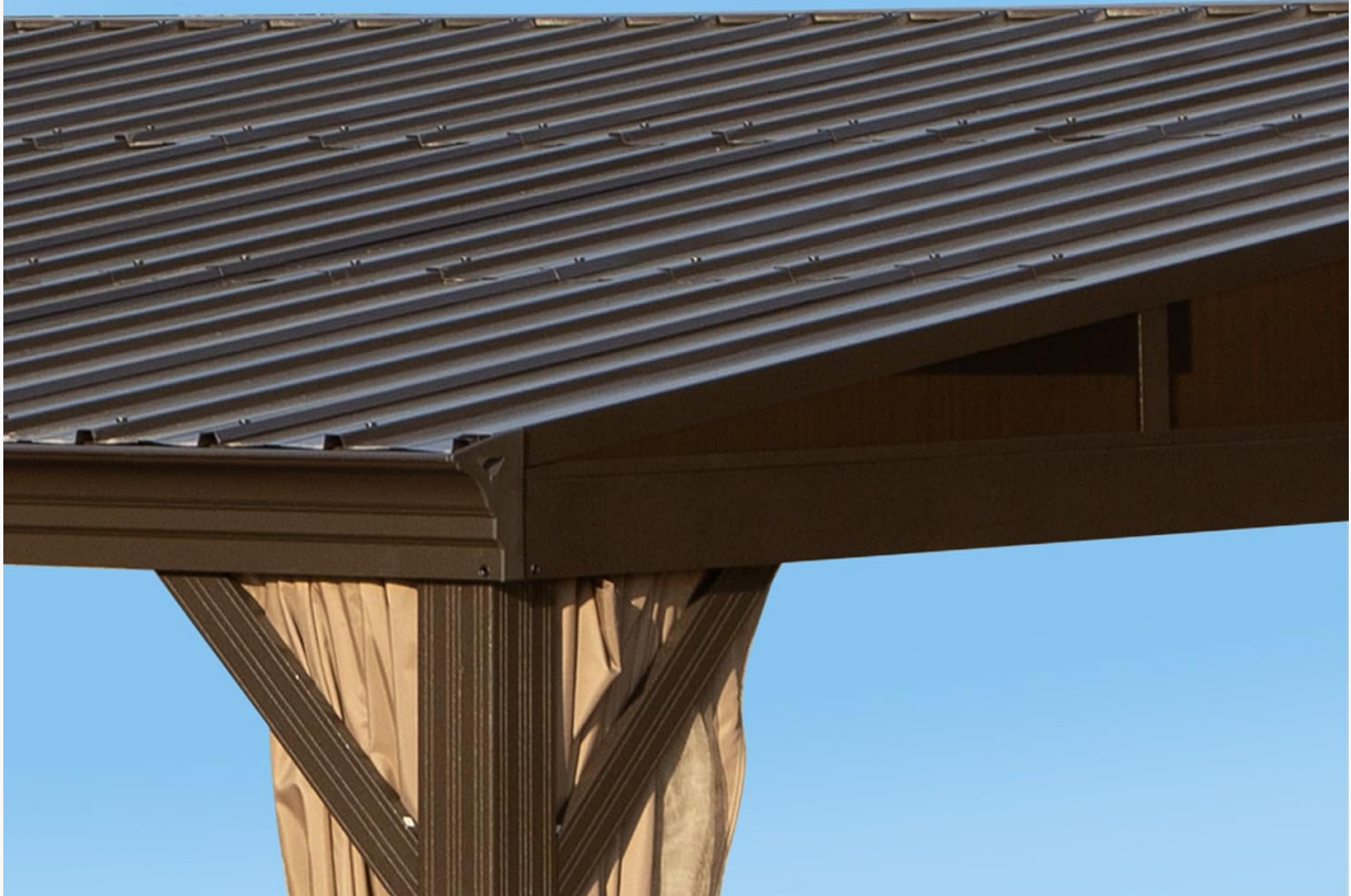
Image: The galvanized sloped roof, engineered for weather resistance and anti-corrosion, ensuring durability.