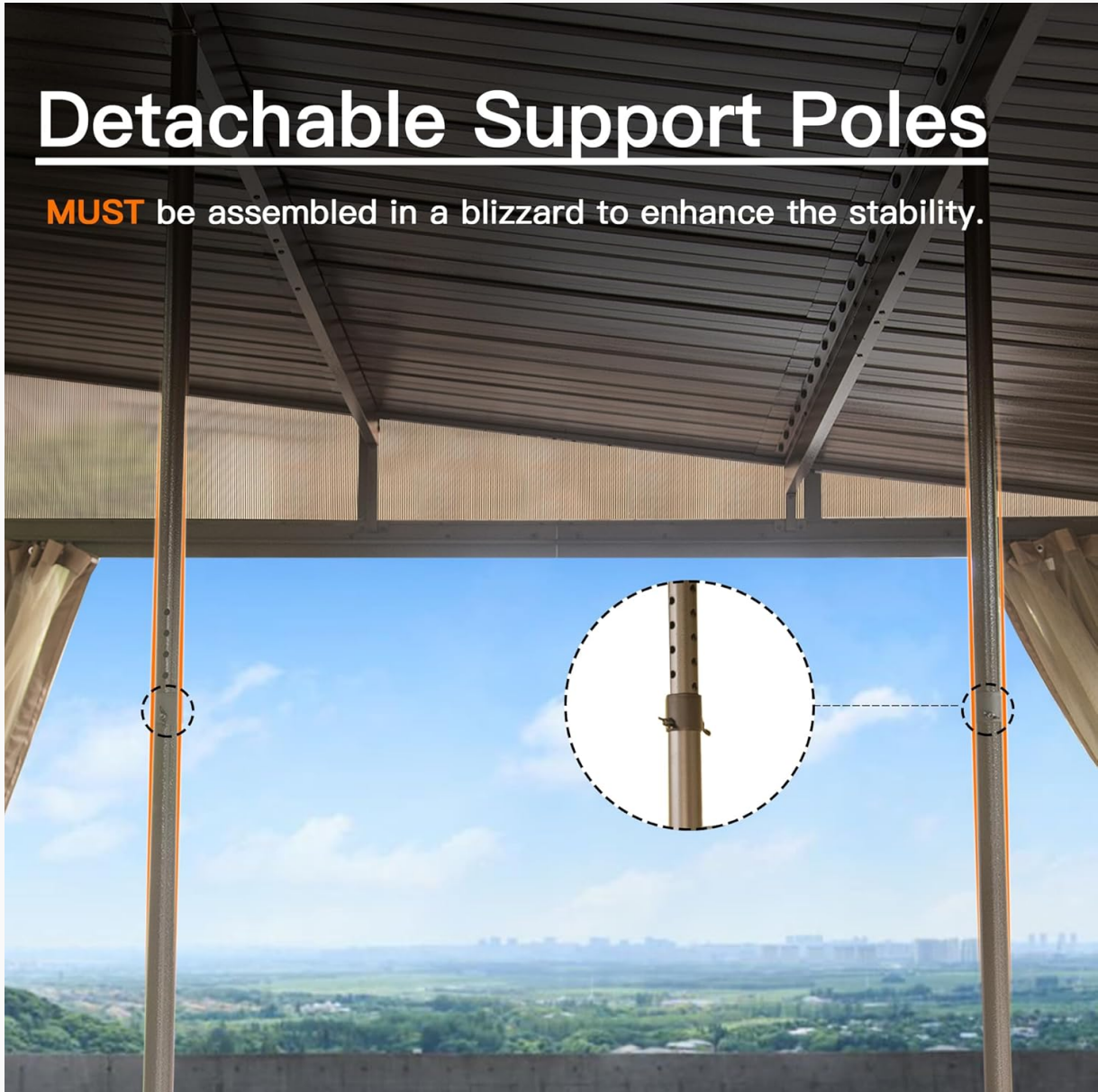
Image: Detachable support poles designed to enhance gazebo stability during heavy winter snow.

MUST be assembled in a blizzard to enhance the stability.