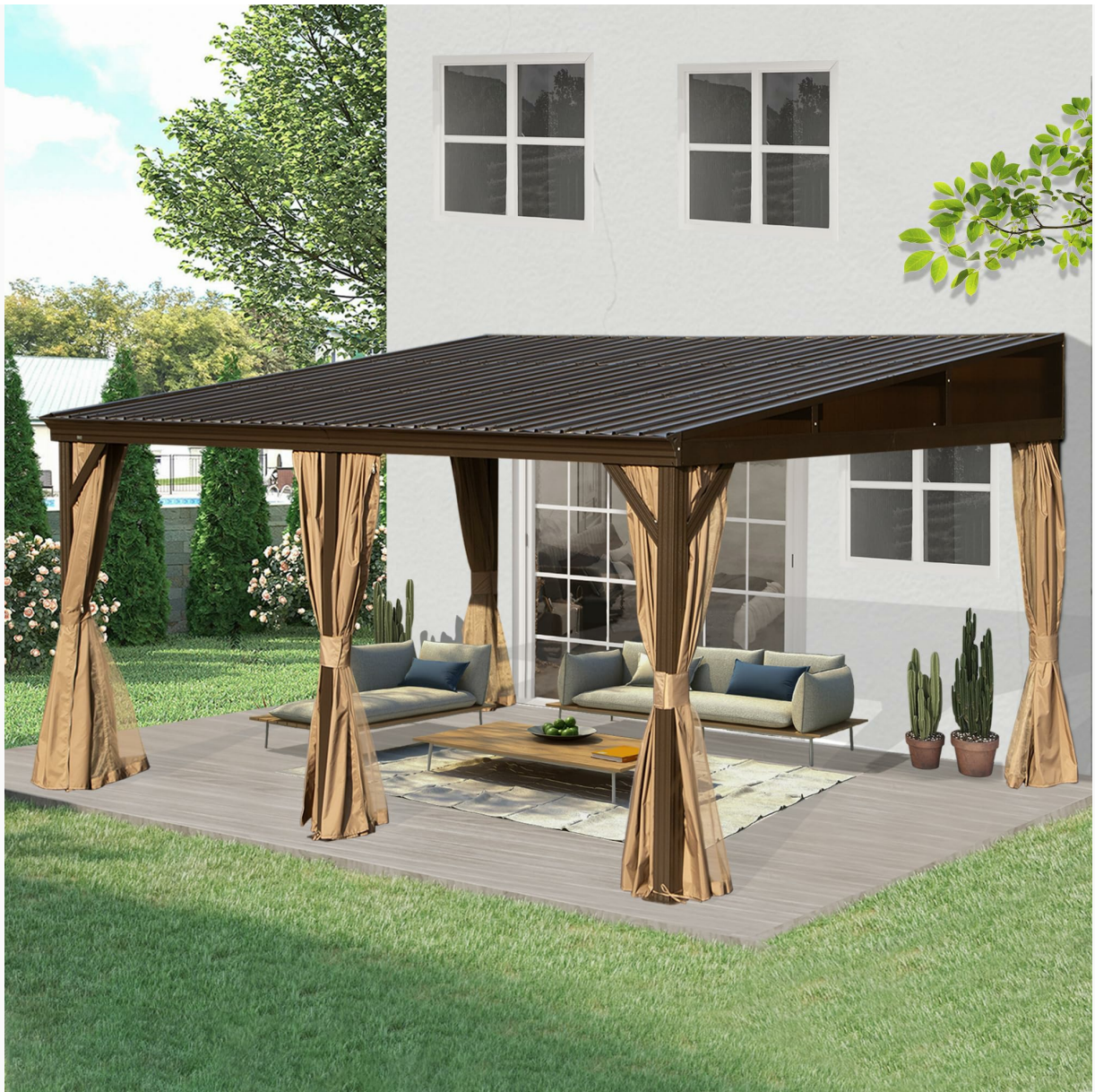
Image: The Domi 12x16FT Wall-Mounted Lean-to Gazebo providing a shaded outdoor living space.