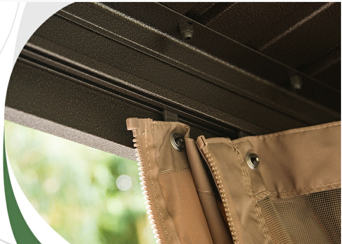
Image: Detail of the double track system, allowing separate control of mosquito netting and privacy curtains. Video: Demonstrates the interior space and features of a Domi Wall Mounted Sunroom, including sliding doors and general usage.