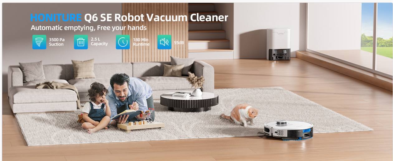
Image: The robot vacuum returning to its automatic dust collection station.