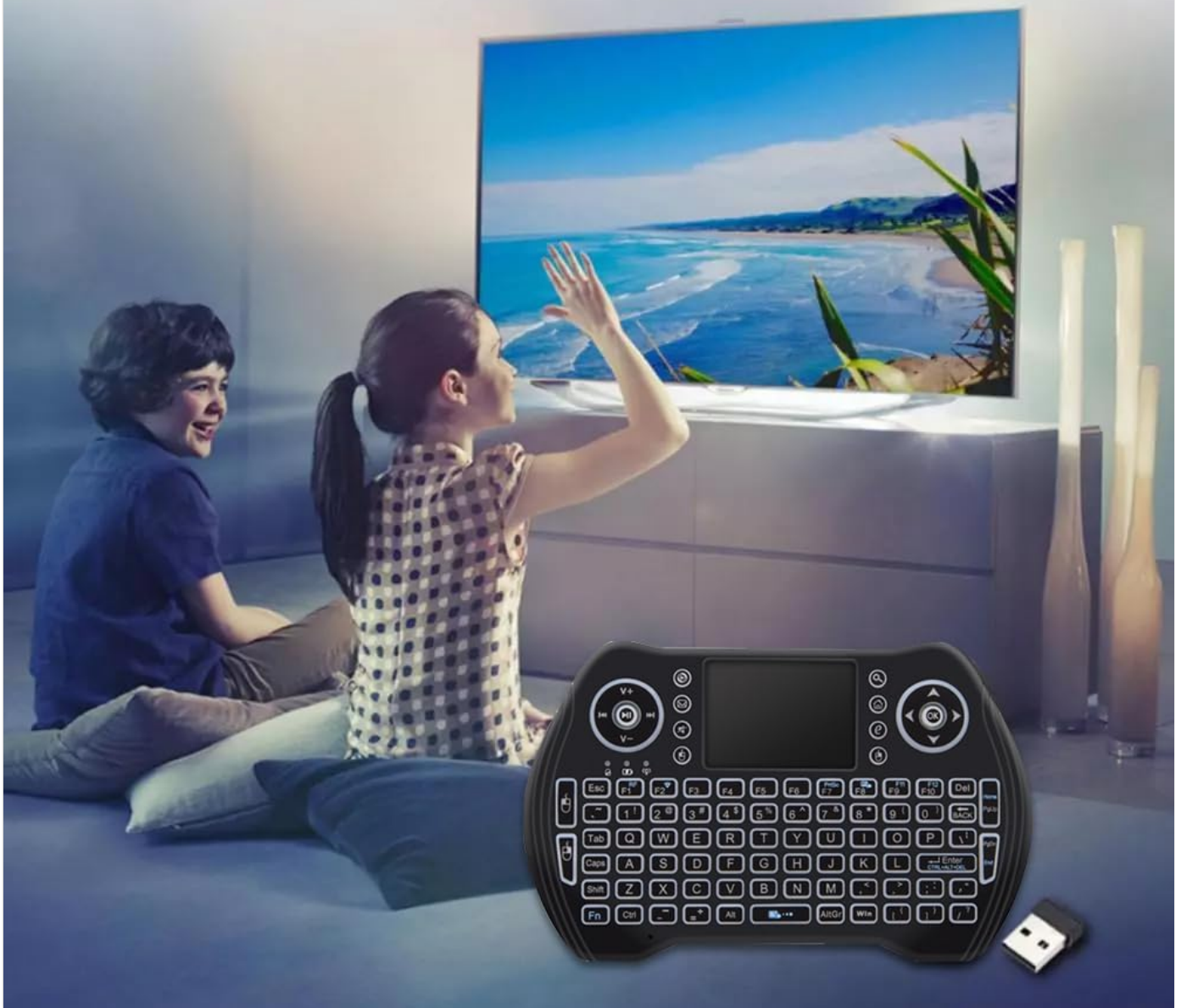
Image: Two individuals are shown comfortably using the BOXPOT MT10 mini wireless keyboard with a large screen TV, demonstrating its simple plug-and-play setup.