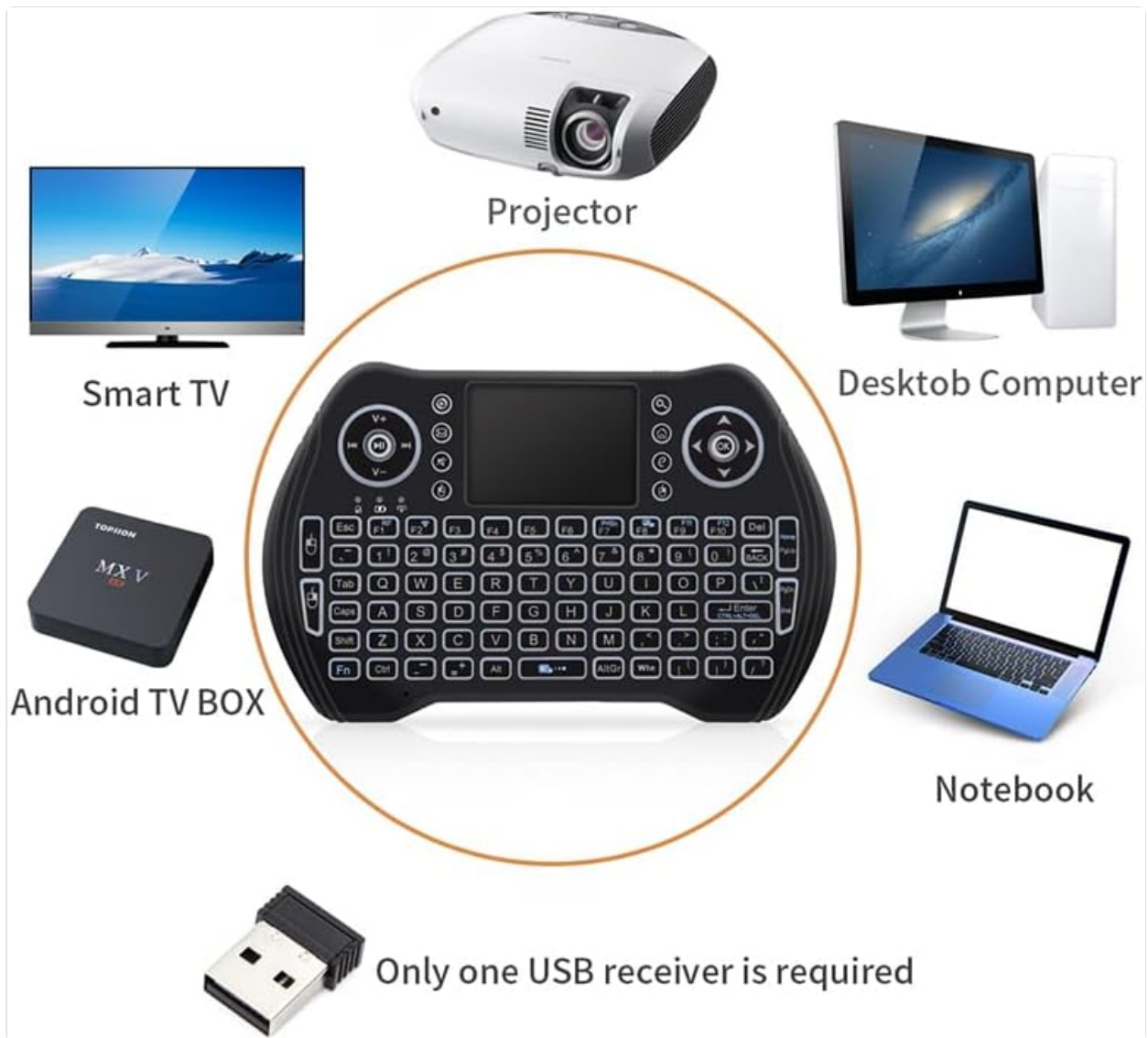
Image: The BOXPOT MT10 keyboard shown with its USB receiver and various compatible devices like Smart TV, Projector, Desktop Computer, Android TV Box, and Notebook. Only one USB receiver is required for connection.