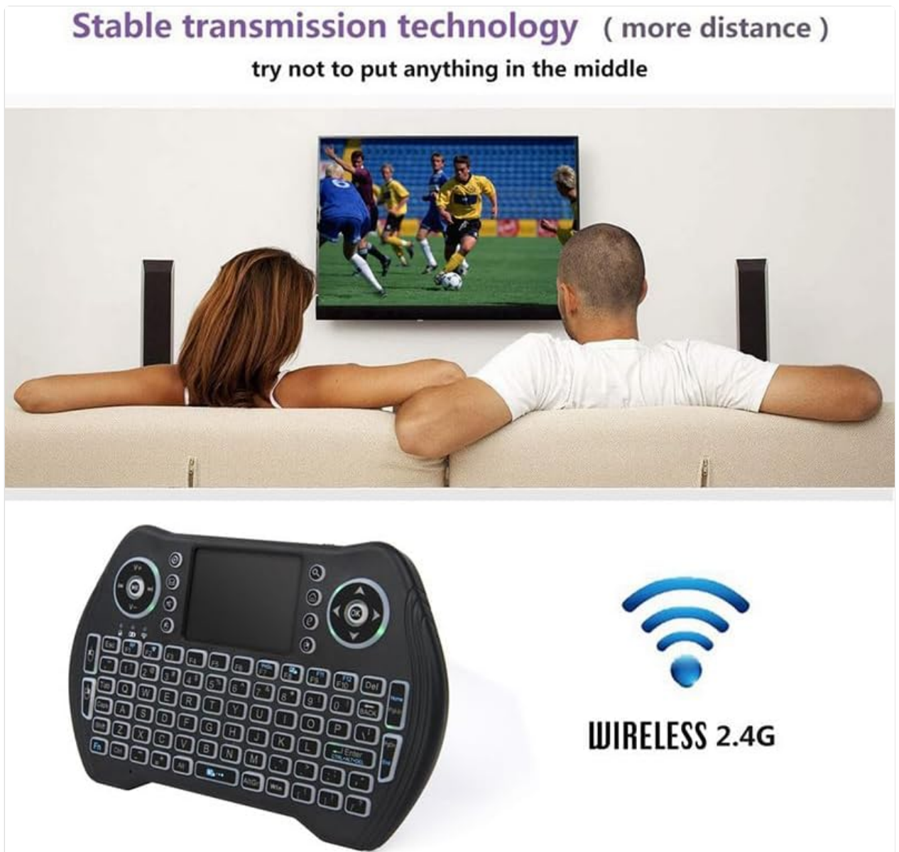
Image: The BOXPOT MT10 mini wireless keyboard is shown alongside a "Wireless 2.4G" signal icon, illustrating its stable transmission technology. It is advised to avoid placing obstructions between the keyboard and the receiver for optimal performance.