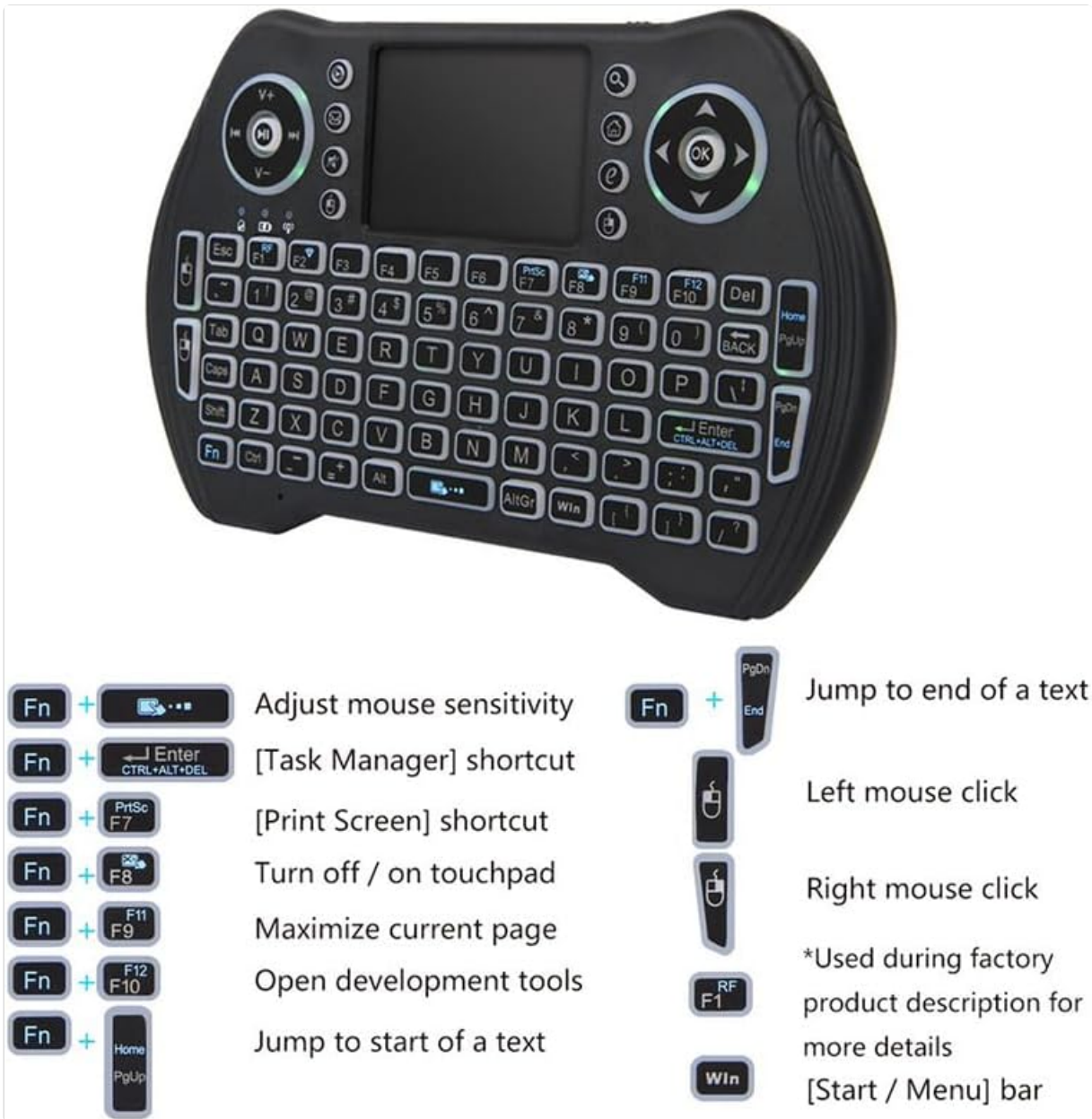
Image: A detailed view of the BOXPOT MT10 mini wireless keyboard, illustrating its full QWERTY layout, touchpad, and dedicated function keys for various shortcuts and controls.