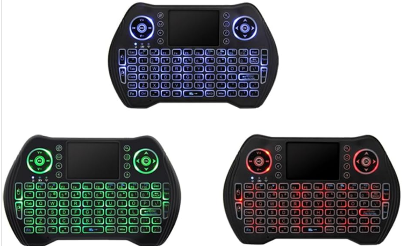
Image: Three BOXPOT MT10 mini wireless keyboards are displayed, each showing a different backlight color (blue, green, and red),