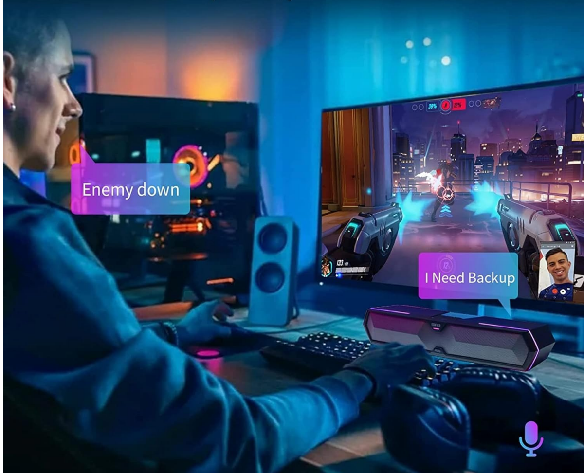
Image: Hidden Microphone in Use

You can talk in the state of Bluetooth/USB computer communication