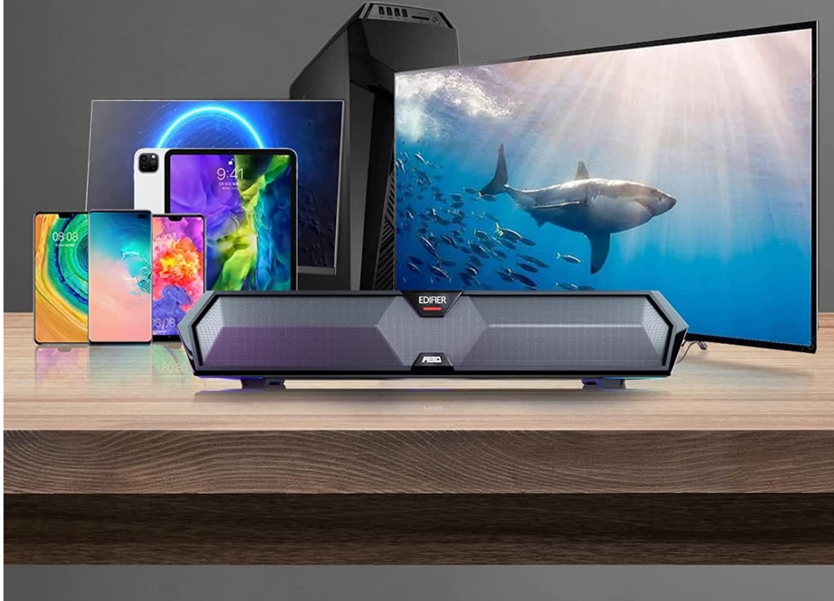
Image: Connection Options

This image illustrates the two main ways to connect the soundbar: via USB to a computer or wirelessly via Bluetooth to mobile devices.