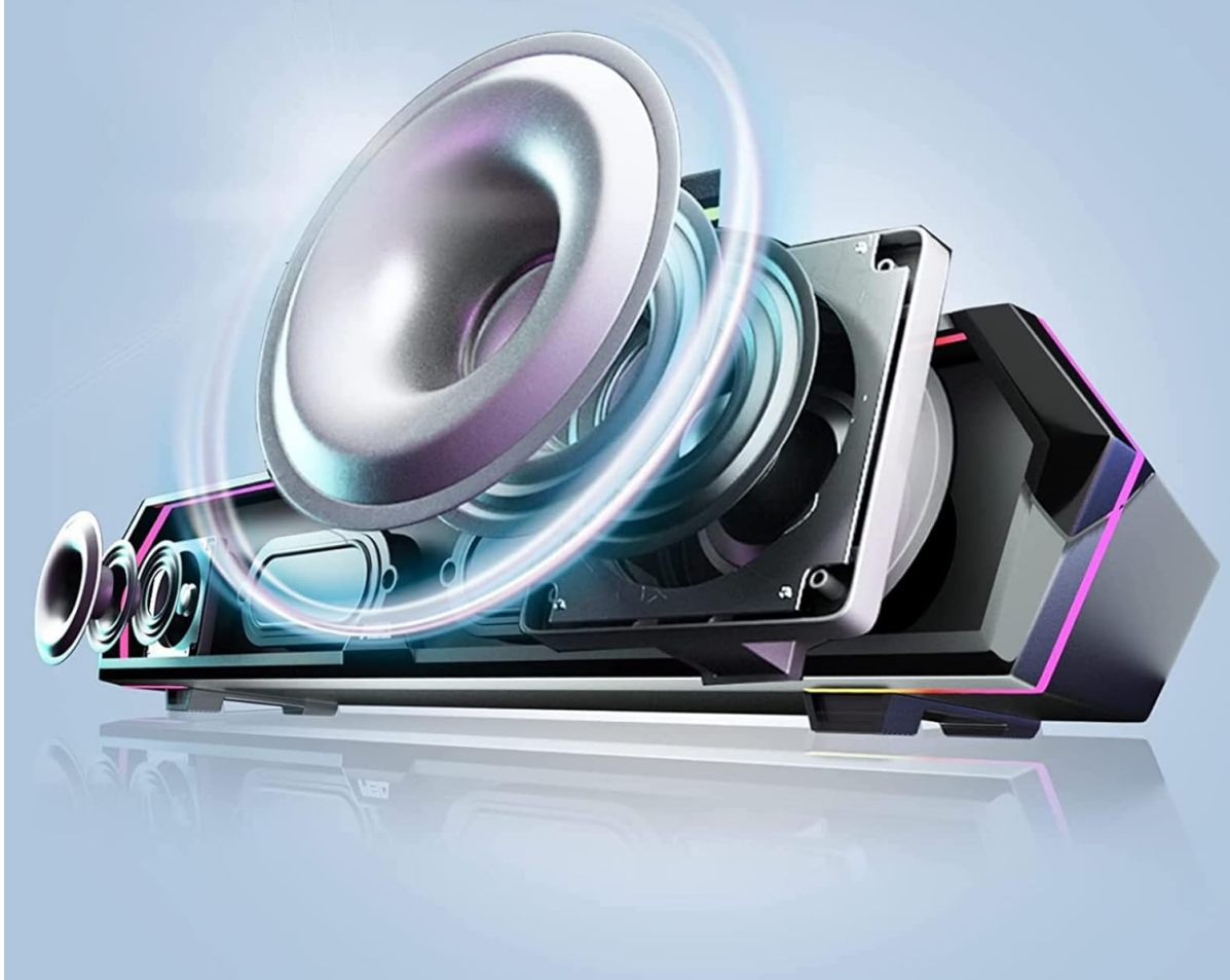
Image: Internal Speaker Components

Dual High-quality 52mm Drivers and 2 Mica Fiber Diaphragms