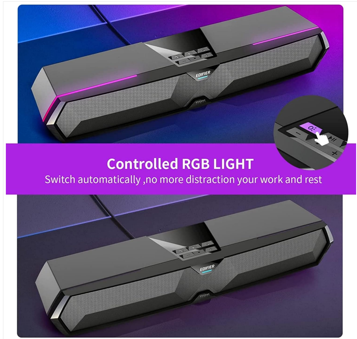
Image: RGB Light Control

The soundbar features dynamic RGB lighting effects. Press the light control button (O:) on the top panel to cycle through different lighting modes or to turn the lights off.