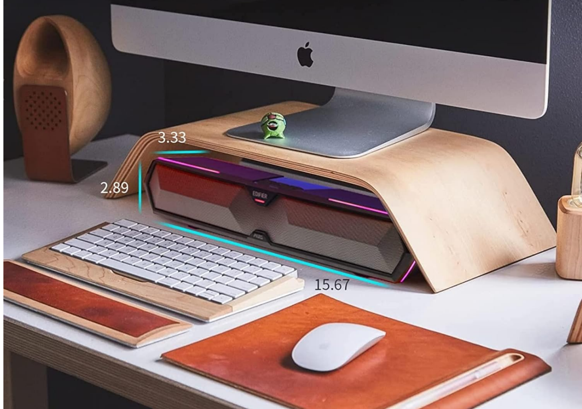
Image: Soundbar Placement

15.67 x 3.33 x 2.89 inches, better placed under computer screen to save desktop space