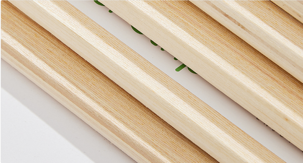
Image: An illustration demonstrating the 12-inch clearance beneath the bed frame, suitable for storage.

Image: The bed frame with a mattress and pillows, highlighting the headboard design.