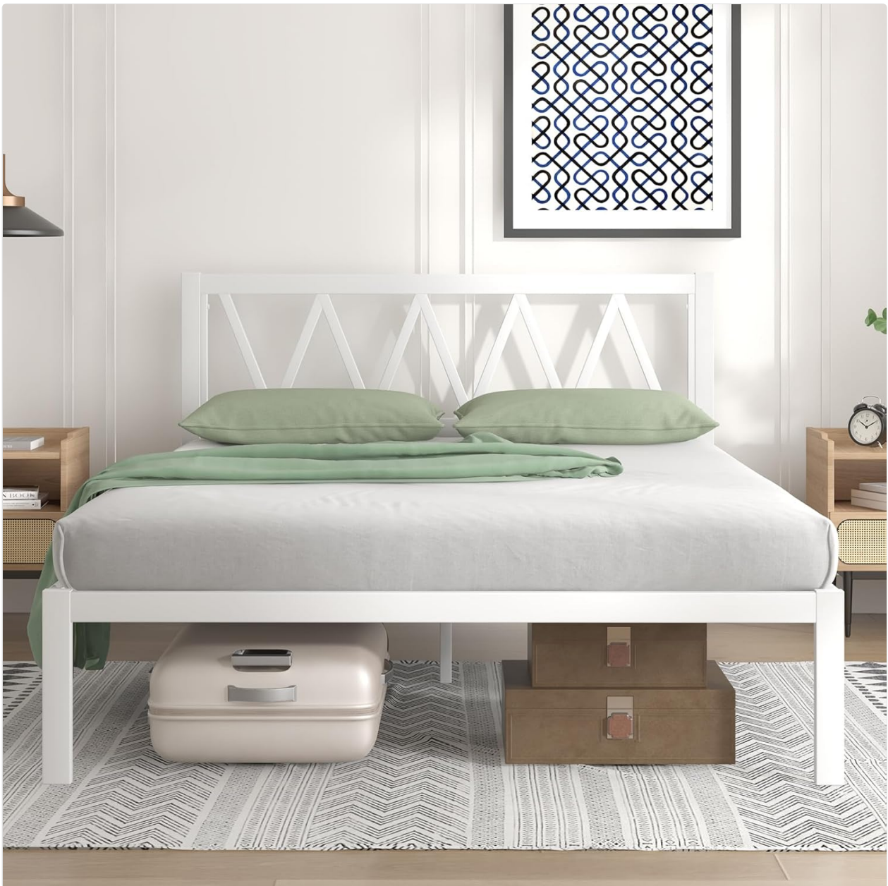
Image: Fully assembled Novilla Full Size Bed Frame with Headboard, showcasing its cream white finish and under-bed clearance.