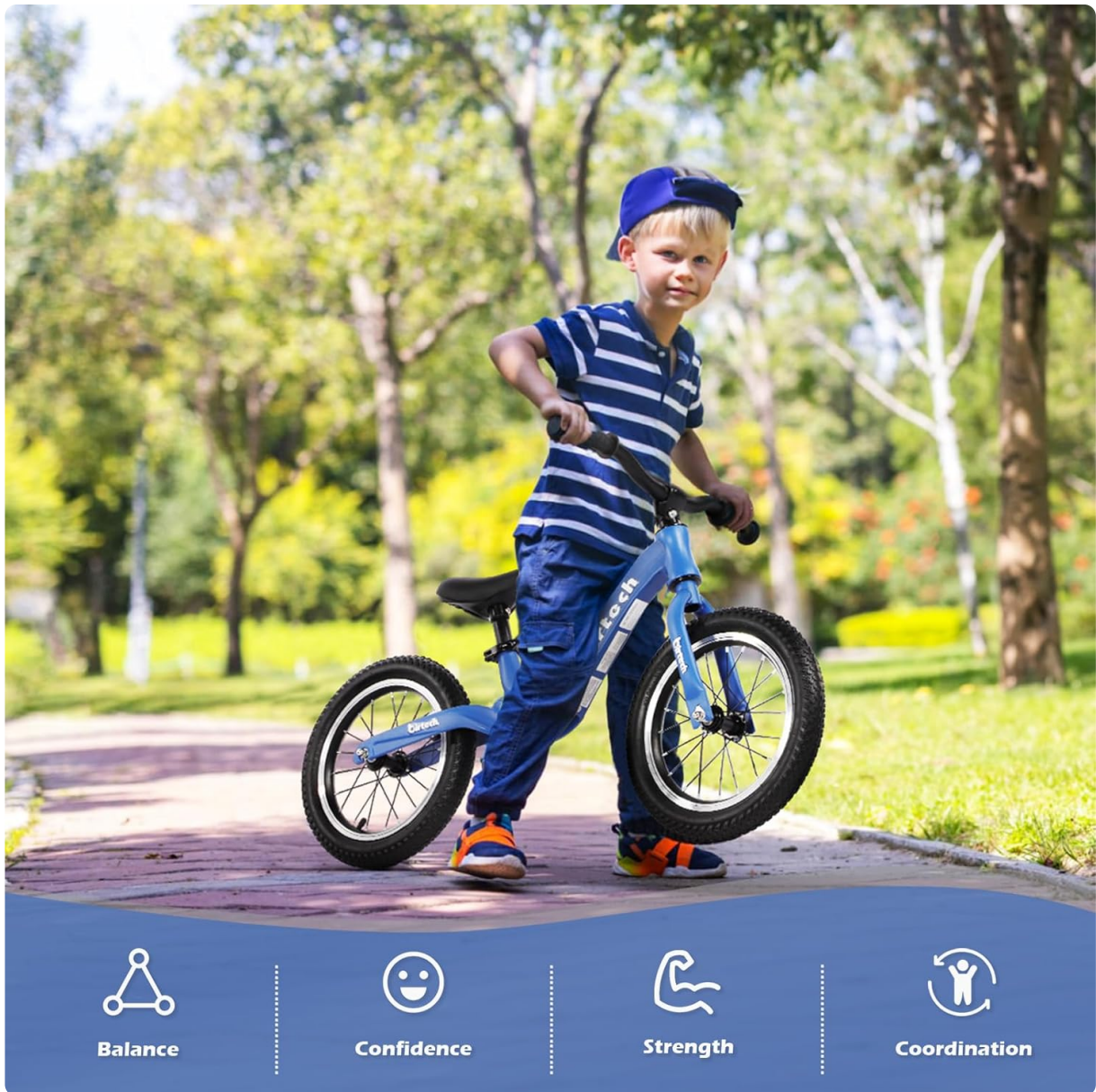
Image: A young boy confidently riding the blue Birtech balance bike on a paved path, demonstrating proper riding posture.

Your browser does not support the video tag.