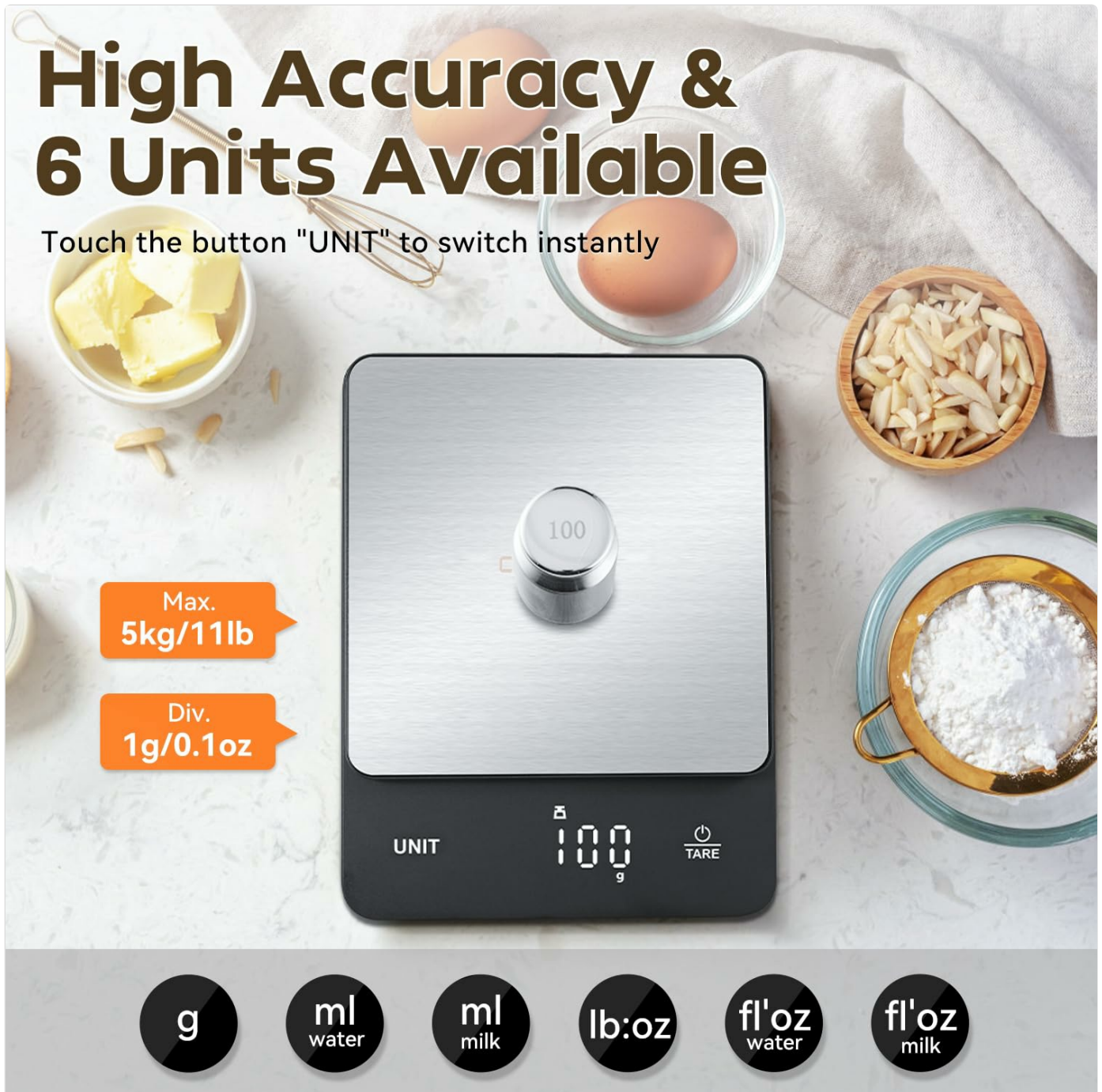
Image: The scale displaying various units of measurement (g, water ml, milk ml, lb:oz, water fl'oz, milk fl'oz) and indicating a maximum capacity of 5kg/11lb with 1g/0.1oz division.