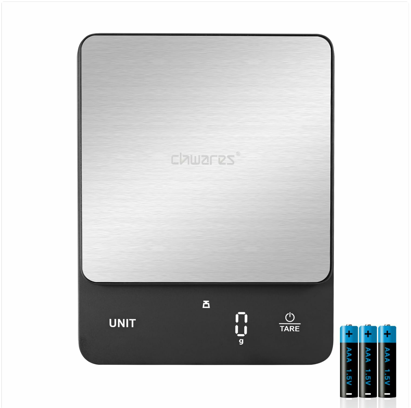
Image: The CHWARES Digital Kitchen Food Scale, showing its stainless steel platform, digital display, 'UNIT' and 'TARE' buttons, and three AAA batteries.