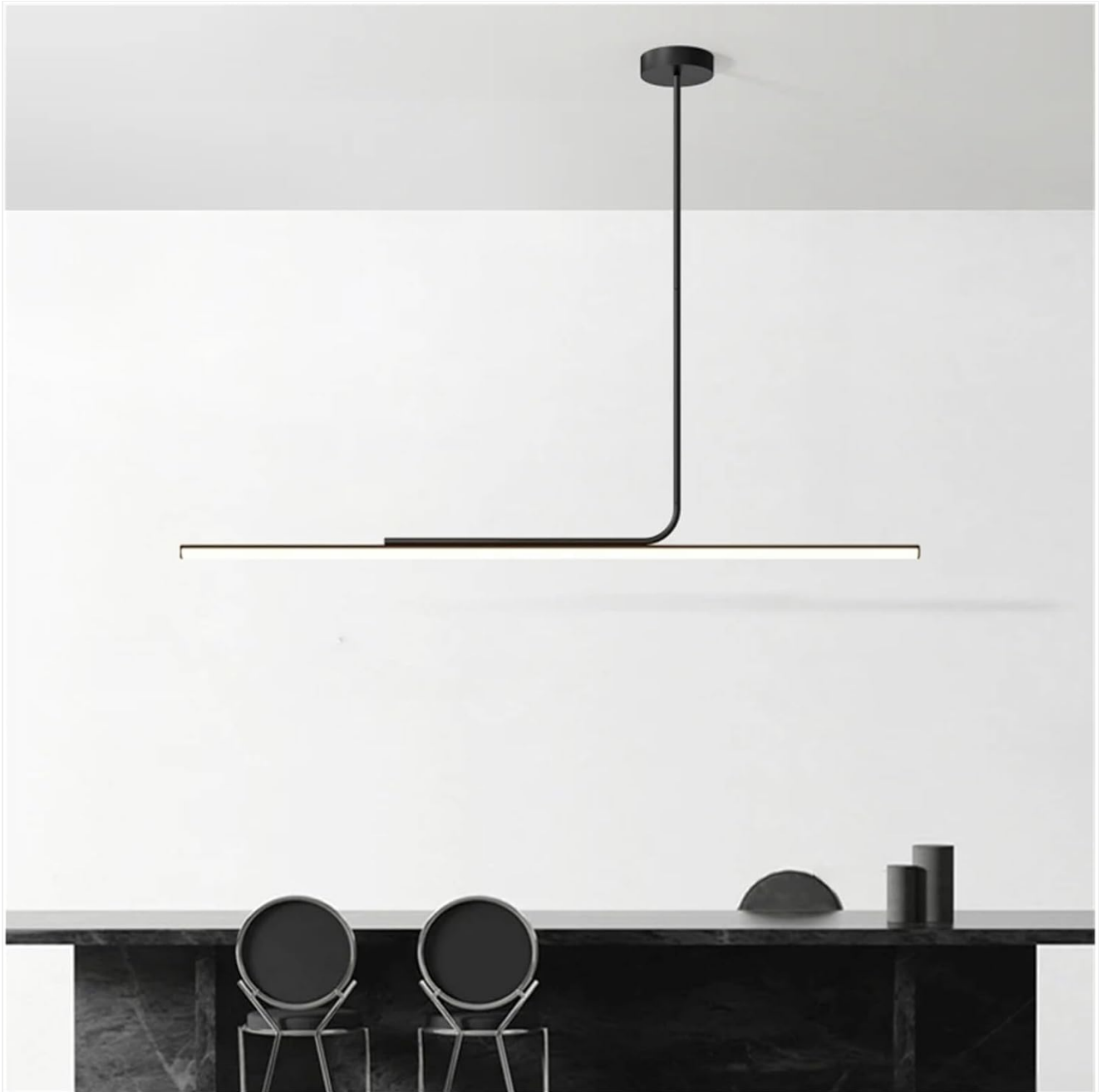
Image: The WODES Nordic Minimalist LED Pendant Light, 120cm black version, installed above a dining table, demonstrating its modern and clean appearance.