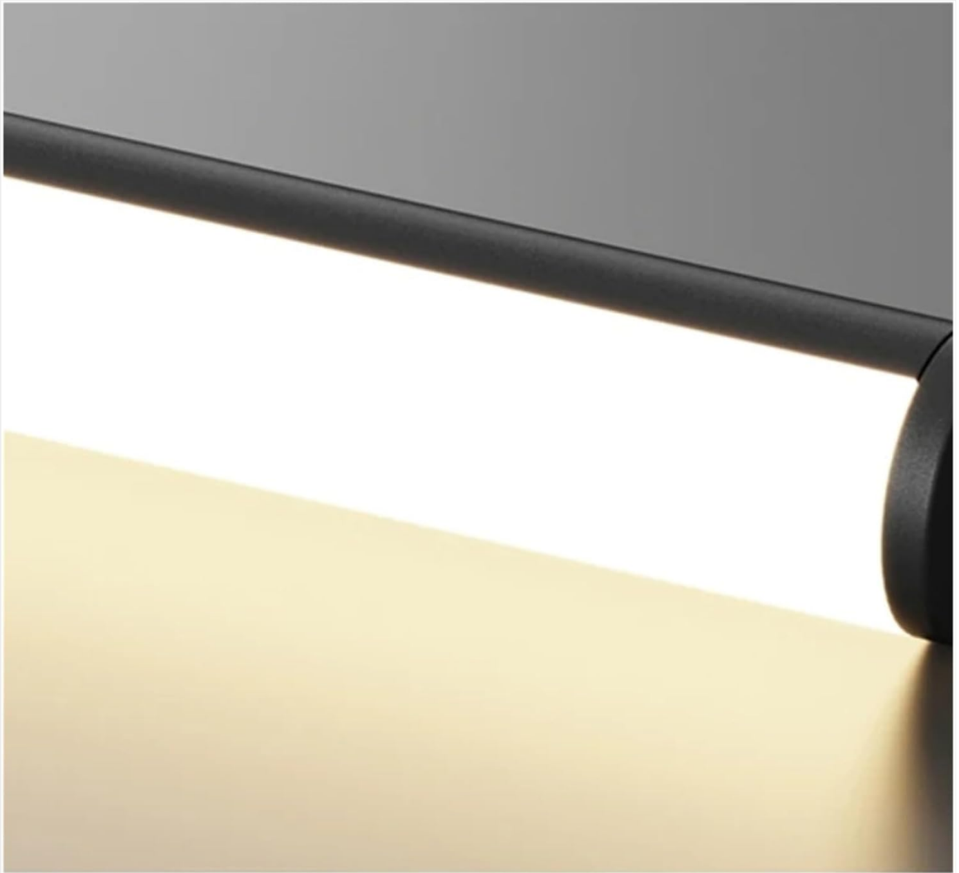
Image: A detailed view of the integrated LED light source within the pendant light's linear design, highlighting its seamless illumination.